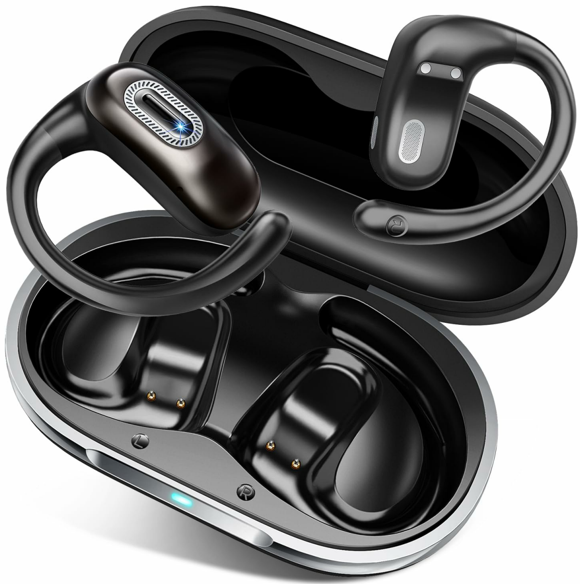
Image: Qecnato Q77 Open Ear Headphones in their charging case.