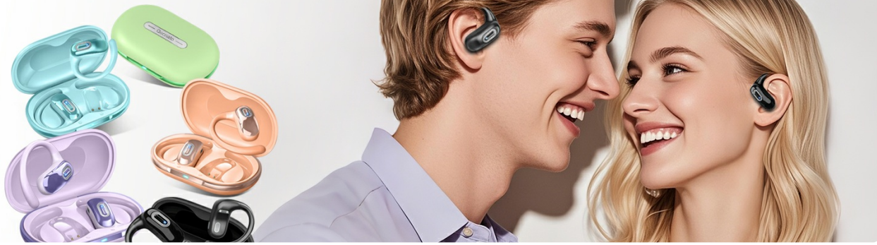
Image: All components included in the Qecnato Q77 package.