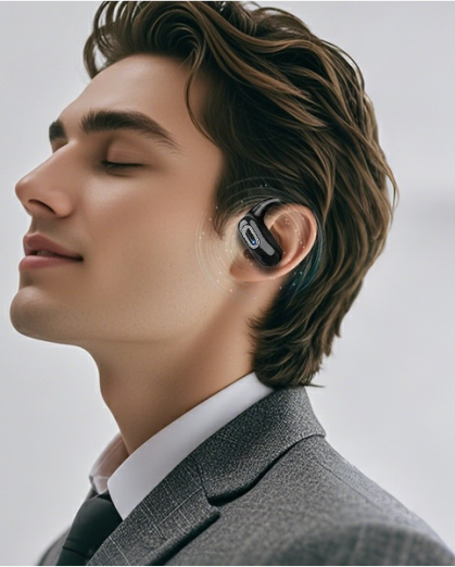
Image: IPX7 water resistance protects against sweat and splashes.

More Transparent and Comfortable for Ears