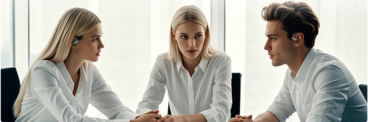
Image: Bluetooth 5.4 technology ensures fast and stable pairing with your devices.

Stay Aware, Everywhere Stay connected with your favorite audio and yoursurroundings at the same time.