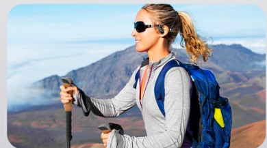
Image: Step-by-step guide for wearing the Qecnato Q77 Open Ear Headphones.