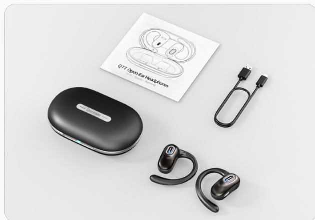
Image: Dual-mic noise cancellation ensures clear calls in various settings.