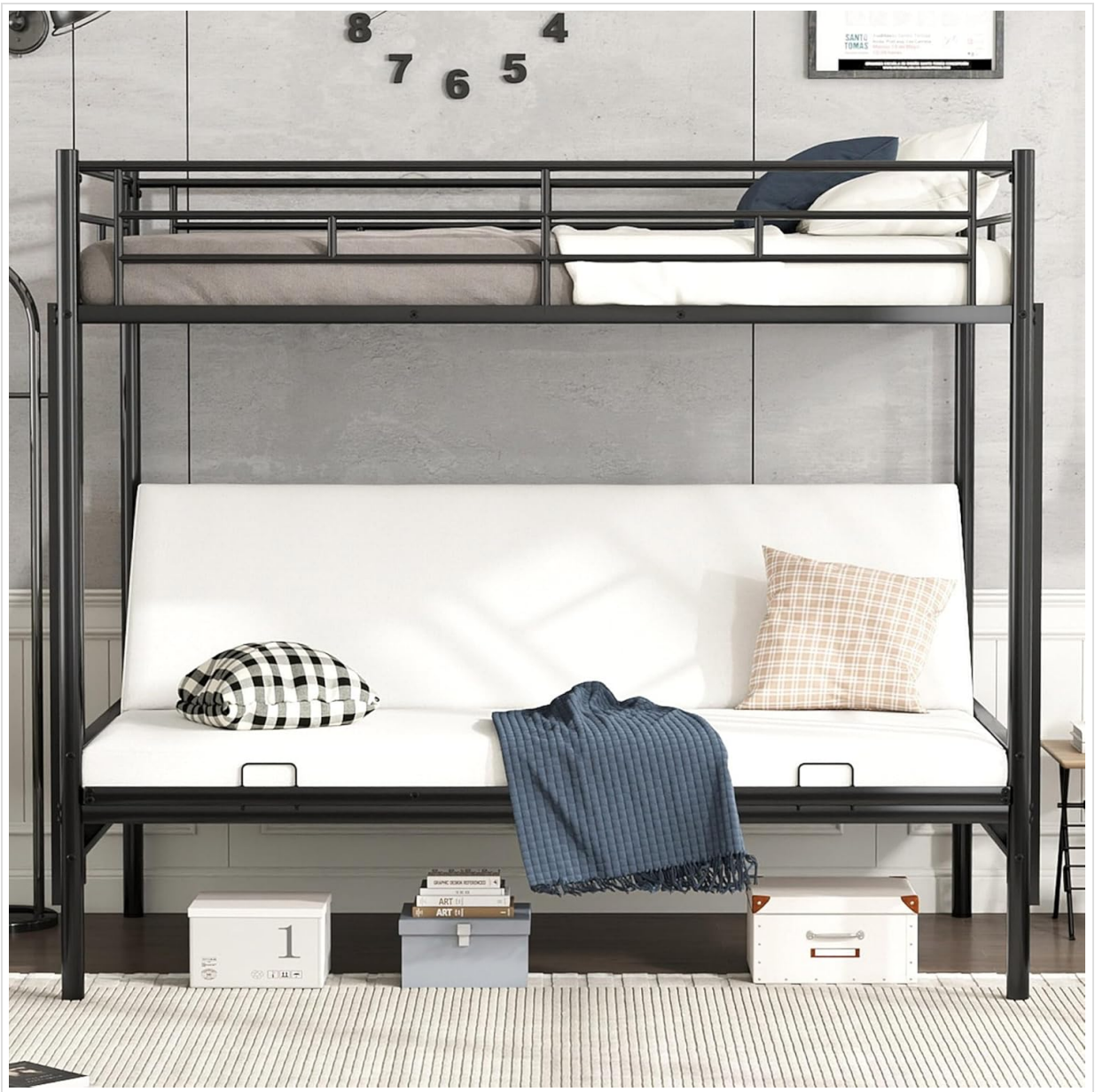
Image: The futon in its upright sofa configuration, suitable for seating.