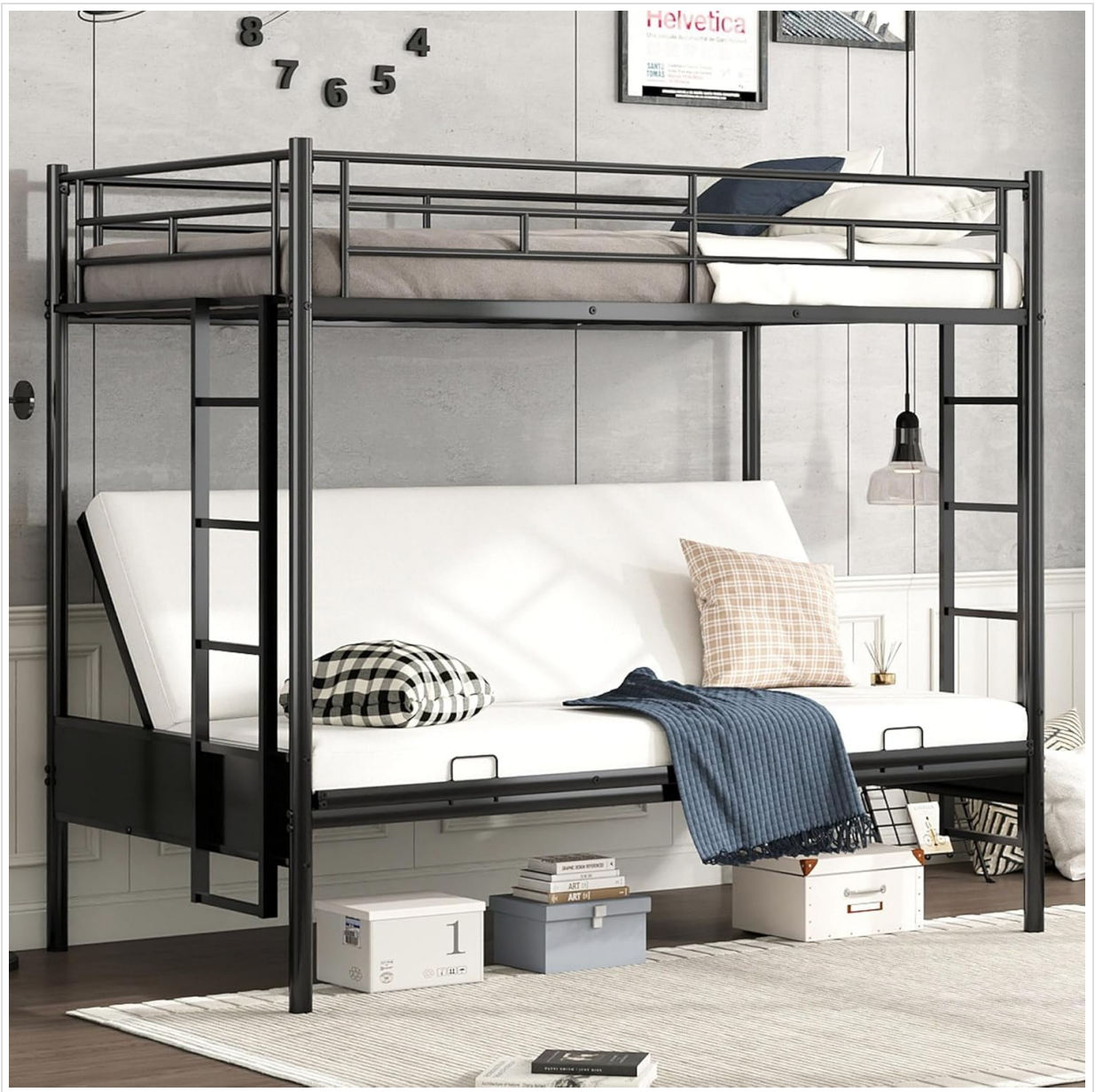
Image: Bellemave Twin Over Futon Bunk Bed with futon in sofa position, featuring a black metal frame.