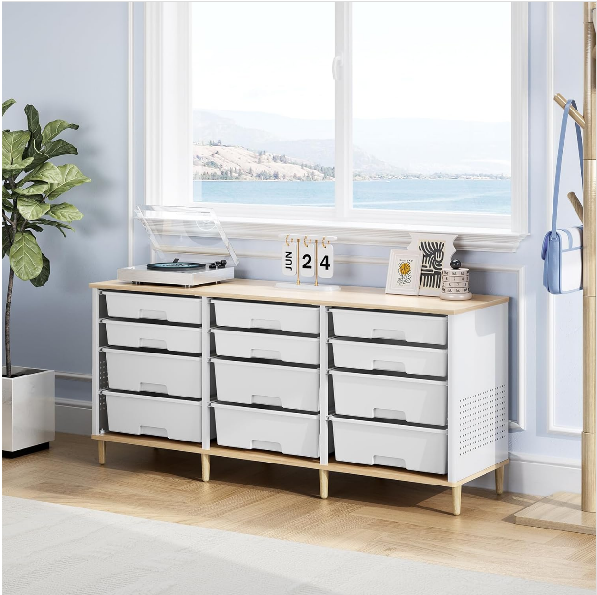
Image: Example of items stored in the drawers. This image shows the cabinet in use, with different types of items organized within the plastic bins, demonstrating its storage versatility.