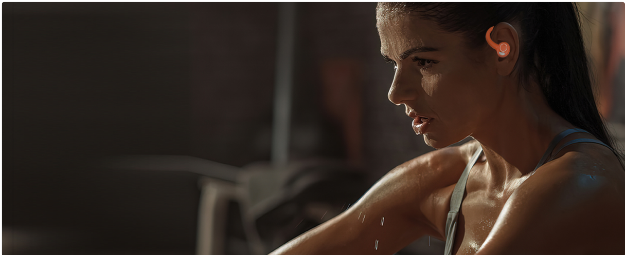
Image: IP7 dust and water resistance for active use.

The earbuds feature an IP7 waterproof rating, providing protection against sweat and rain. This makes them suitable for workouts and outdoor activities.