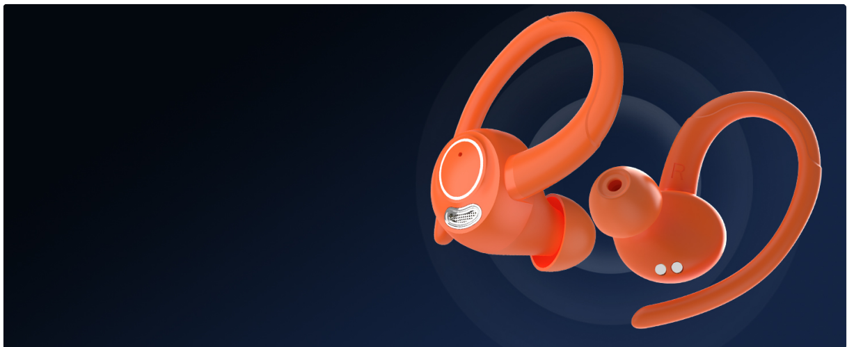
Image: Dual ENC microphones for noise cancellation.

The earbuds feature 4 ENC (Environmental Noise Cancellation) microphones to filter out ambient noise, ensuring your voice is clear during calls, even in noisy environments.