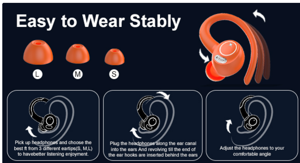
Image: Instructions for stable wearing of the earbuds.