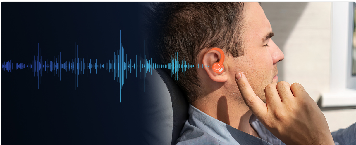
Image: One-step auto-pairing process.

Your browser does not support the video tag.