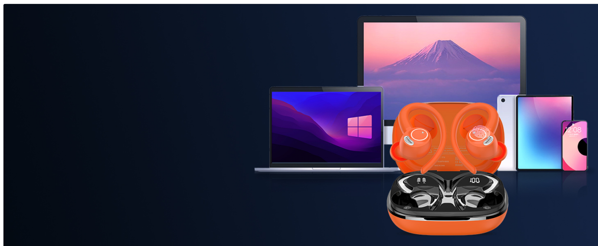
Image: Contents of the Jesebang YT18 Wireless Earbuds package.