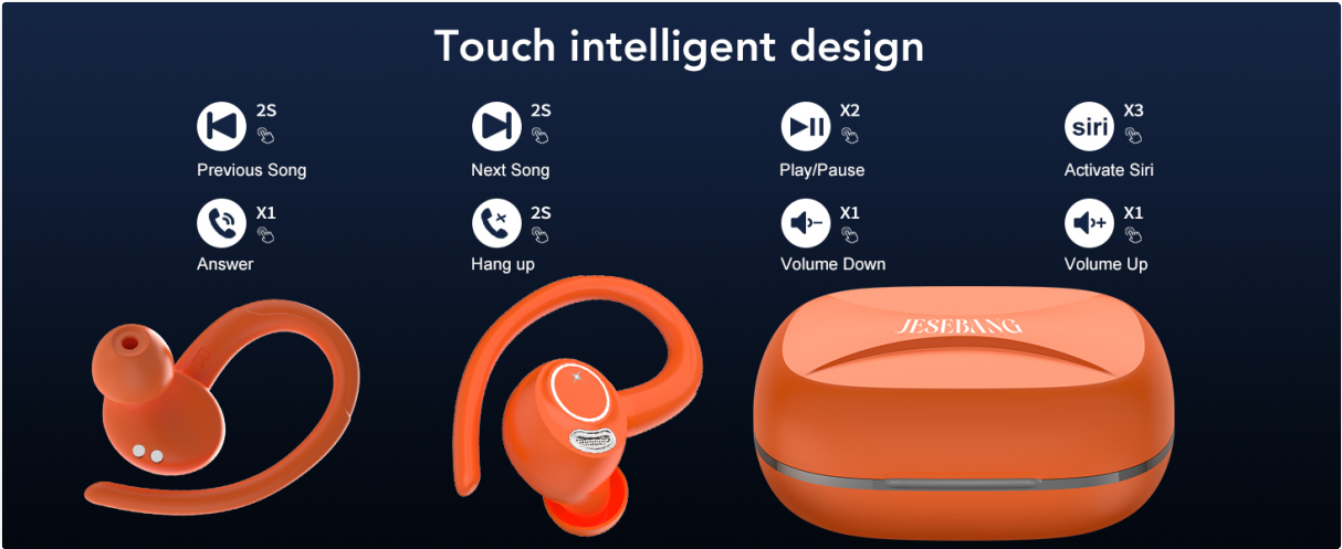
Image: Touch control functions diagram.