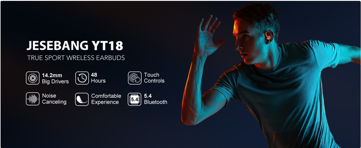
Image: Advanced Bluetooth 5.4 technology.

The earbuds utilize Bluetooth 5.4 technology for a stable and efficient wireless connection. This technology provides faster transmission speeds and a connection range of up to 15 meters.