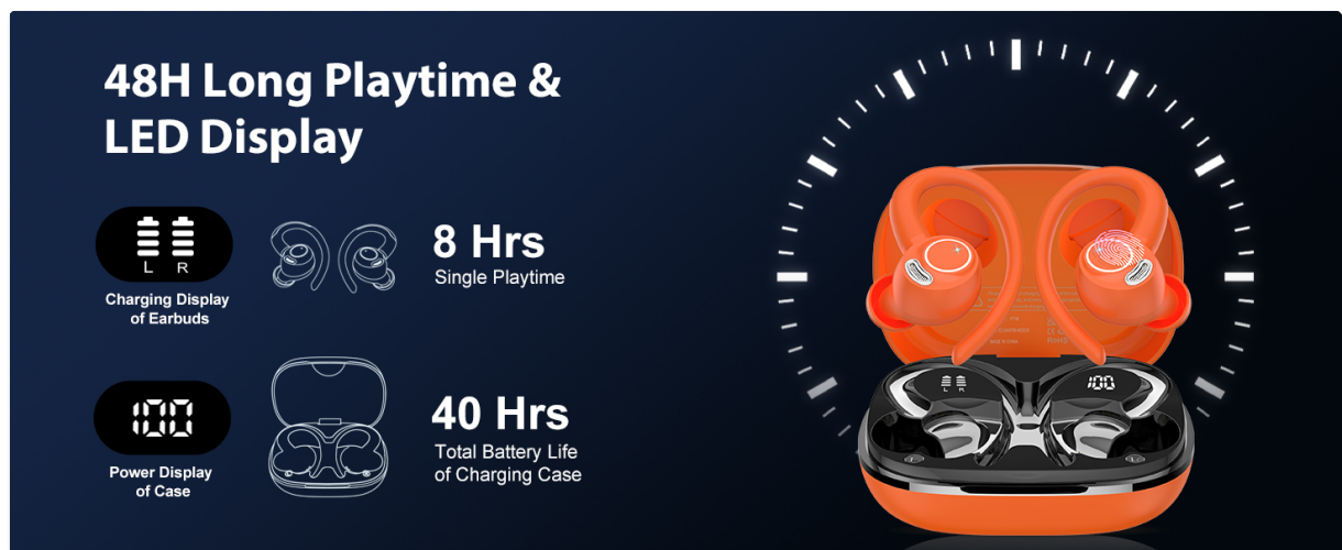
Image: Battery life indicators for earbuds and charging case.