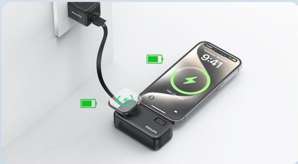
Figure 4.4: The power bank, an Apple Watch, and a smartphone all charging simultaneously from a single wall outlet via the pass-through function.