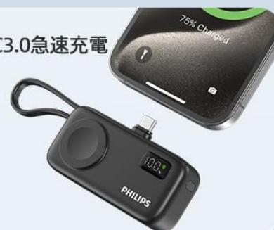
Figure 2.2: Overview of the 3-in-1 compact mobile power bank's features, including Apple Watch compatibility, foldable Type-C connector, compact size, 5000mAh capacity, and PD&QC3.0 fast charging.