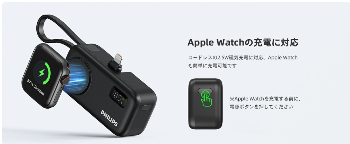
Figure 4.3: Visual instruction to press the power button before initiating Apple Watch charging.