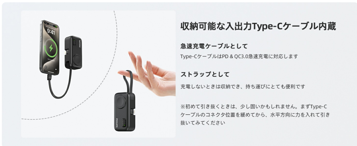
Figure 3.2: Demonstrates the built-in Type-C cable, which can be used for charging and stored as a strap.

When pulling out the cable for the first time, it might be slightly stiff. Gently loosen the connector position first, then pull it out horizontally to avoid damage.