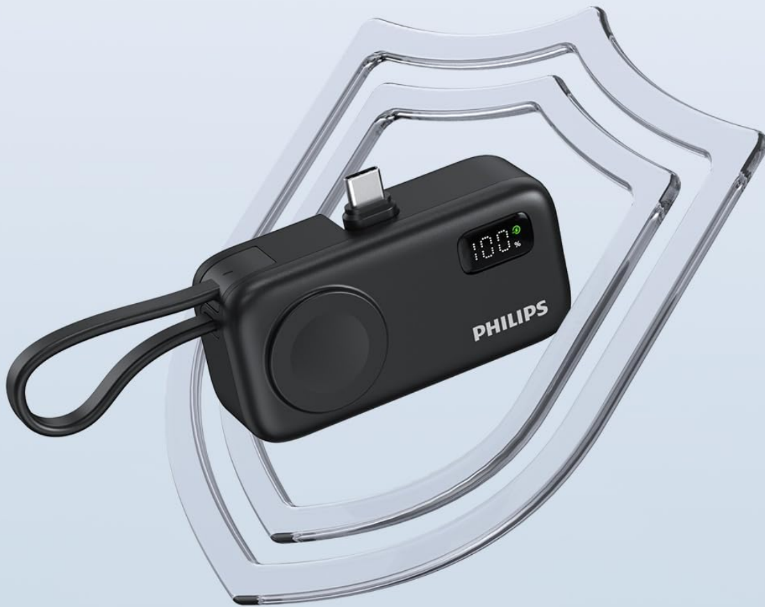
Figure 7.1: The power bank is equipped with four safety protection systems: overcharge, over-discharge, overcurrent, and short-circuit protection.