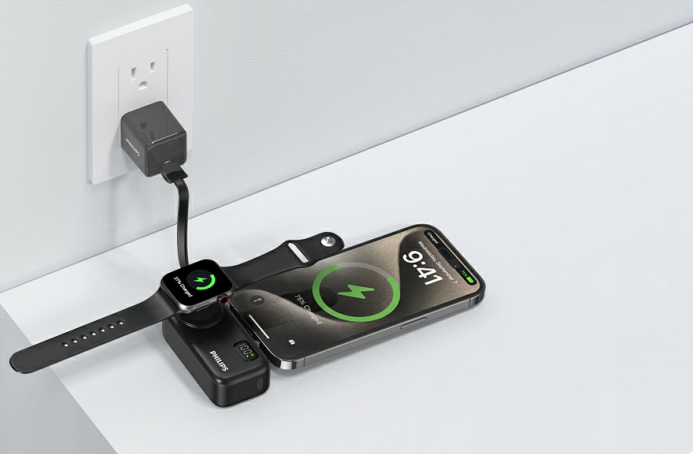
Figure 4.5: An illustration of the pass-through charging feature, showing the power bank recharging itself while also charging an Apple Watch and a smartphone.