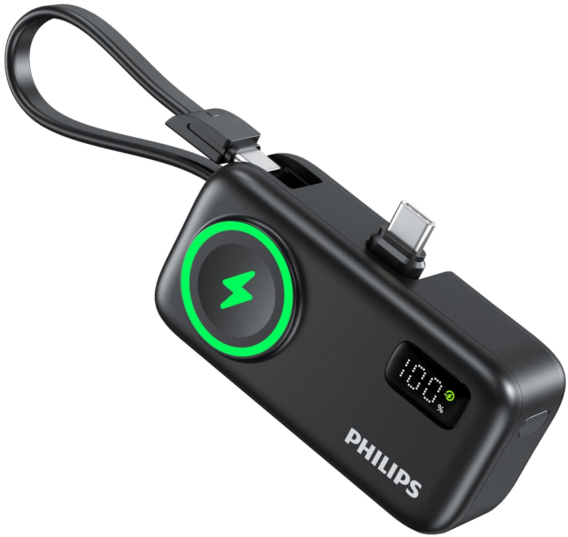
Figure 2.1: Philips DLP2557CB Mobile Power Bank (Black)