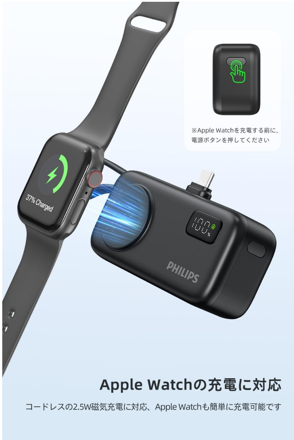
Figure 4.2: An Apple Watch being charged wirelessly by the power bank's magnetic charging pad.