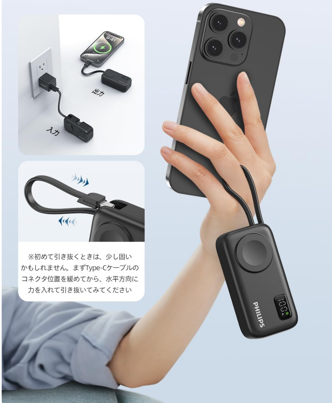
Figure 4.1: The power bank directly connected to an iPhone via its foldable USB-C connector, and an Android phone connected via the built-in Type-C cable.

※初めて引き抜くときは、少し固いかもありません。まずType-Cケーブルのコネクタ位置を緩めてから、水平方向に力を入れて引き抜いてみてください