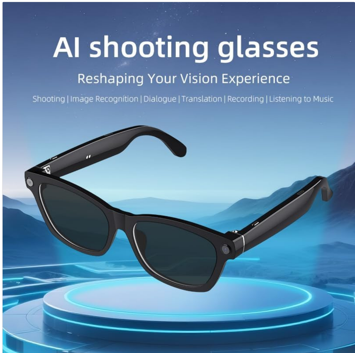
Figure 5.1: The integrated camera lens on the smart glasses, capable of 1080P HD video recording.

Capture hands-free 1080P HD video of your surroundings.