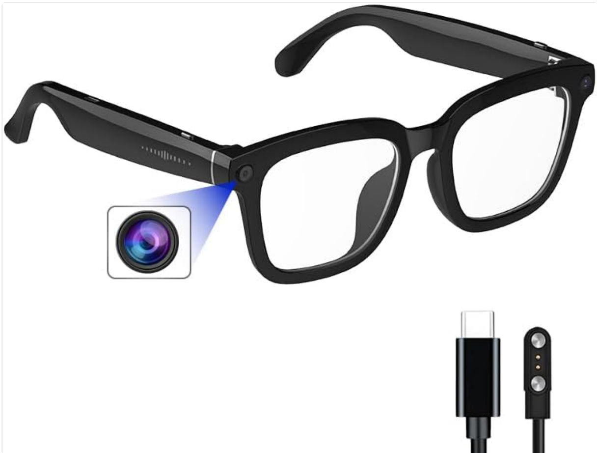
Figure 3.1: Front view of the KOIPSSE AI Smart Camera Glasses V03, showing the integrated camera lens and sleek design.