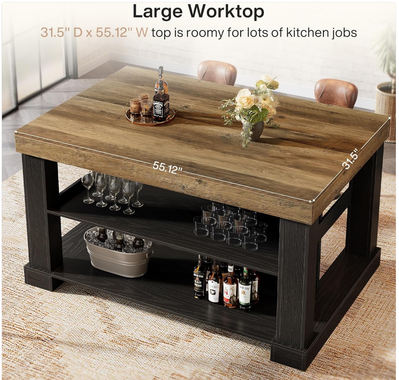
Image: Dimensional diagram of the bar table, illustrating overall size and internal shelf measurements.

31.5" D x 55.12" W top is roomy for lots of kitchen jobs