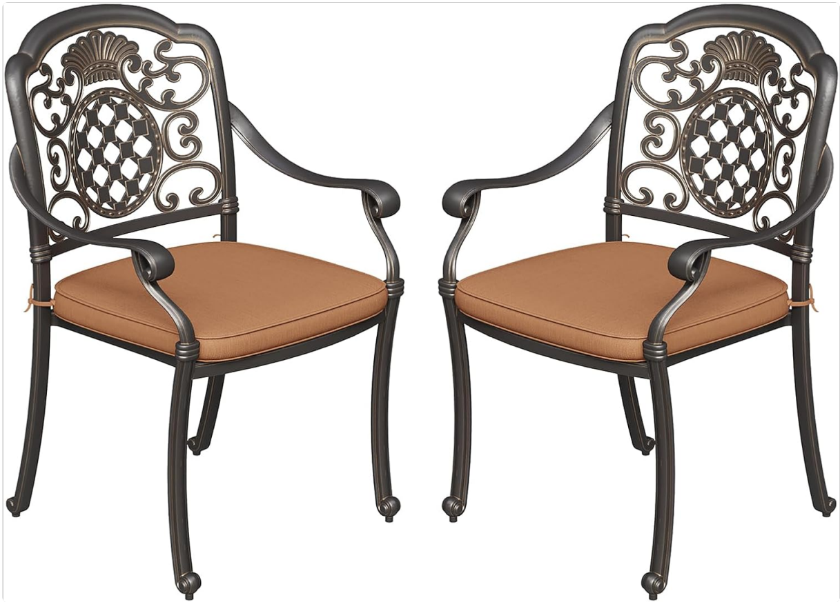
Image: Two Garvee patio dining chairs with cushions, featuring a dark bronze finish and intricate backrest design, set in an outdoor garden area.