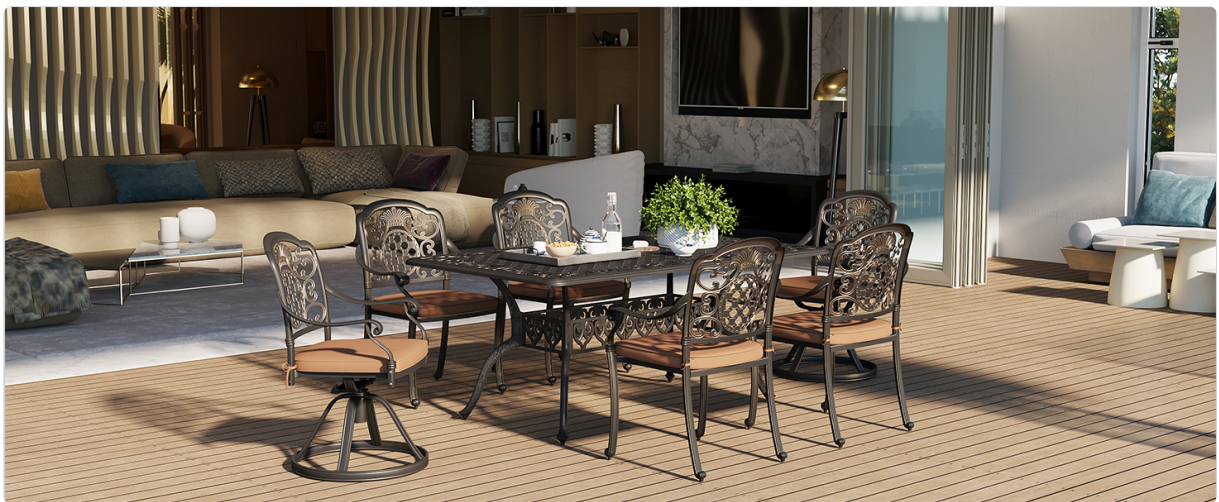
Image: Examples of the chairs being used in various outdoor environments, including by a pool, in a backyard, a garden, and on a deck.