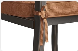
Fixing Strap and Zipper