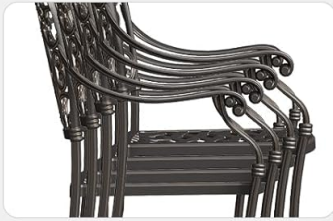
Stackable and Free to Organize