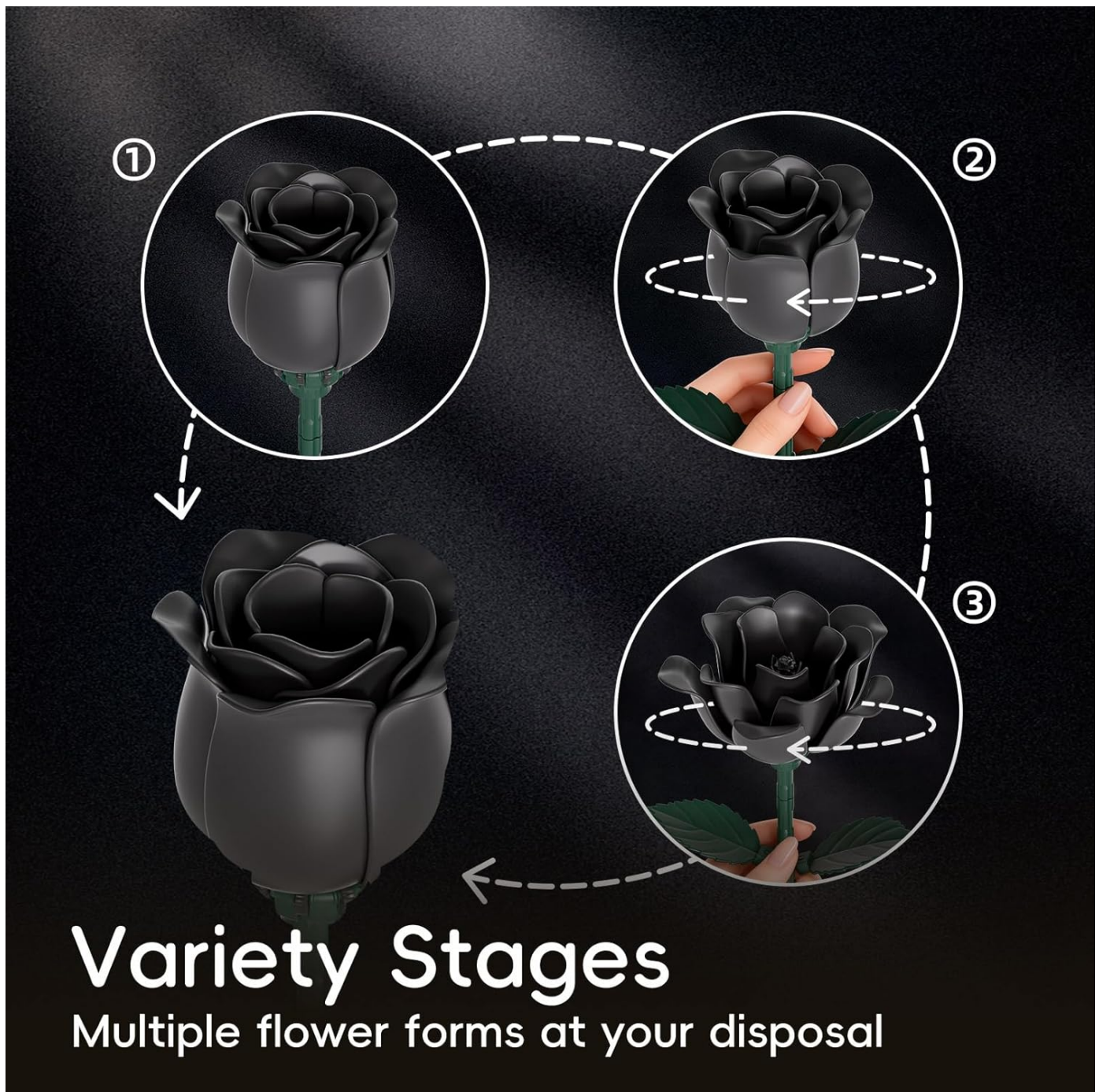
Image: Visual representation of the various blooming stages achievable with the adjustable rose petals.

You can customize each rose to be a bud, half-open, or fully bloomed to suit your display preferences.