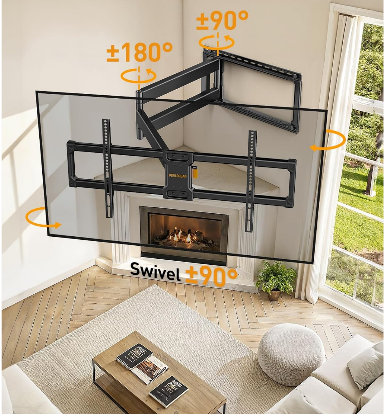
Image: Illustrates the multi-zone viewing capabilities with \pm 90^\circ swivel and \pm 4^\circ leveling adjustments, showing the TV angled and leveled in a living room environment.