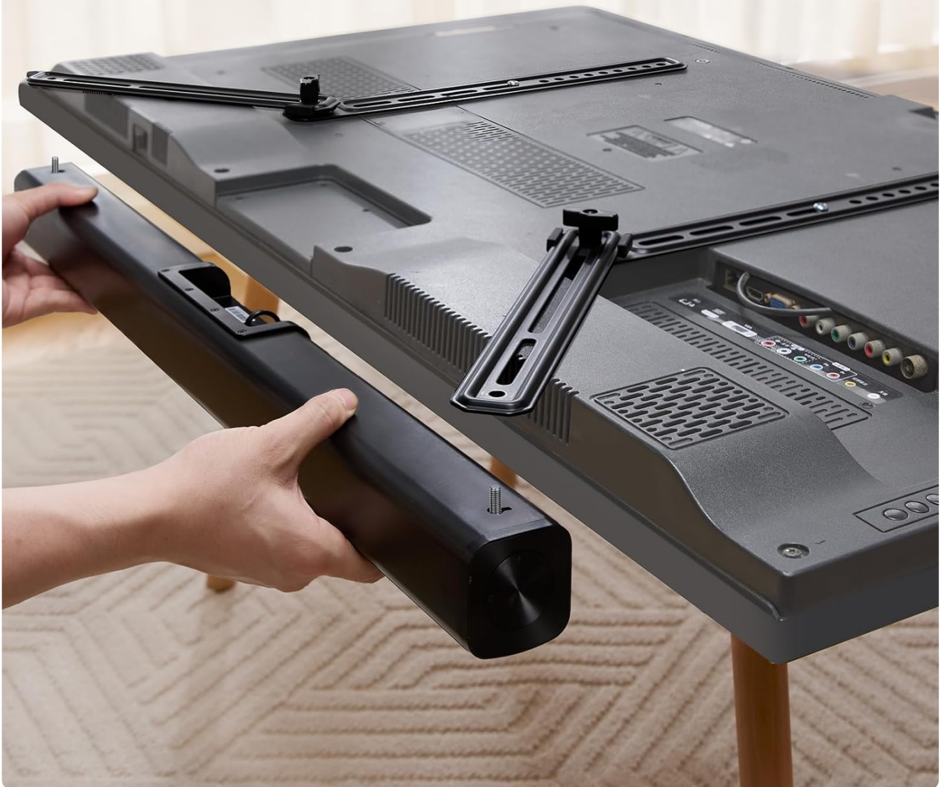
Image: Shows the height adjustment feature of the soundbar mount, highlighting how the brackets can be moved up and down to achieve a snug fit with the TV or adjust the gap.