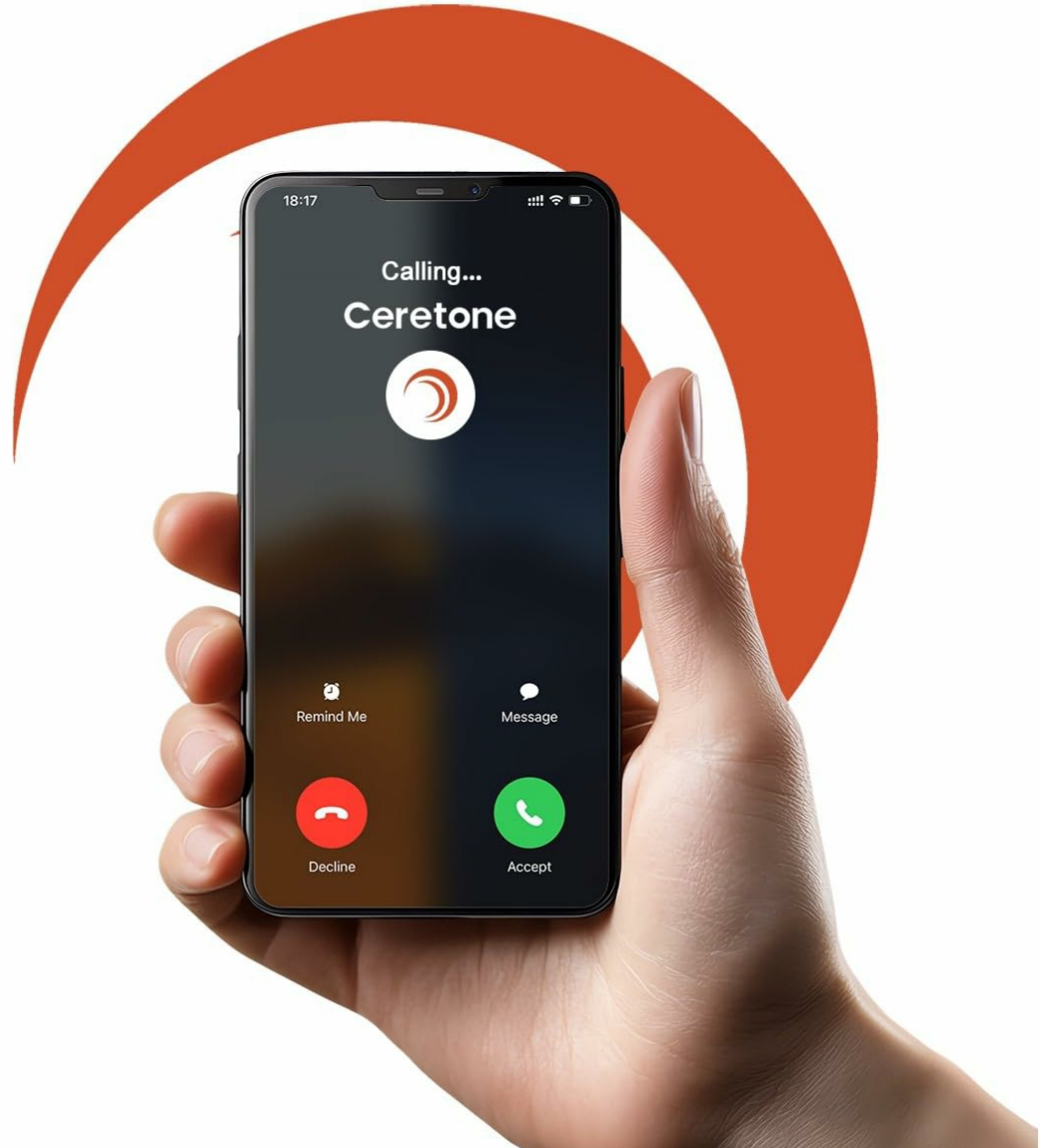
Image: A hand holding a smartphone displaying a call screen with 'Ceretone' and options to 'Remind Me', 'Message', 'Decline', or 'Accept' a call, symbolizing lifetime customer support.

Lifetime US-based Customer Support from Ceretone Team. Access to Additional Ceretone Hearing Benefits