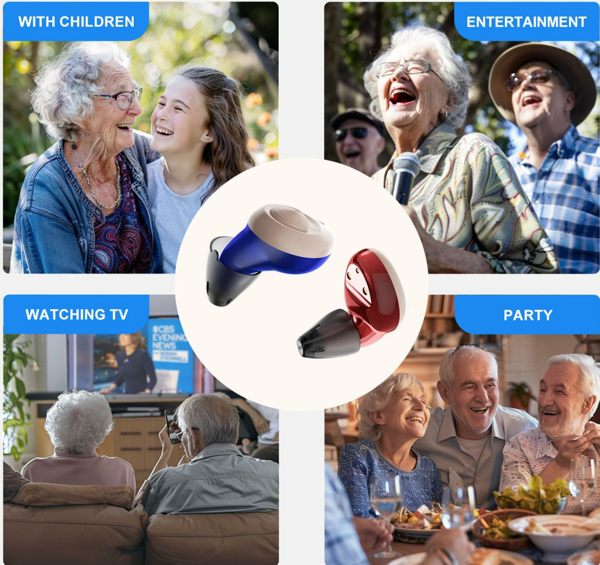
Image: Four scenarios (with children, entertainment, watching TV, party) illustrating the versatility of Ceretone hearing aids in various environments.