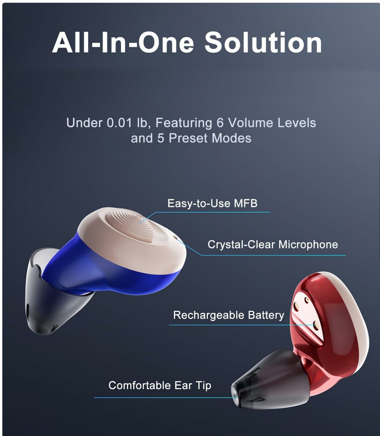
Image: Diagram illustrating the components of the hearing aid, including the easy-to-use multi-function button (MFB), crystal-clear microphone, rechargeable battery, and comfortable ear tip.