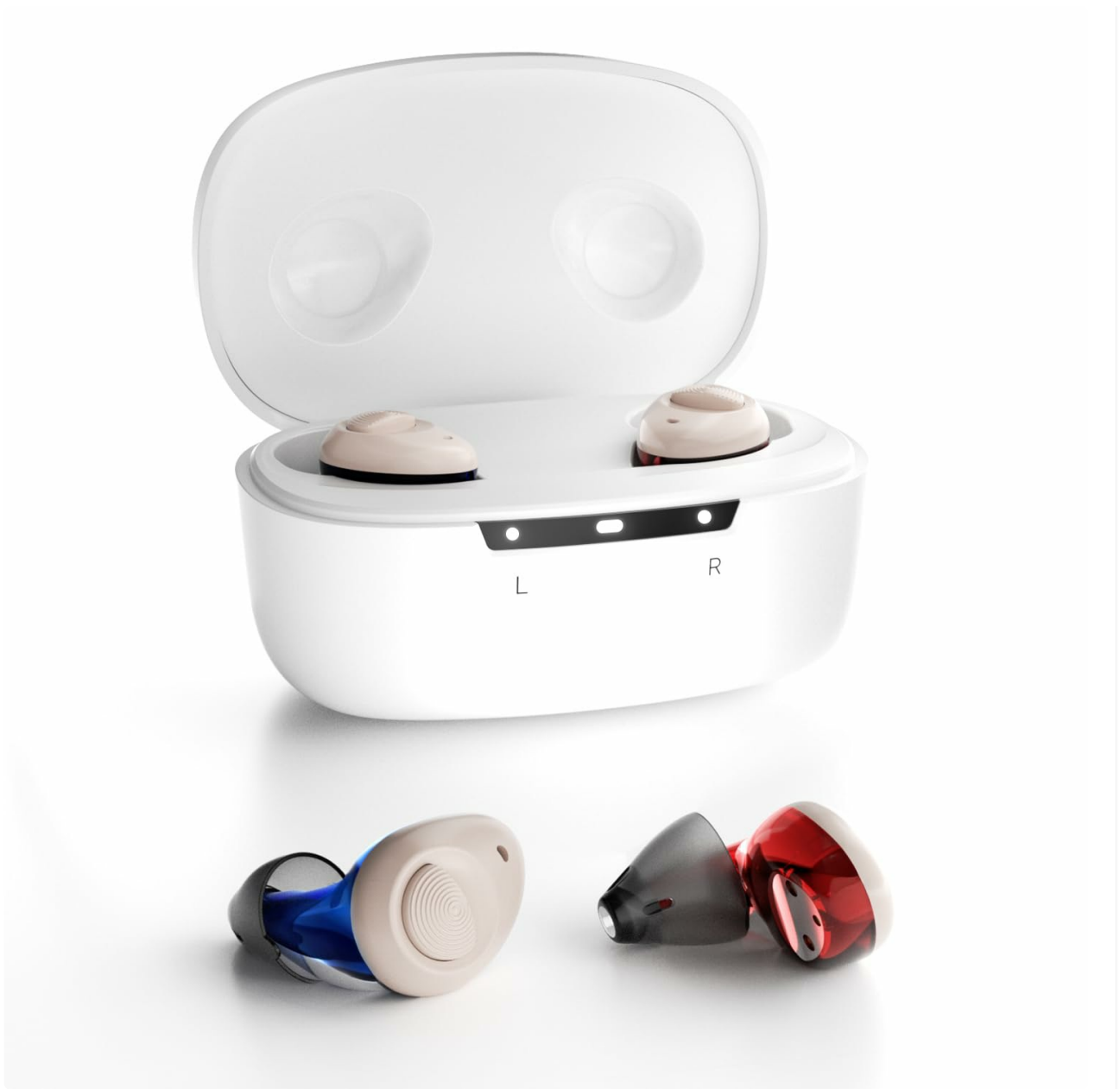
Image: Ceretone OTC Hearing Aids in their charging case, with one blue and one red hearing aid shown separately.