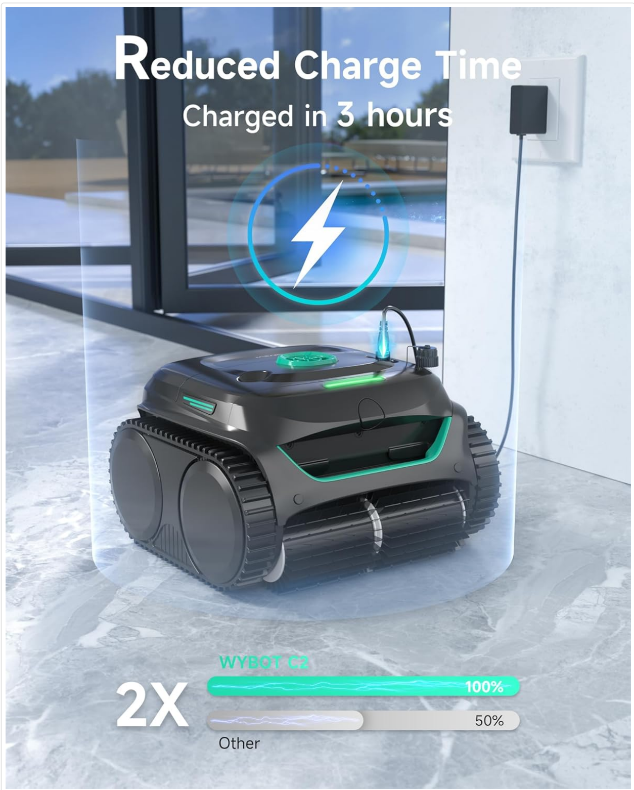
The WYBOT C2 connected to its power adapter for charging, illustrating its reduced charge time of 3 hours compared to other models.