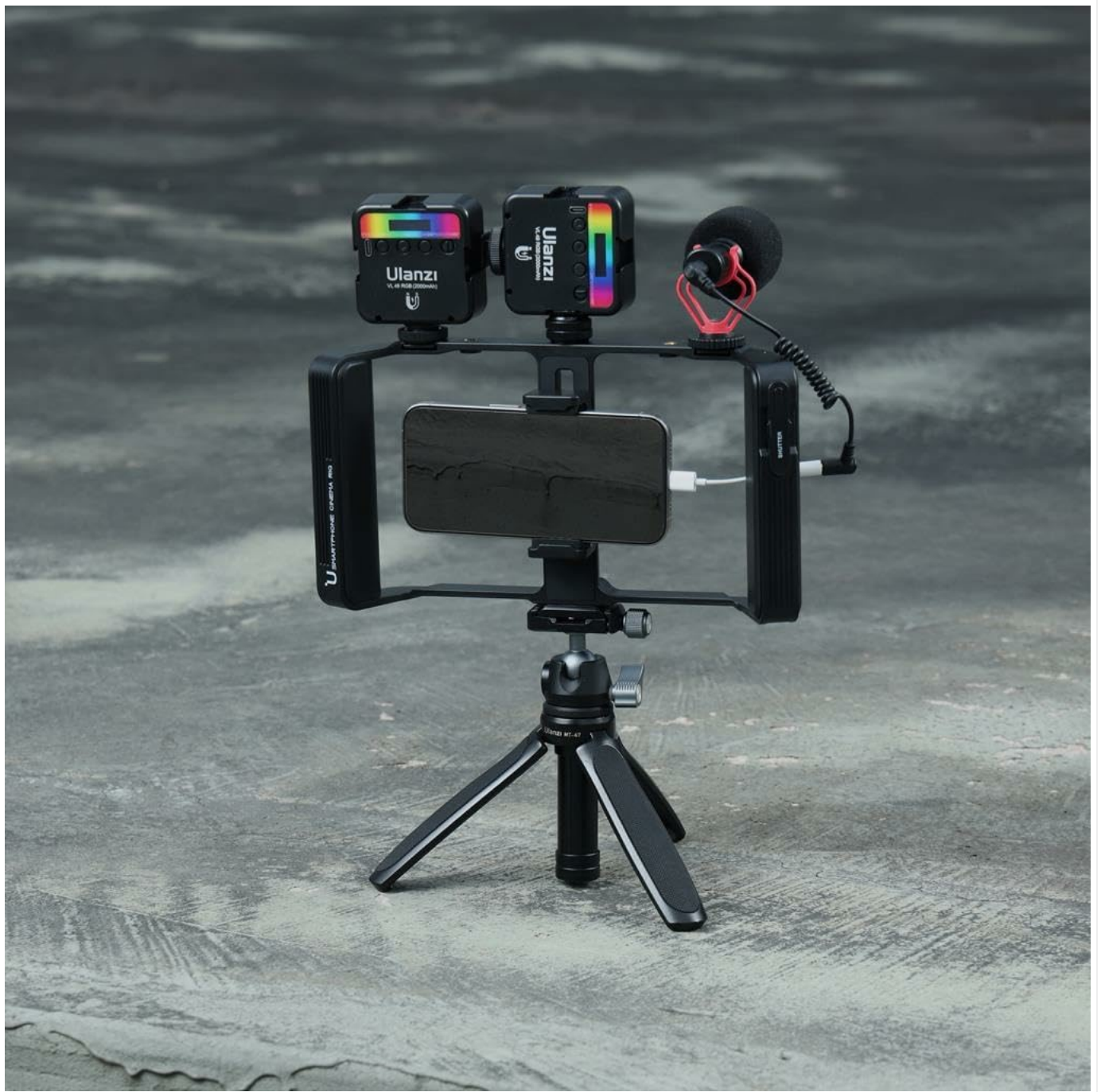
Image: The Ulanzi MA05 phone cage fully equipped with a smartphone, two LED lights, and an external microphone, all mounted on a tripod for a complete mobile video setup.