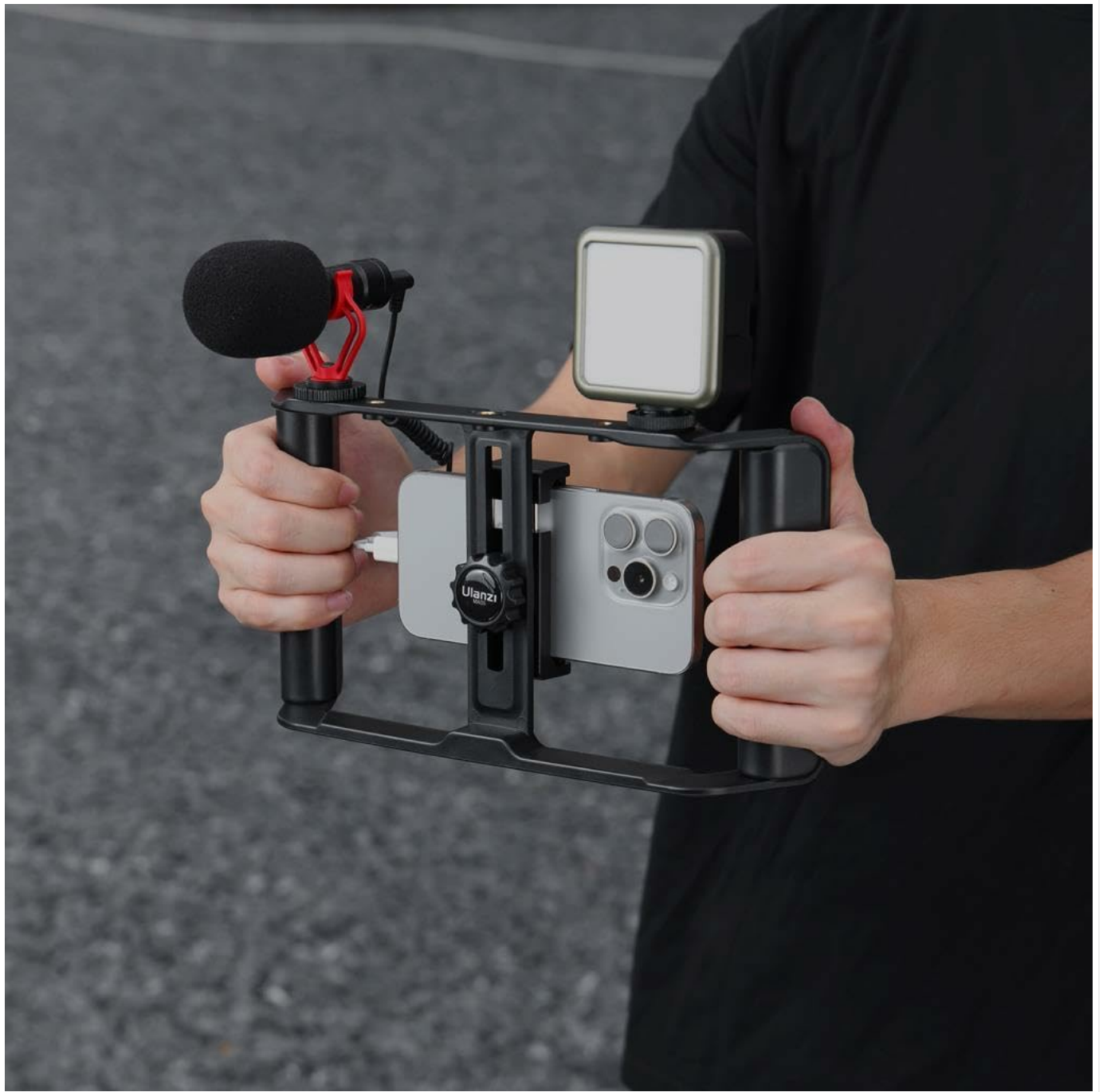
Image: A person holding the Ulanzi MA05 phone cage with a smartphone, microphone, and LED light, showcasing its ergonomic design for handheld video recording.