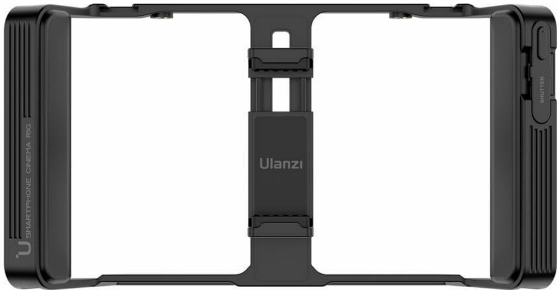
Image: The Ulanzi MA05 phone cage shown in its vertical configuration, ready for use.