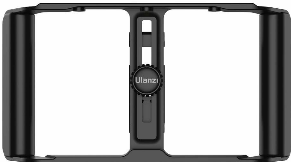
Image: The Ulanzi MA05 phone cage shown in its horizontal configuration, ready for use.