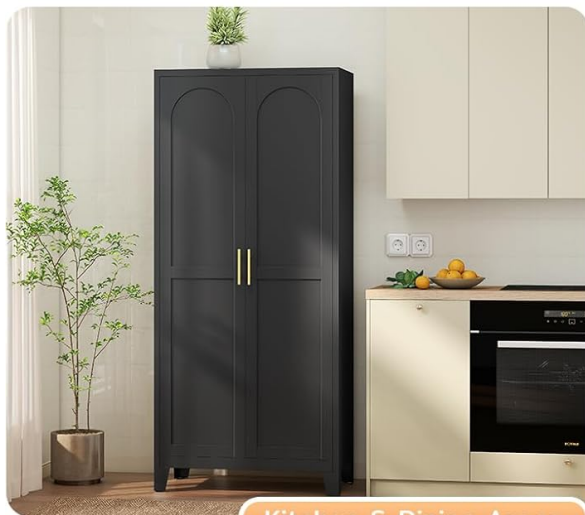
Kitchen & Dining Areas

Smart storage that fits your daily needs.