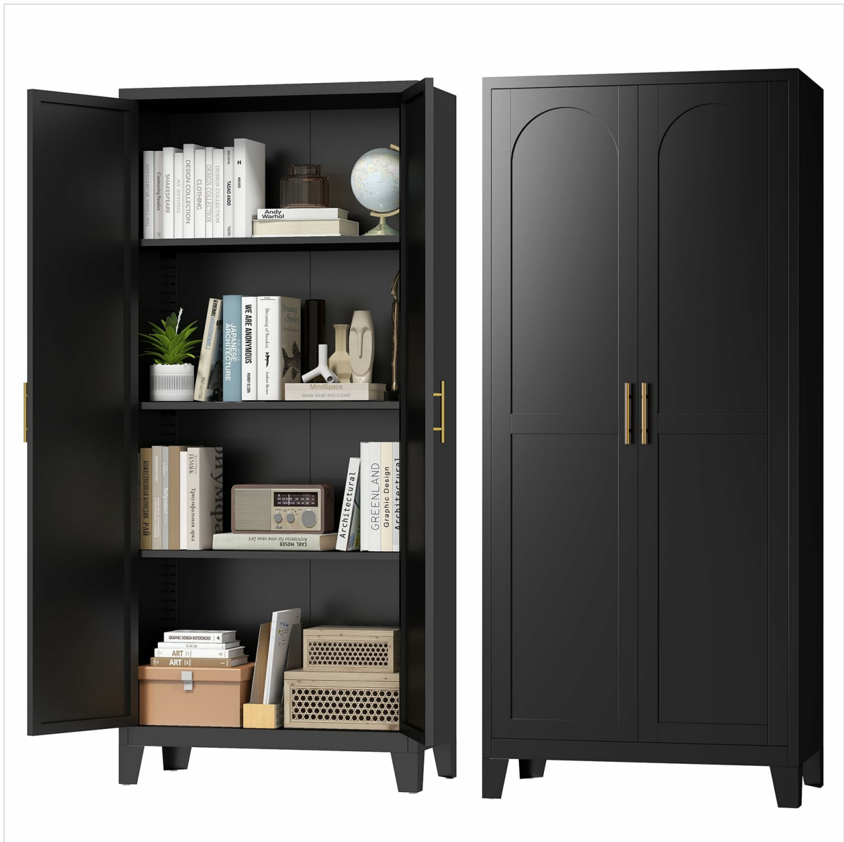
Image: The Zevemomo 61-inch Metal Pantry Cabinet, black, with its two doors open, revealing multiple shelves. The shelves are organized with various household items, including books, small plants, and decorative objects, demonstrating its storage capacity. The cabinet stands in a bright room with natural light.