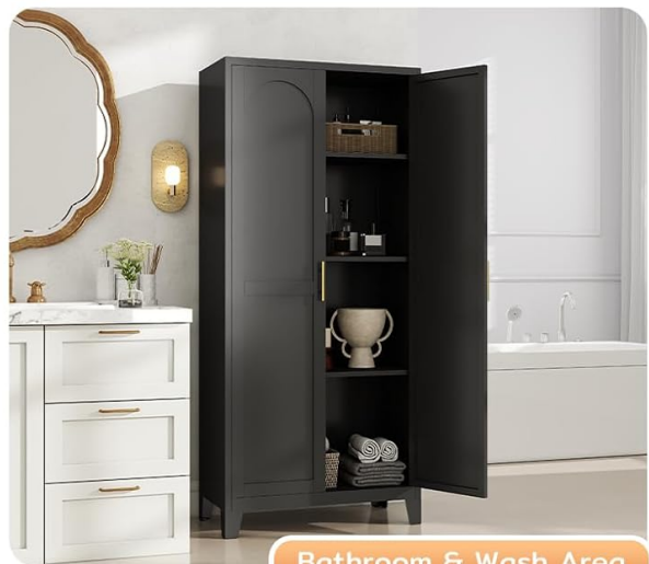
Bathroom & Wash Area