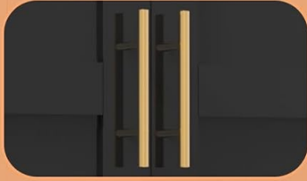
Metal Bar Pull Handles Easy to Open & Close