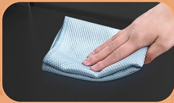
Smooth Metal Surface Easy to Clean & Maintain