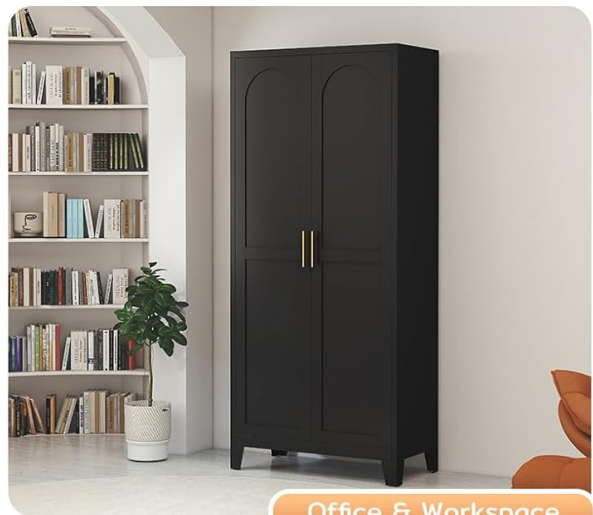
Office & Workspace

Image: A collage of four images demonstrating the versatile use of the Zevemomo metal pantry cabinet in different home environments. It is shown in a kitchen and dining area, a bathroom and wash area, a living room and bedroom, and an office and workspace, highlighting its adaptability for various storage needs.