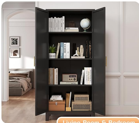
Living Room & Bedroom