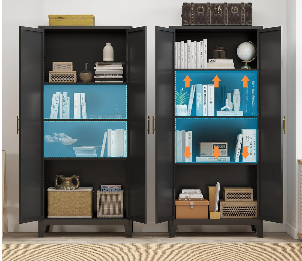
Image: Two Zevemomo metal pantry cabinets are shown side-by-side. The left cabinet displays items on shelves at standard heights. The right cabinet highlights the adjustable nature of the shelves with blue shaded areas and orange arrows indicating that shelves can be moved up or down to accommodate items of various heights.