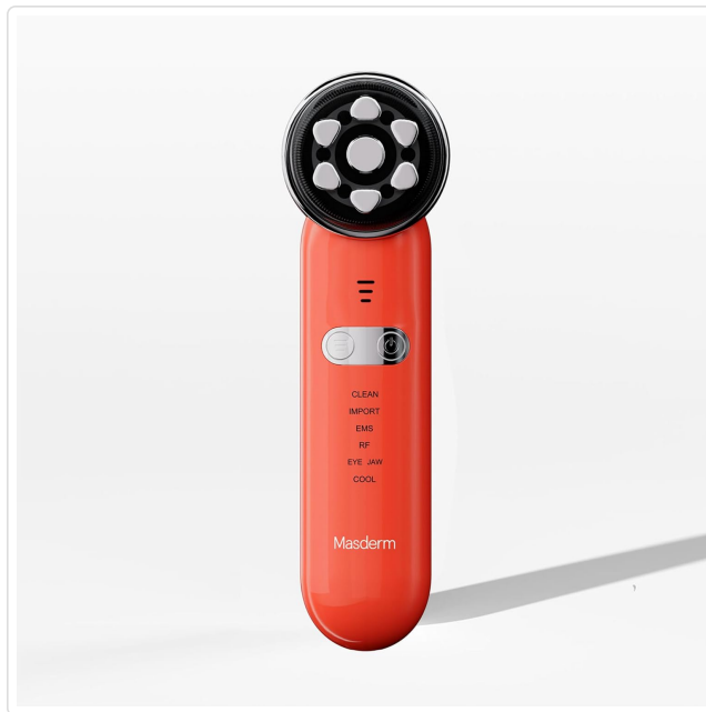
Image 1: The MASDERM 7-in-1 Electric Facial Massager device, showcasing its ergonomic design and control panel.