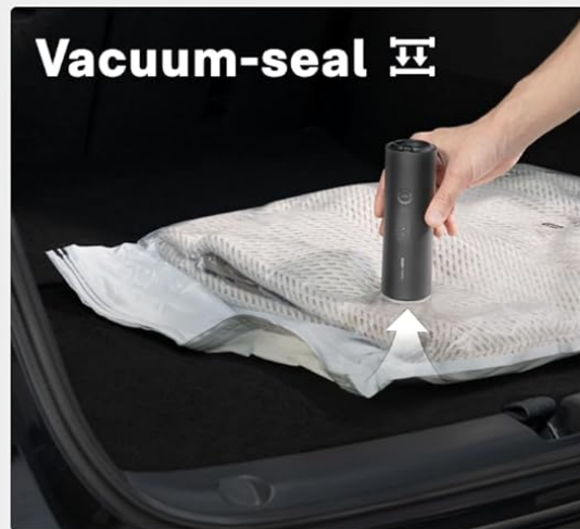
Figure 1: The HOTO AutoCare device showcasing its 4-in-1 functionality.

The HOTO AutoCare is designed for convenience and efficiency, featuring a 96,000 RPM brushless motor that delivers up to 20,000 Pa of suction power. It includes a range of accessories to tackle various cleaning challenges, from car interiors to household surfaces.