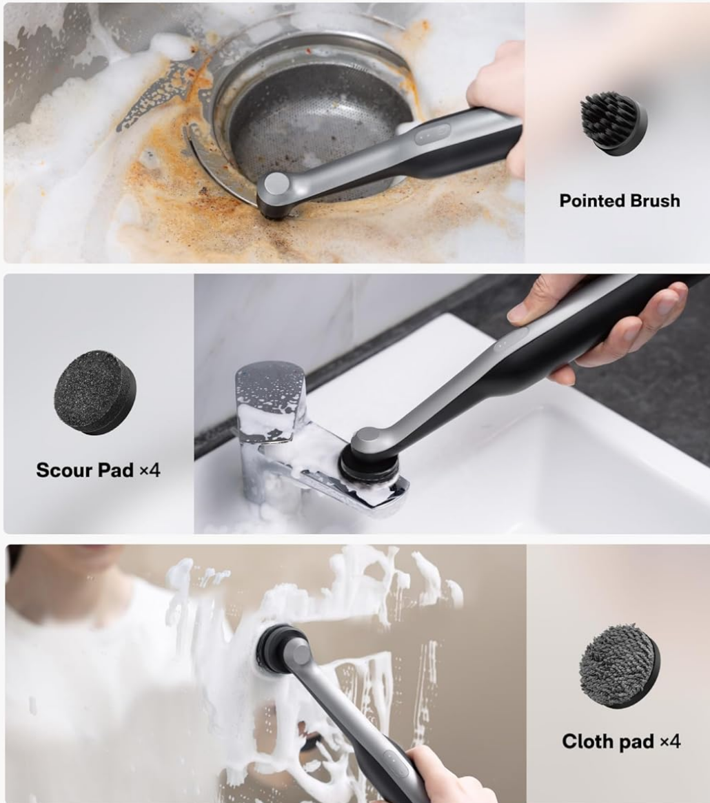
Figure 7: Specialized scrubber attachments for detailed cleaning.