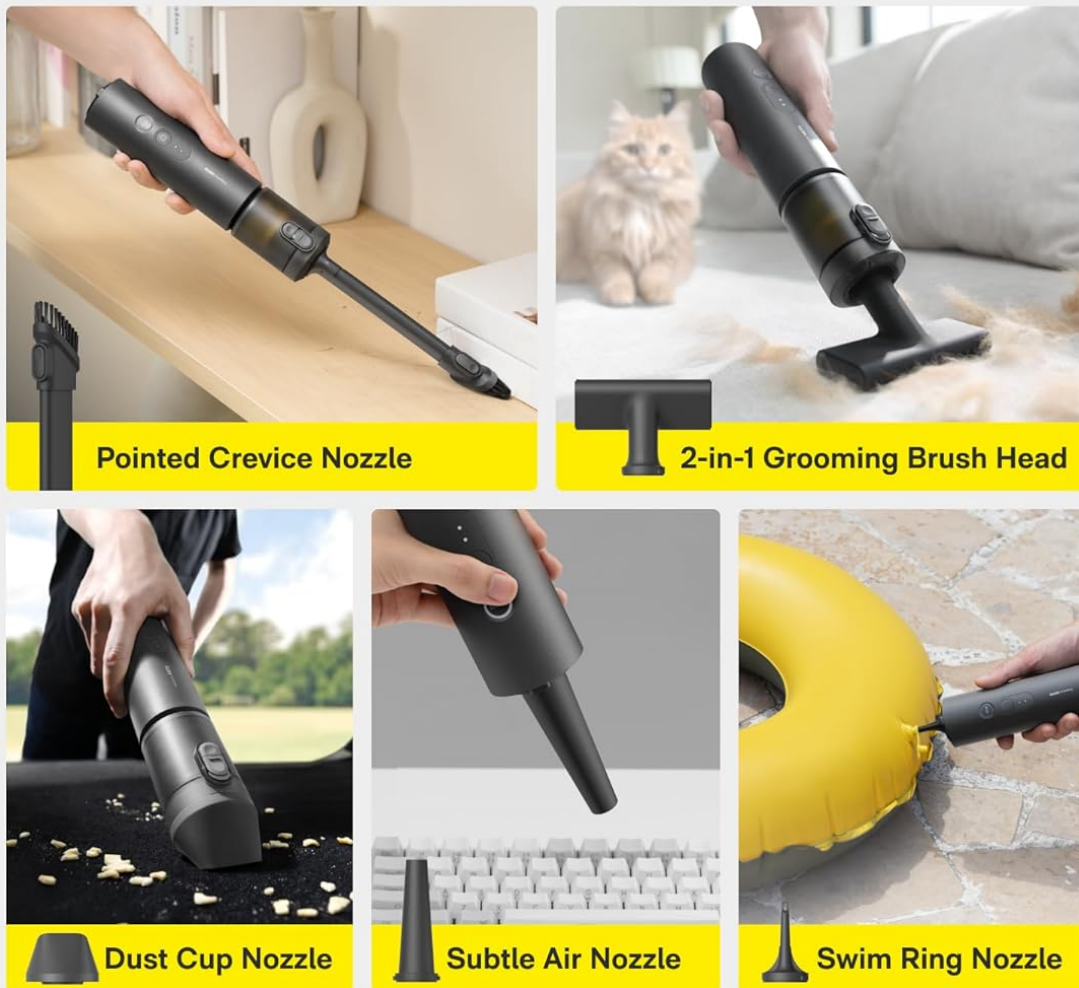
Figure 2: Overview of the HOTO AutoCare main unit and its multipurpose accessories.