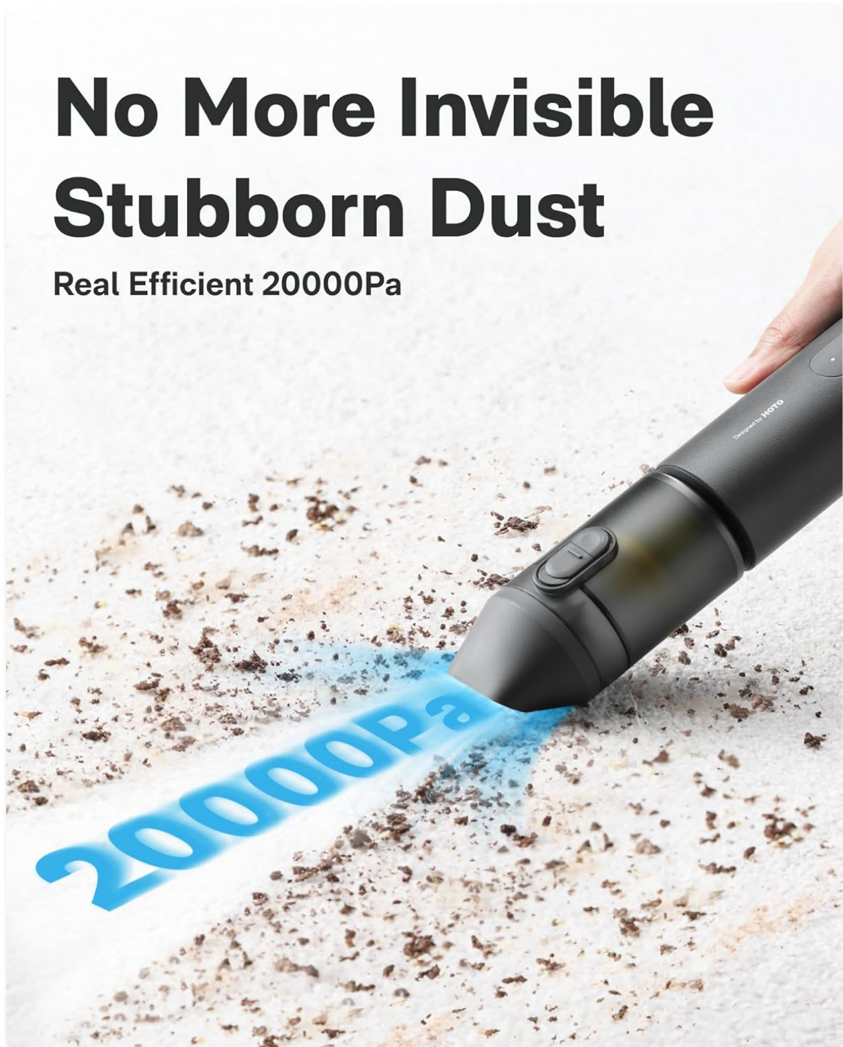
Figure 4: Using the HOTO AutoCare for vacuuming.