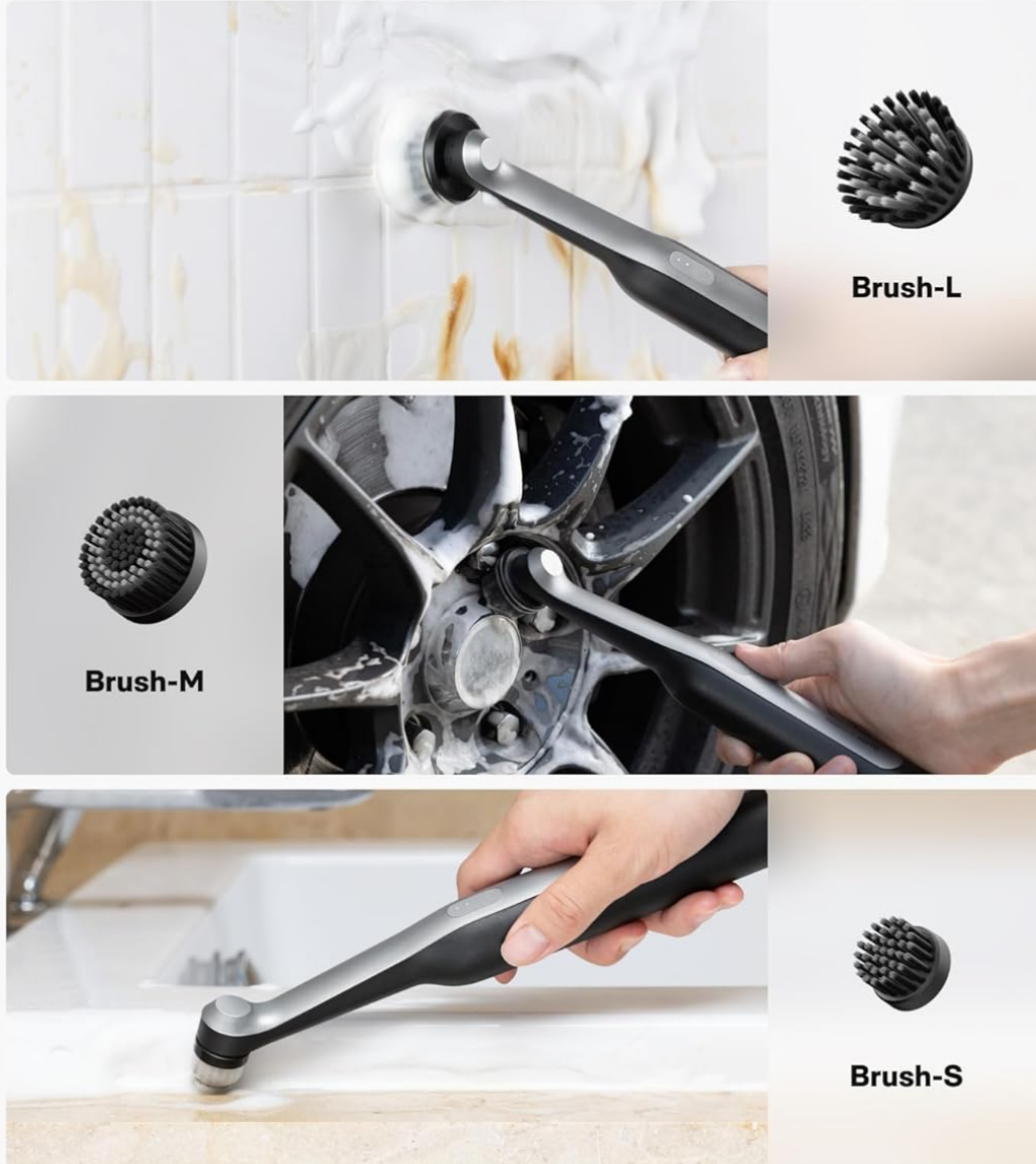
Figure 6: Different brush heads for the spin scrubber.