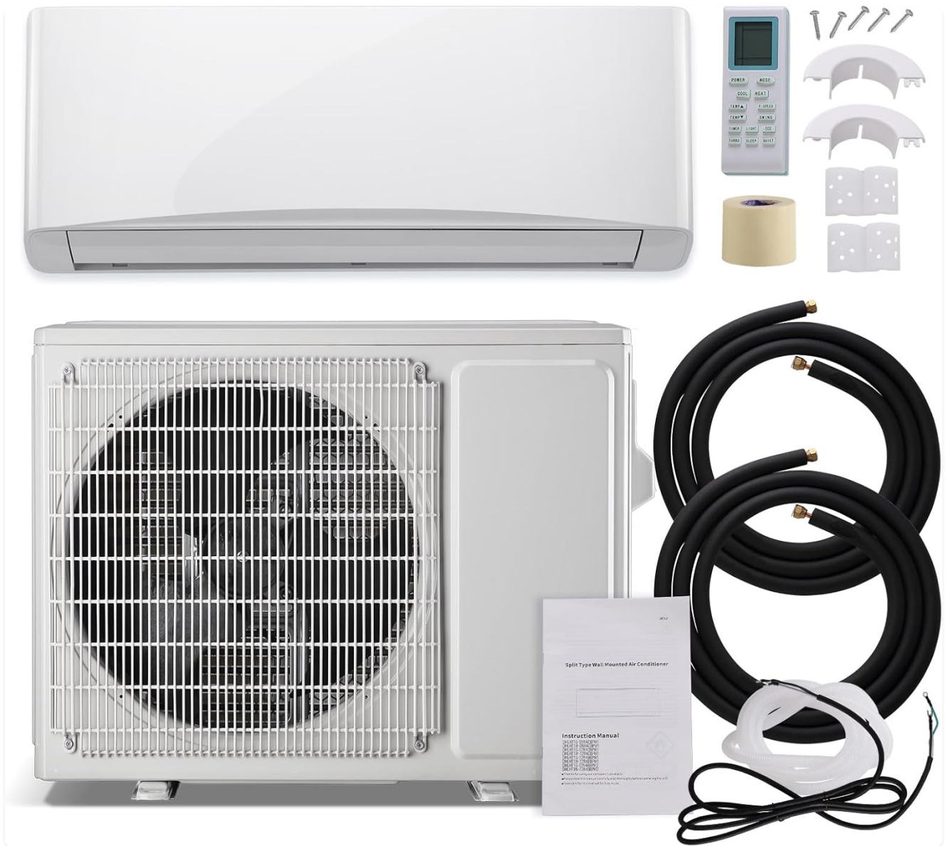
Figure 1.1: Overview of the DEMULLER 9000BTU Split Air Conditioner and its included components, including the indoor unit, outdoor unit, remote control, and installation accessories.