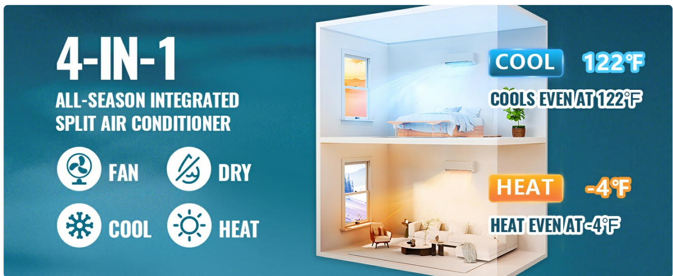
Figure 1.3: Illustration of the 4-in-1 functionality, including Fan, Dry, Cool (effective up to 122°F), and Heat (effective down to -4°F) modes.