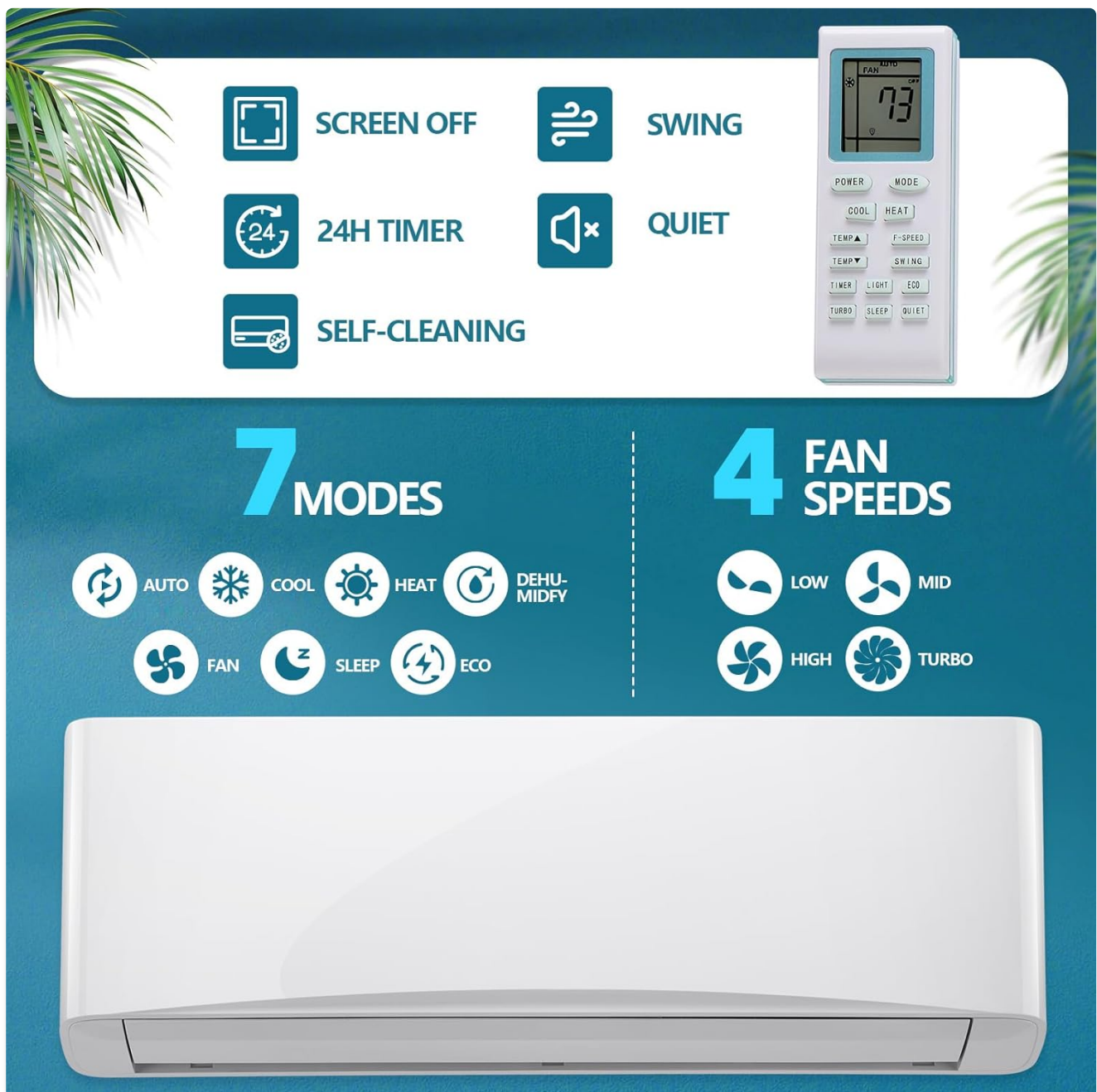
Figure 5.1: The remote control interface showing available modes and settings, including 7 operating modes and 4 fan speeds.