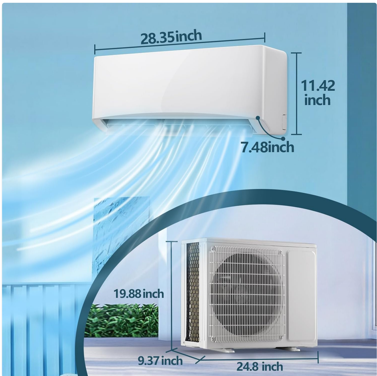
Figure 4.1: Detailed dimensions for both the indoor and outdoor units to assist with installation planning.