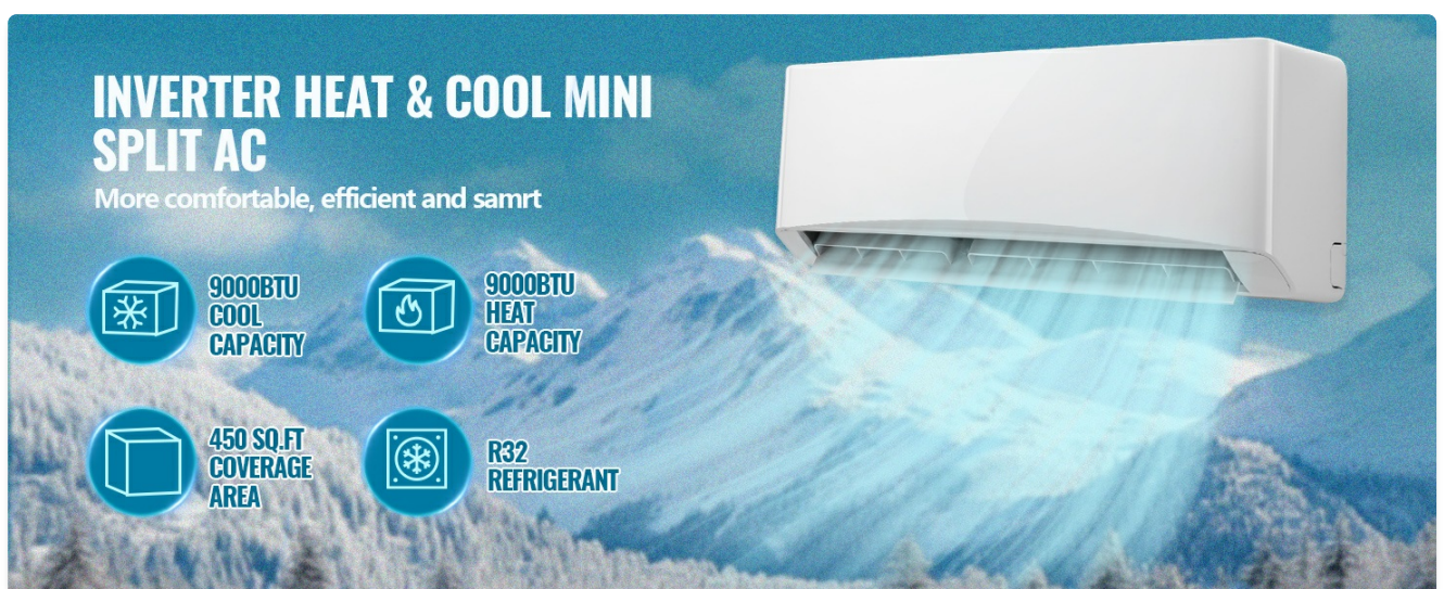
Figure 1.2: Key features of the Inverter Heat & Cool Mini Split AC, highlighting its 9000BTU cooling and heating capacity, 450 sq. ft. coverage area, and R32 refrigerant.