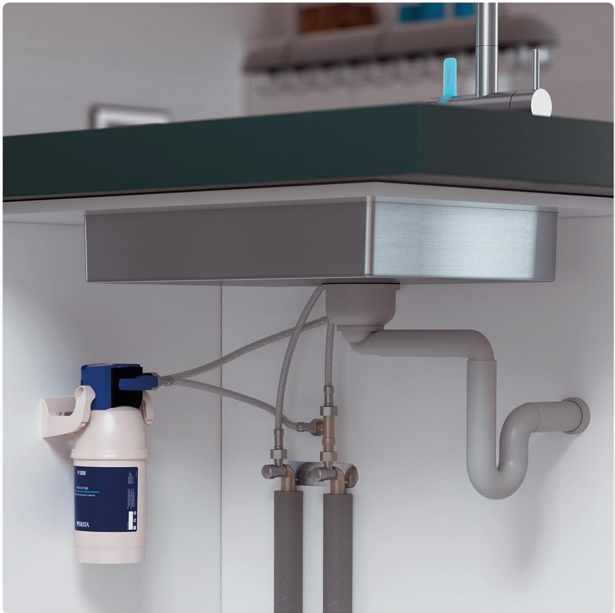
Image: An illustration showing the BRITA P1000 filter unit installed neatly under a kitchen sink, connected to the tap and water supply lines.