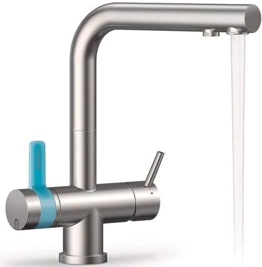
Agua fría y caliente sin filtrar

Image: The BRITA 3-Way Tap demonstrating the simultaneous dispensing of filtered water from one spout and unfiltered cold/hot water from another, highlighting its versatility.