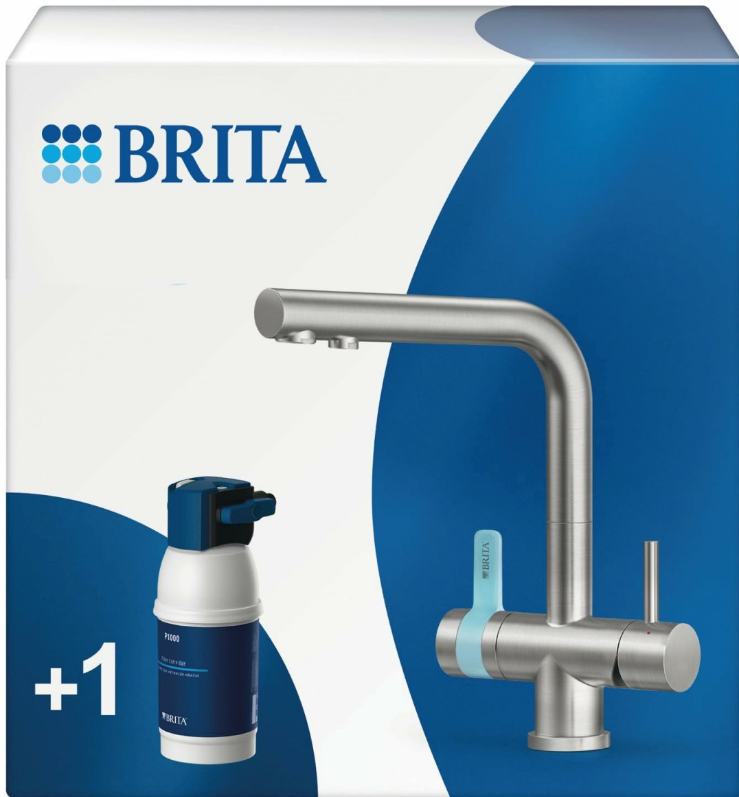
Image: The BRITA P1000 3-Way Integrated Water Filtration System, showcasing the sleek stainless steel tap and the compact P1000 filter unit.