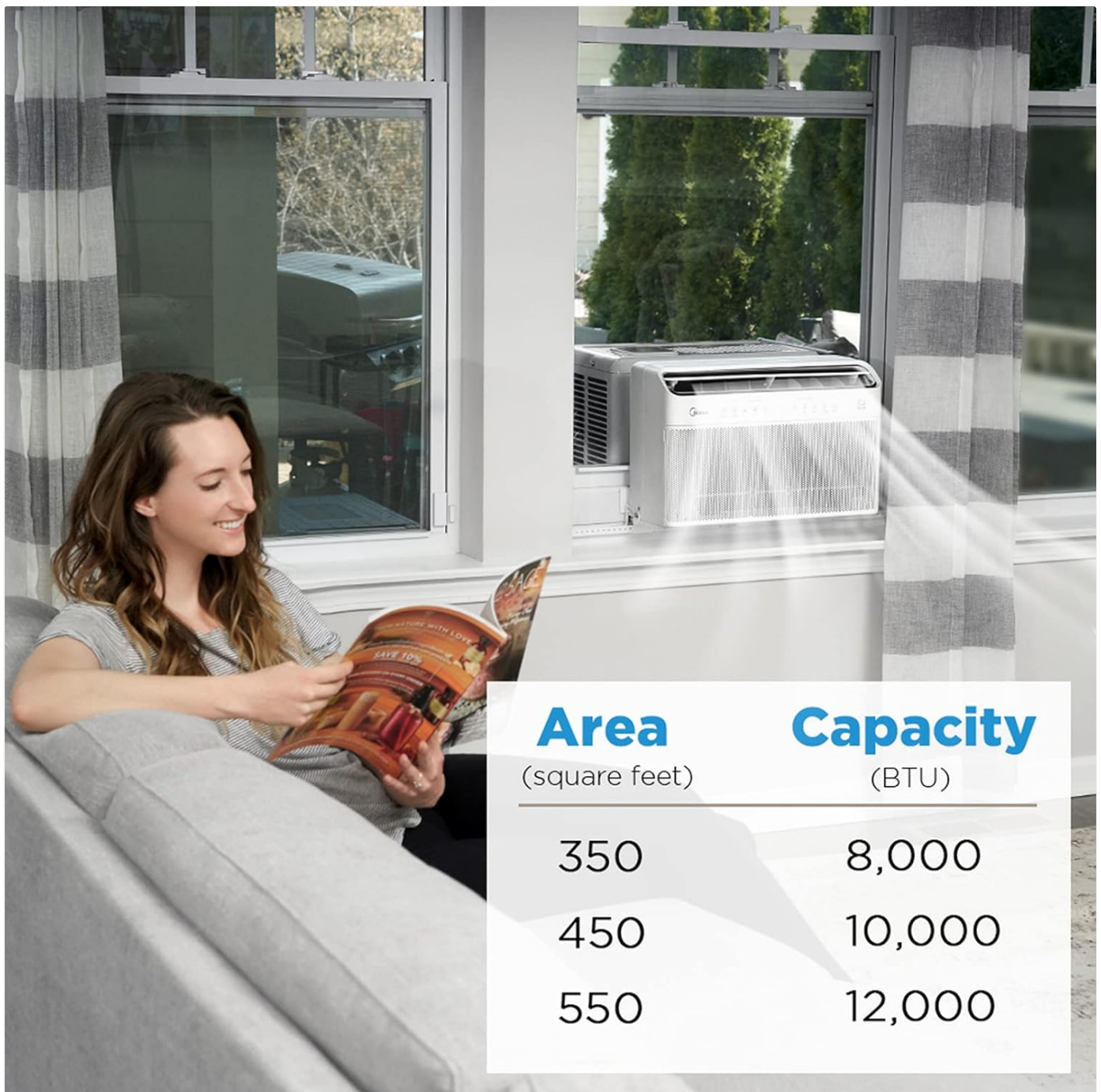
Figure 5.4.2: This model is suitable for cooling areas up to 350 square feet with 8,000 BTU cooling power.