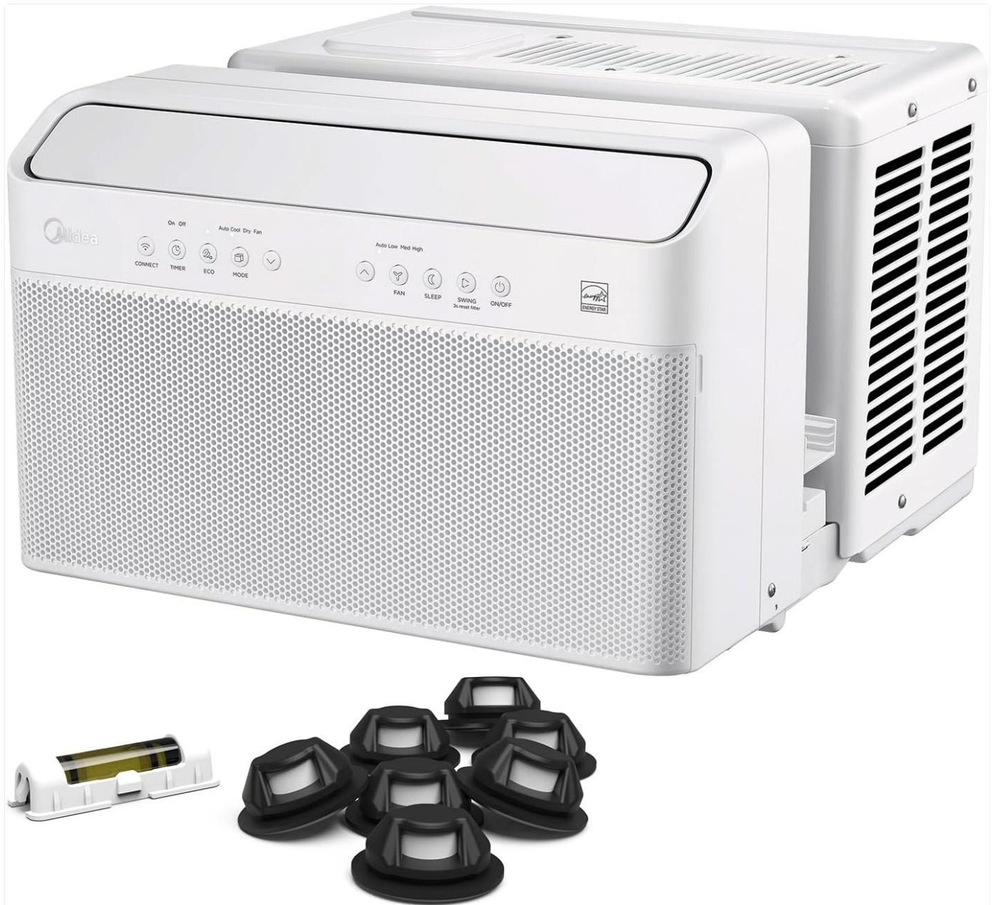
Figure 5.1: The control panel features buttons for On/Off, Connect, Timer, Eco, Mode, Fan speed adjustment, Sleep mode, and Swing function.

The unit can be controlled directly from the intuitive control panel located on the top of the unit or via the included remote control.