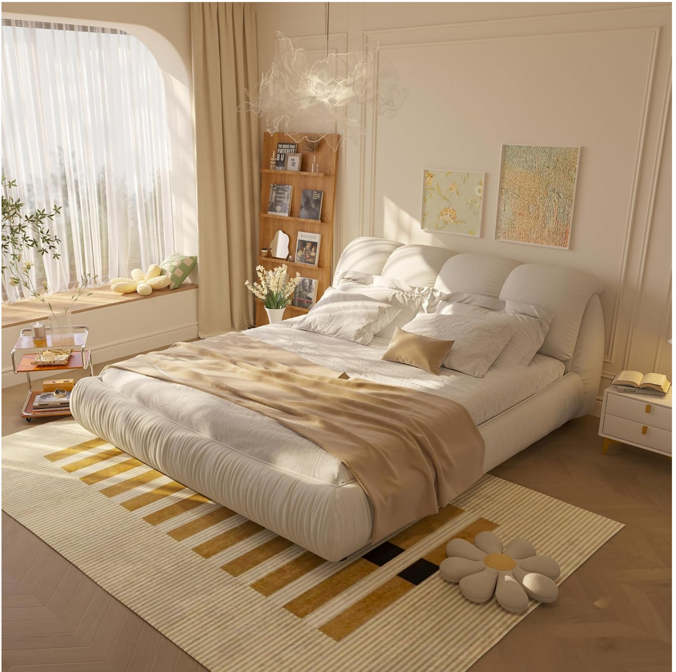
Image: A fully assembled Polibi King Size Luxury Upholstered Platform Bed with a mattress and bedding in a bedroom setting. This image showcases the complete product ready for use.