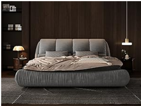
Image: Detailed view highlighting the extra soft headboard, skin-friendly polyester fabric, and the embedded design of the bed frame. This image emphasizes the material quality and construction features relevant to maintenance.