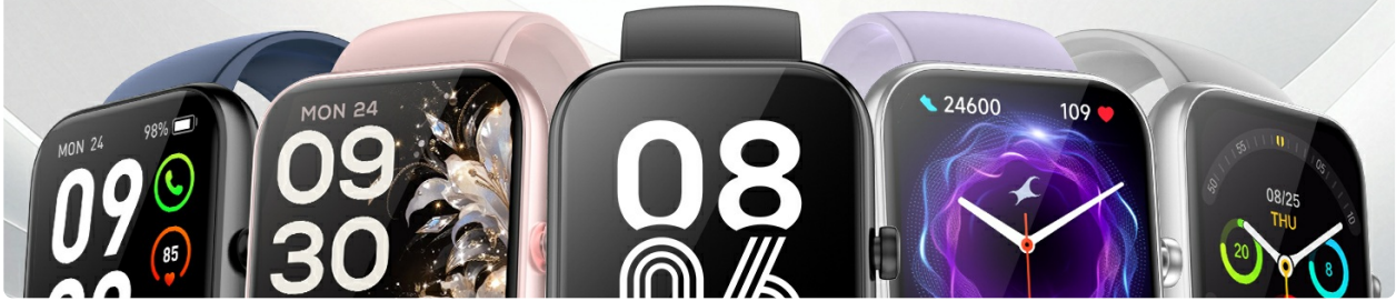
Image: Examples of customizable watch faces for the IDW25 Smart Watch.

IOS iOS 9.0+ | Android 5.0+ | Bluetooth 5.3