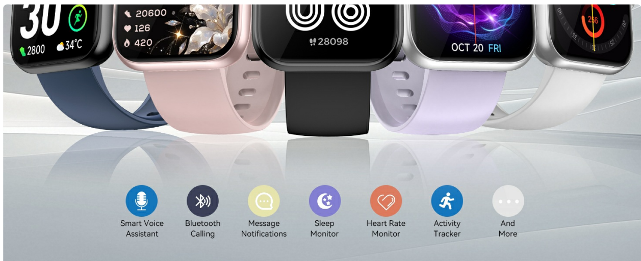
Image: Smart information reminder and notification display on the watch.

Receive notifications for calls, text messages, and various applications directly on your watch. Note that replying to messages is not supported.