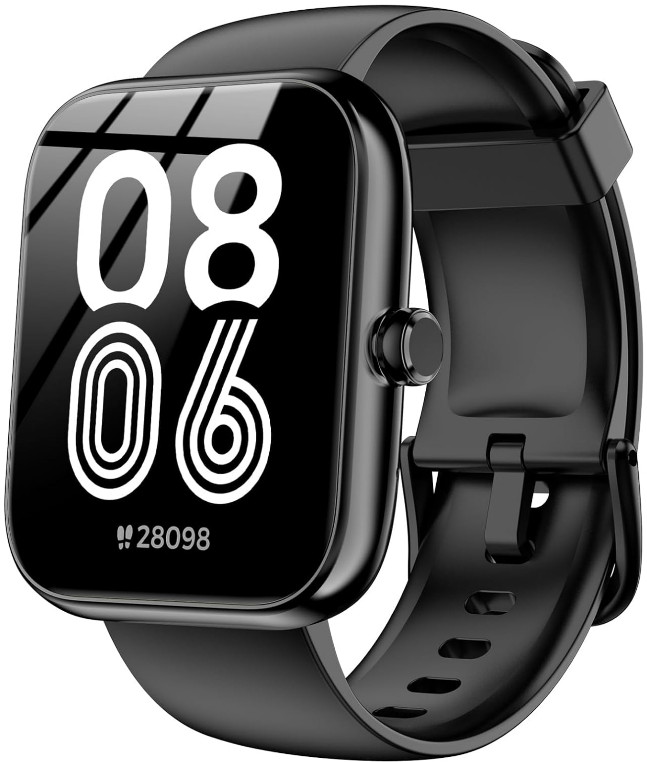
Image: The SENBONO IDW25 Smart Watch displaying its main interface.