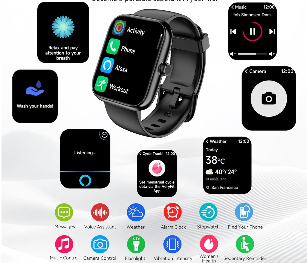
Image: Overview of multifunctional features available on the smart watch.

Smart watches have a variety of practical functions and become a portable assistant in your life.