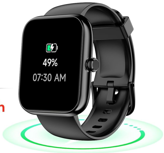
Image: Watch dimensions and battery information, including charging time and battery life.