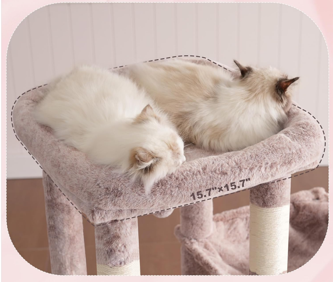
Image: The spacious top perch, large enough for multiple cats to relax, with its removable, washable cushion.

Roomy for all sizes—even Maine Coons and Bengals!