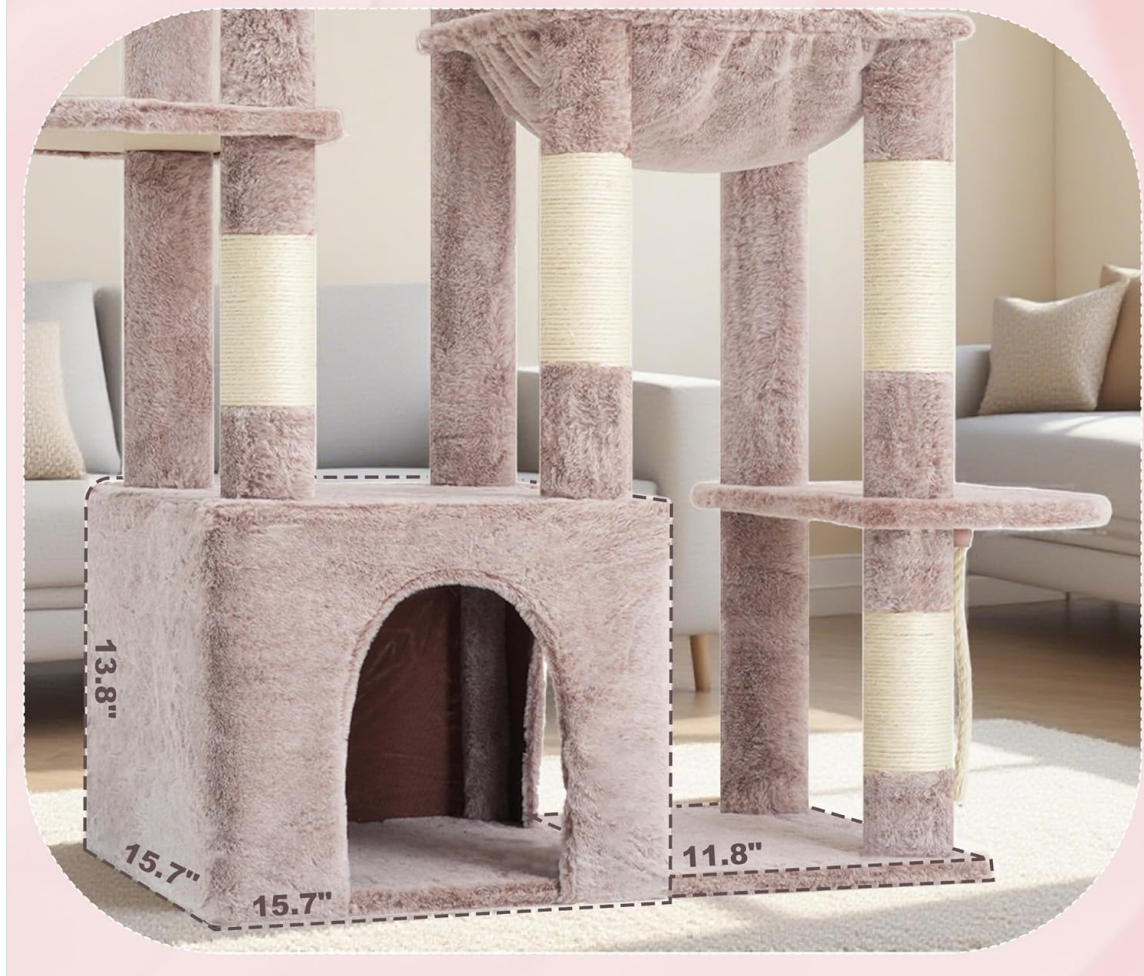
Image: The robust, extra-large base of the cat tree, providing a solid foundation for stability.

The solid "foundation" for superior balance