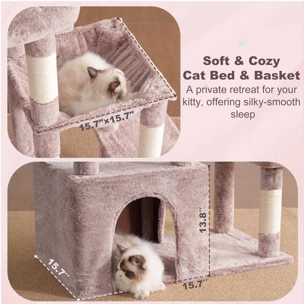
Image: The comfortable, dual-entry cat cave offering a private retreat for cats.