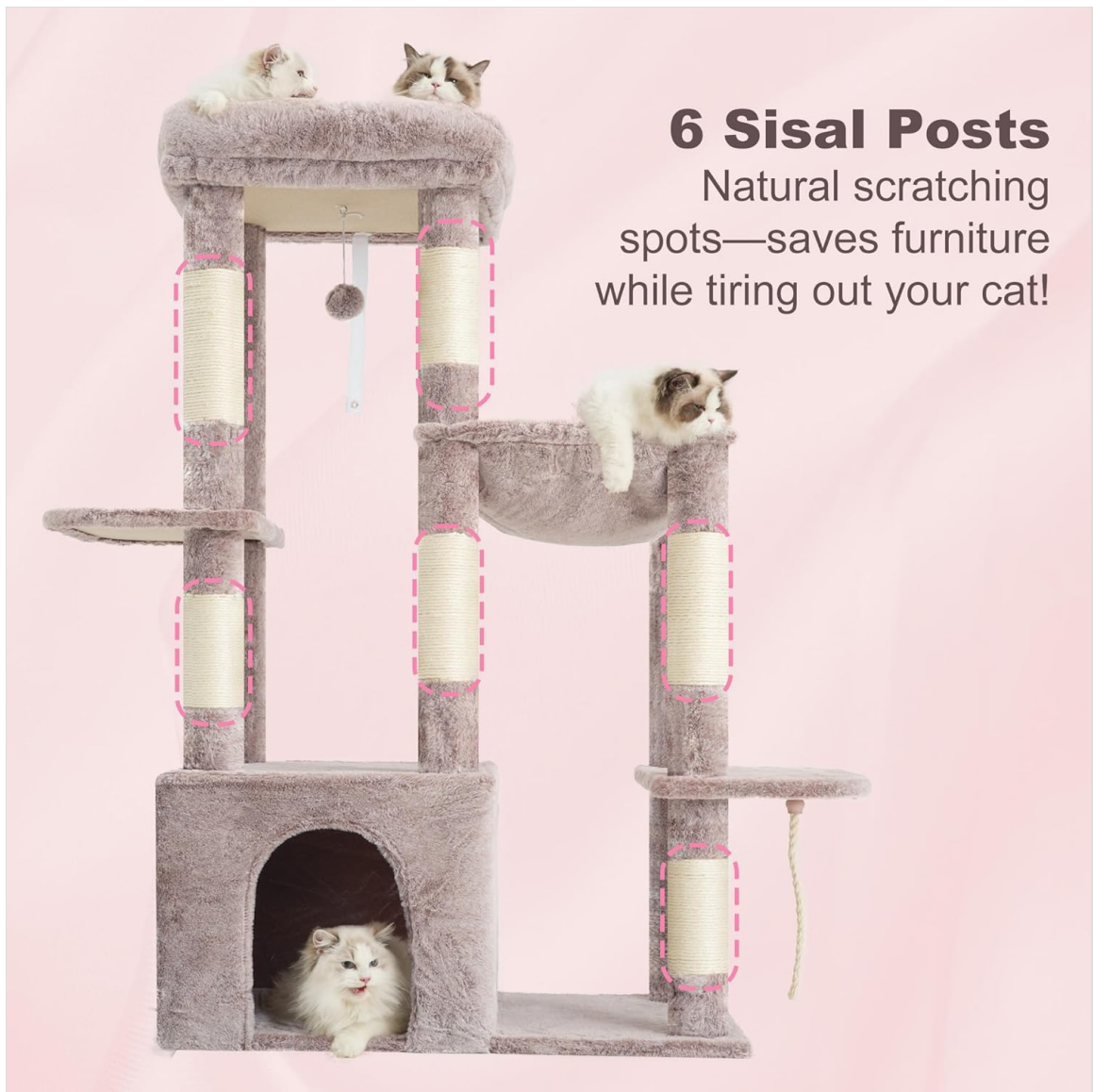
Image: Multiple sisal-wrapped posts designed for cats to scratch and maintain their claws.