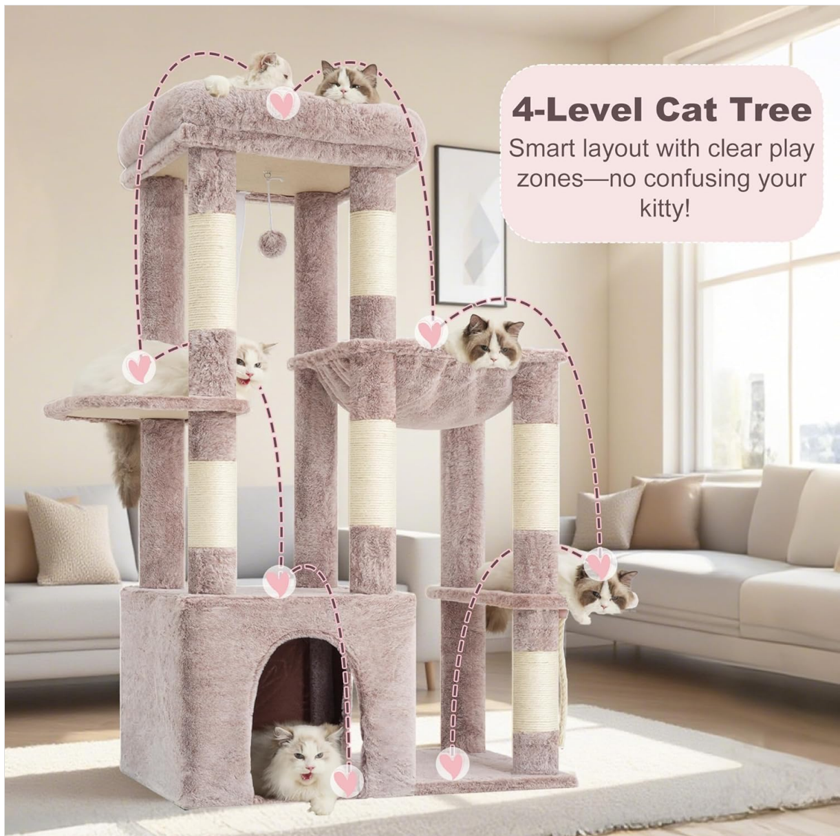
Image: The fully assembled Heybly Heavy Duty Cat Tree, showing its multi-level design and various features, with cats enjoying different sections.