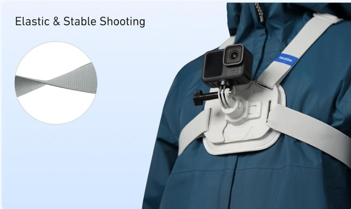
Image 2: A person wearing the TELESIN S2 chest mount harness, illustrating the comfortable and stable fit provided by the elastic straps and padded design.