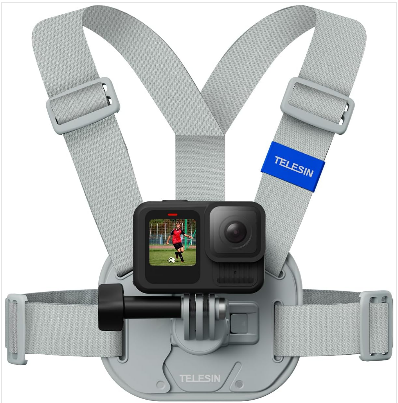
Image 1: Overview of the TELESIN S2 POV Neck Mount and Magnetic Chest Mount Quick Release system with an action camera attached.