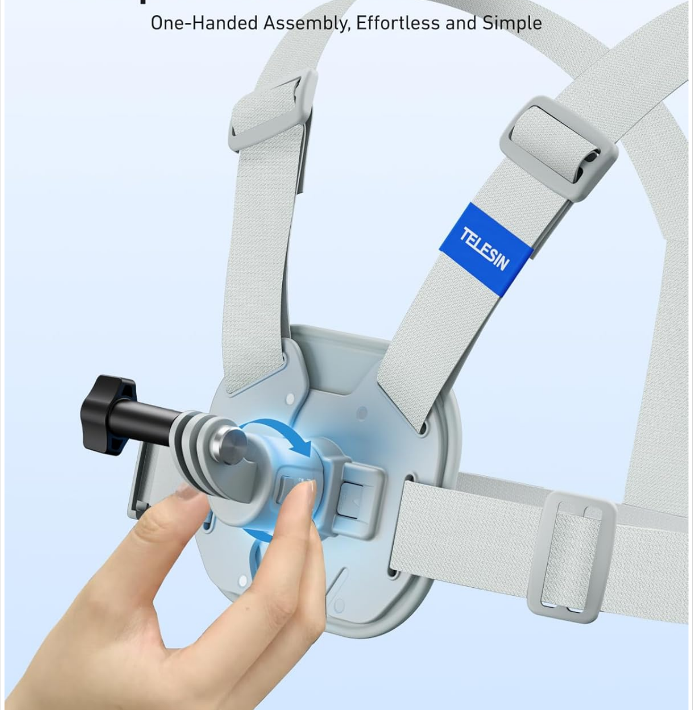
Image 3: A close-up view demonstrating the one-handed quick release operation for attaching or detaching the camera from the mount.

One-Handed Assembly, Effortless and Simple