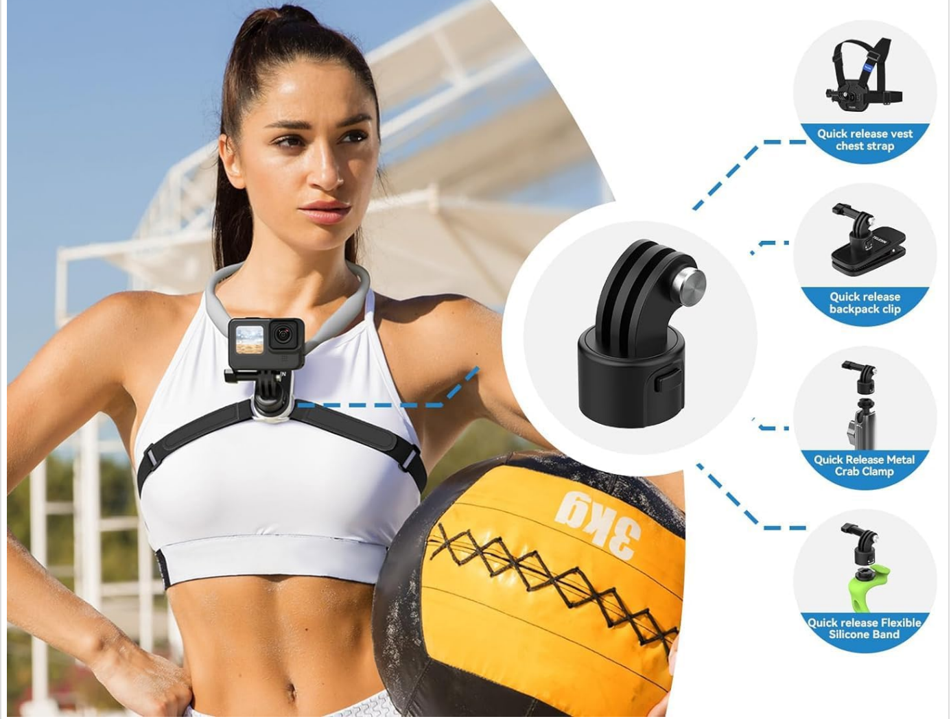
Image 5: An illustration of the TELESIN S2 quick release ecosystem, demonstrating its compatibility with various accessories such as backpack clips, chest straps, and clamp mounts.