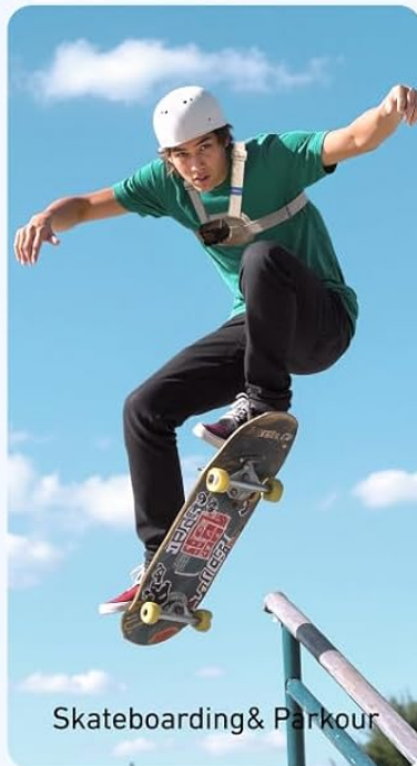
Skateboarding & Parkour