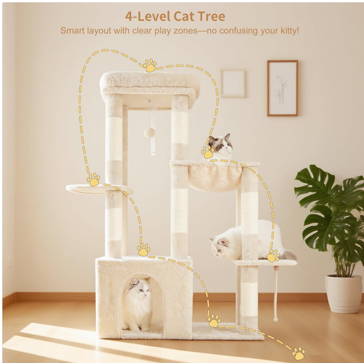
Image: An overview of the 4-level cat tree, highlighting its various play and rest zones.