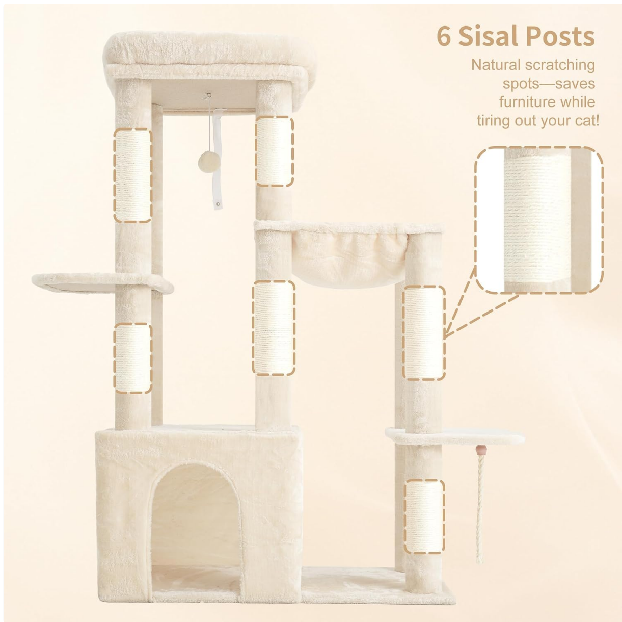
Image: Visual representation of the six sisal scratching posts integrated into the cat tree.