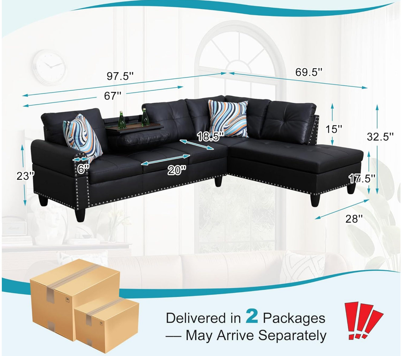
Image 2: A diagram illustrating the overall dimensions of the sectional couch (97.5" W x 69.5" D x 32.5" H) and indicating that it is delivered in two separate packages.