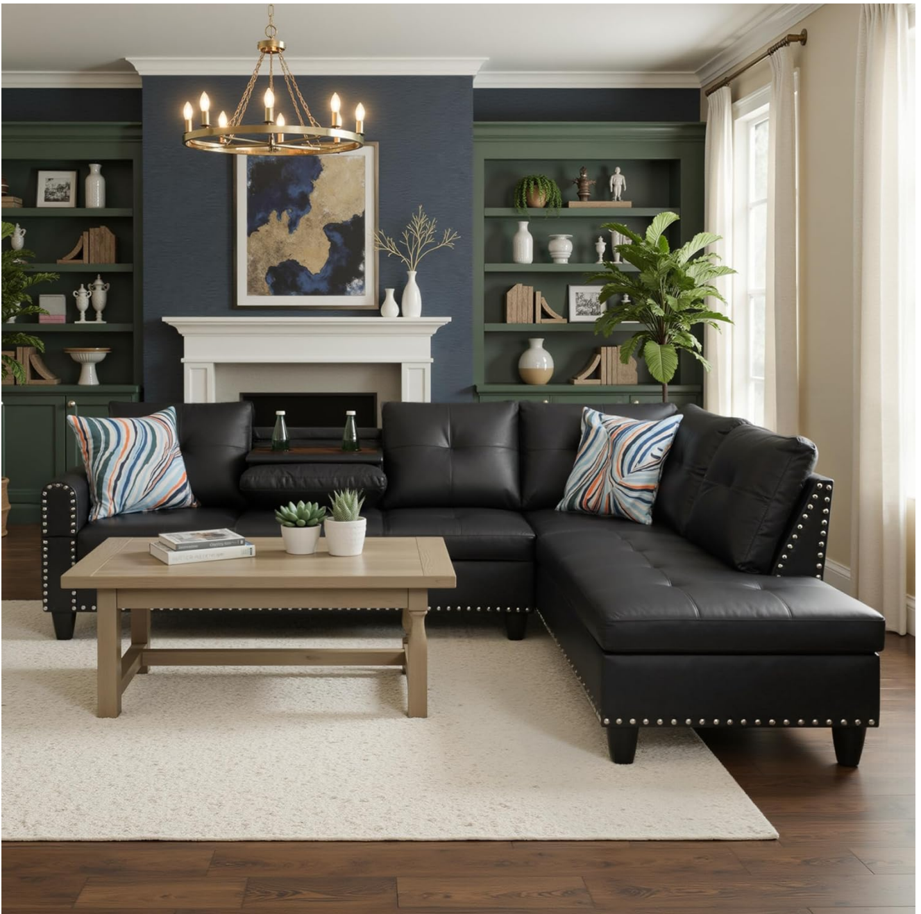
Image 1: The Lyngins 97.5" Oversized Sectional Couch, black faux leather, arranged in an L-shape within a modern living room. The couch features studded armrests and includes decorative throw pillows.