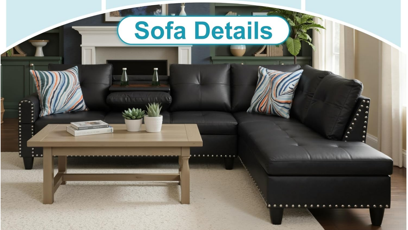
Image 3: Detailed views highlighting key features of the sofa, including thick, supportive cushions, robust upgraded legs, the ergonomic design of the backrest, and the elegant curved armrests.