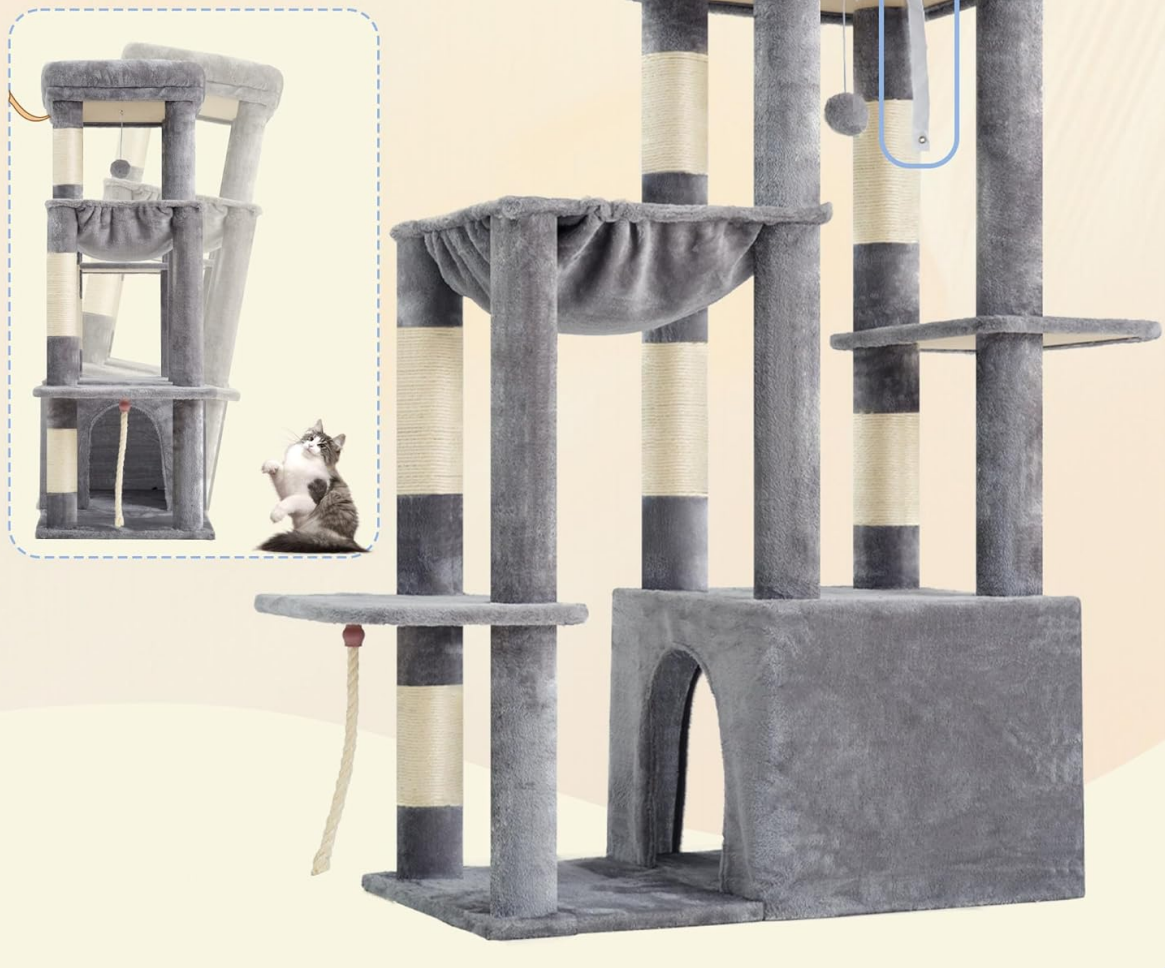
Image: Anti-Tip Device for enhanced stability.

Stability booster for worry-free climbing.