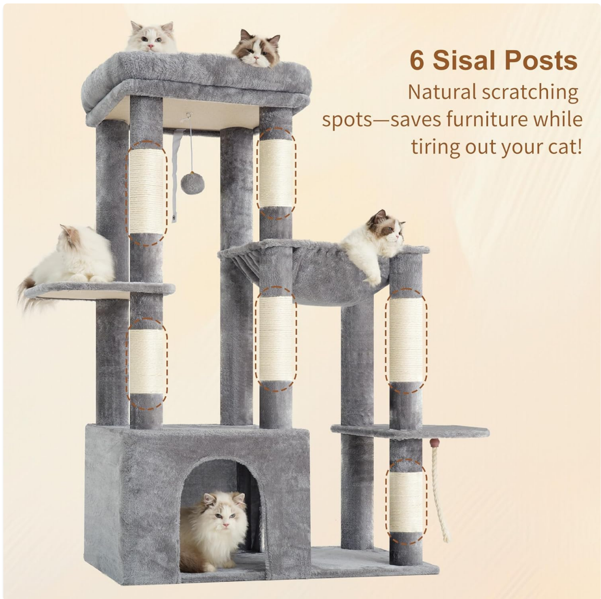
Image: Six sisal scratching posts for natural claw care.