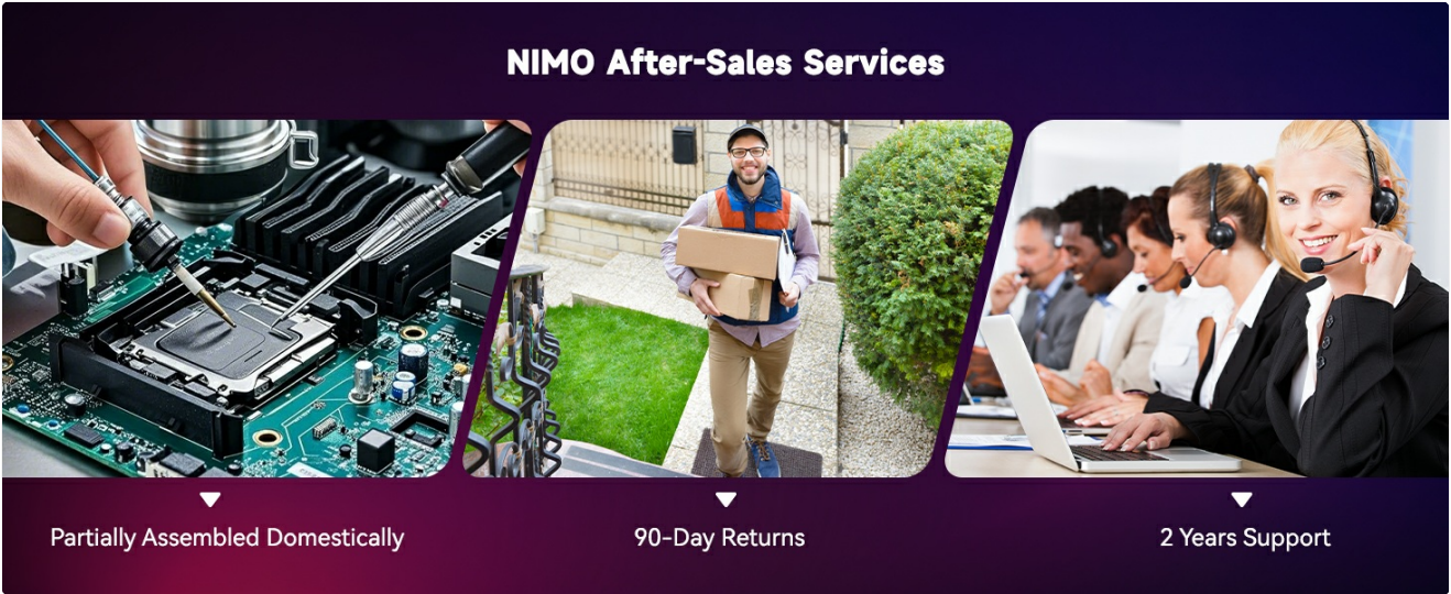
Image: An illustration highlighting NIMO's after-sales services, including partially assembled domestically, 90-day returns, and 2 years of support.

Your NIMO N156 laptop is backed by a comprehensive 2-Year Manufacturer's Guarantee from Nimo Direct Inc. This warranty covers defects in materials and workmanship under normal use. Additionally, NIMO offers a 90-Day Hassle-Free Returns policy. If you are not satisfied with your purchase, you may return it within 90 days according to the return policy terms. For technical assistance, warranty claims, or support inquiries, please visit the official NIMO support website or contact their customer service department. Please have your model number (Nimo N156) and purchase information ready when contacting support.