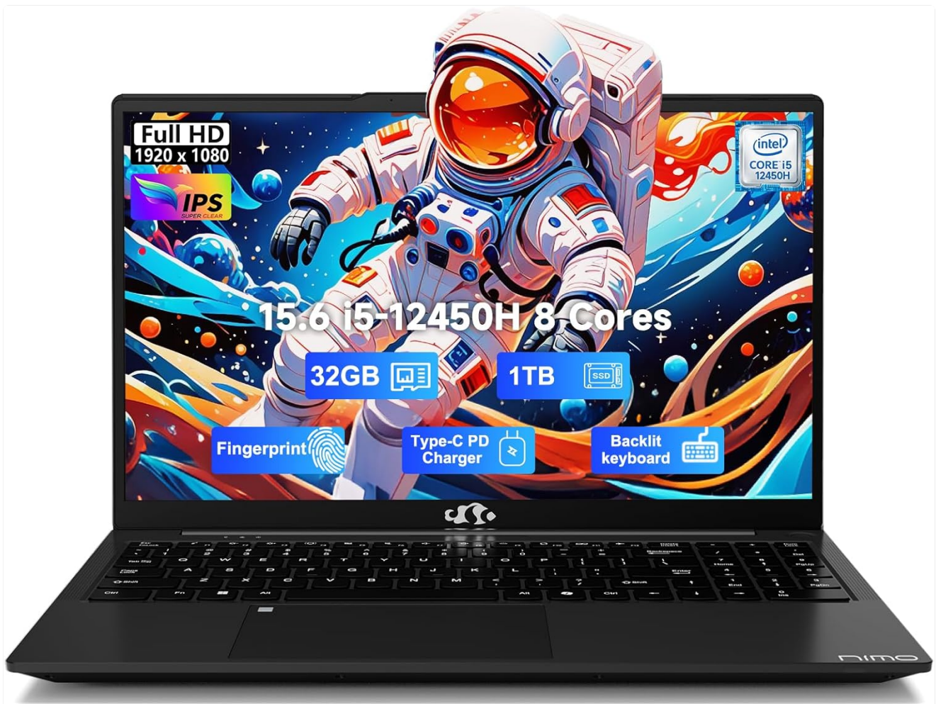
Image: The NIMO N156 laptop, showcasing its 15.6-inch Full HD IPS display, Intel Core i5-12450H processor, 32GB RAM, 1TB SSD, fingerprint reader, Type-C PD charger, and backlit keyboard.