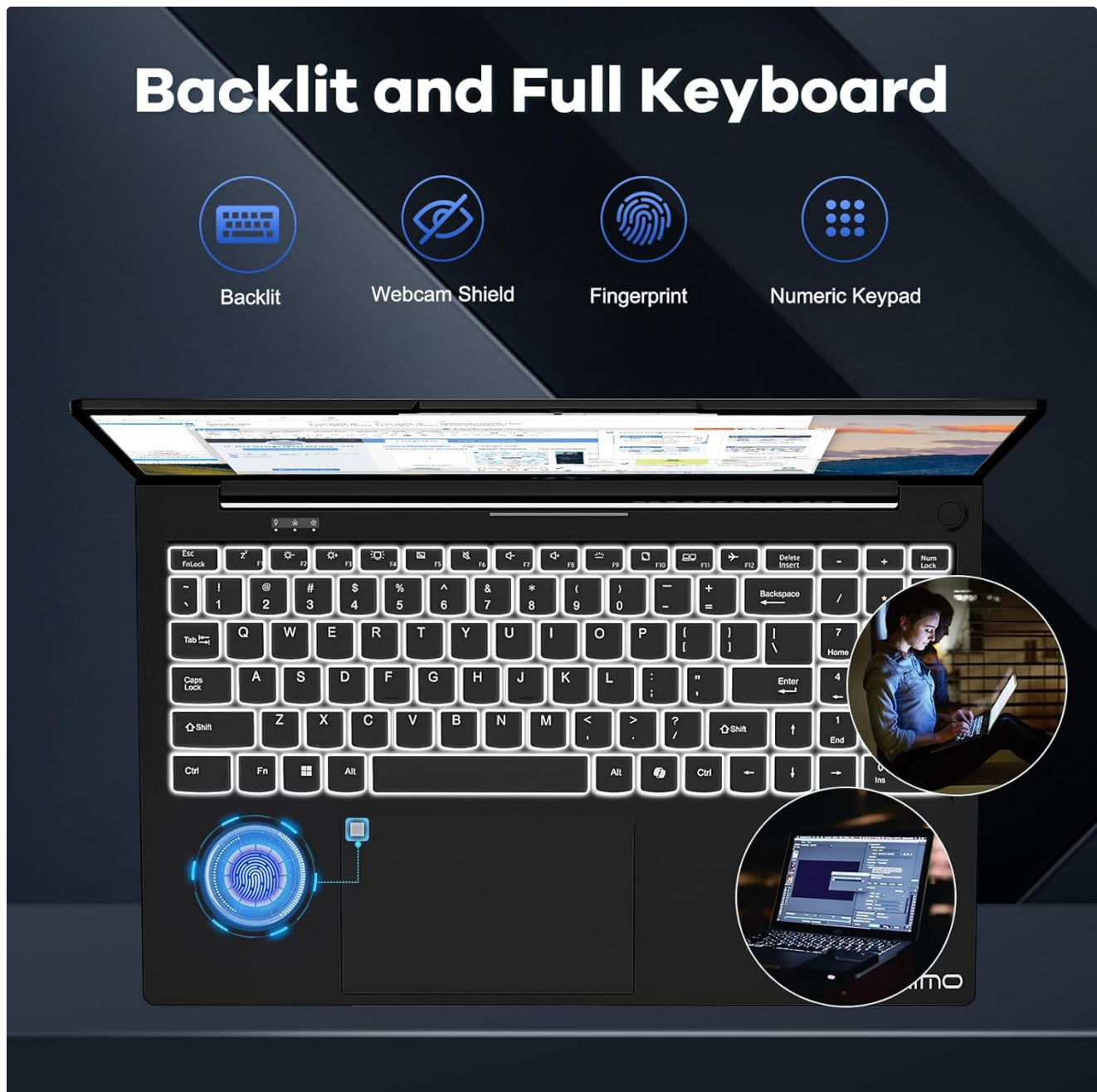
Image: A close-up view of the NIMO N156 laptop's backlit keyboard, highlighting the numeric keypad and the integrated fingerprint sensor on the touchpad.