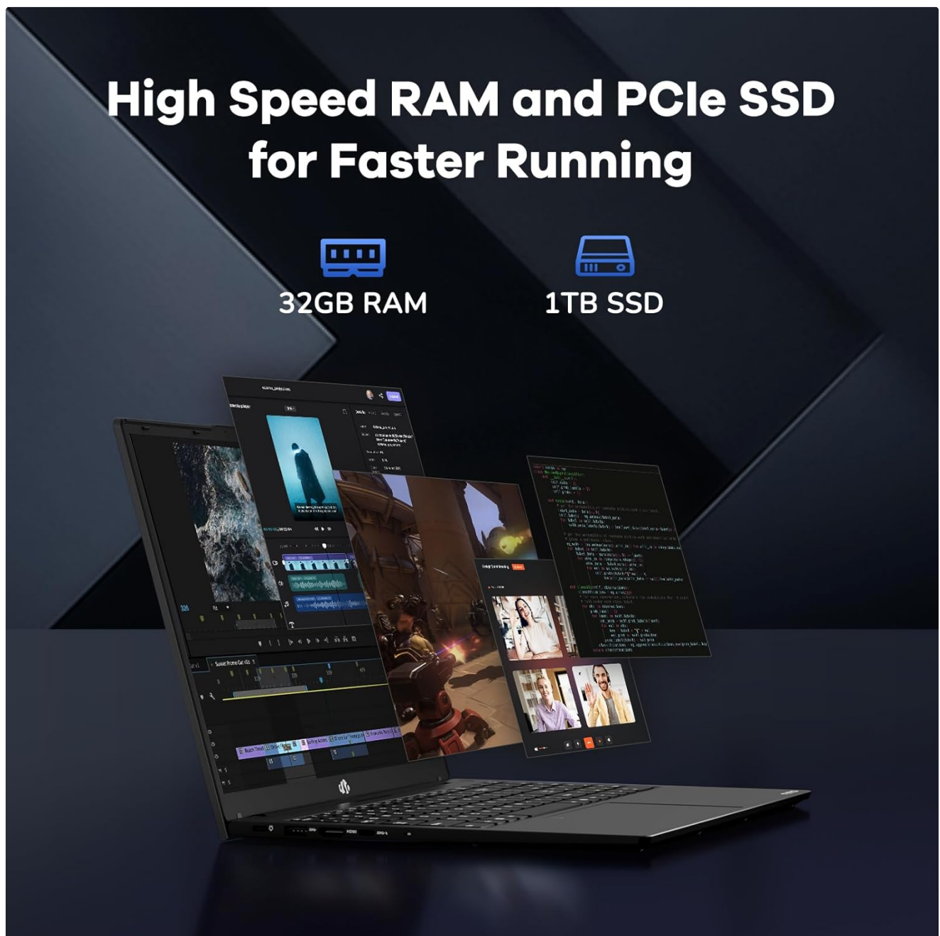
Image: The NIMO N156 laptop displaying multiple open applications, emphasizing its high-speed 32GB RAM and 1TB PCIe SSD for faster performance and multitasking.

The NIMO N156 laptop features user-expandable DDR4 RAM and PCIe NVMe SSD storage. Refer to the official NIMO support resources or a qualified technician for detailed instructions on performing upgrades to avoid voiding your warranty or damaging the device.