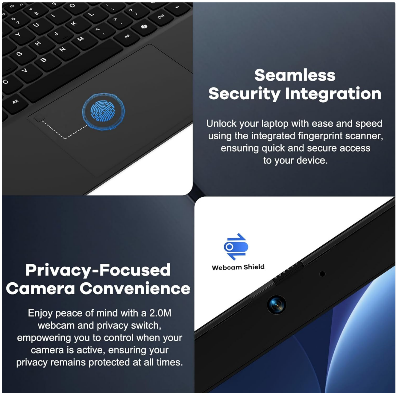
Image: A split image showing a close-up of the fingerprint reader on the touchpad for seamless security integration, and the physical webcam shield for privacy control.