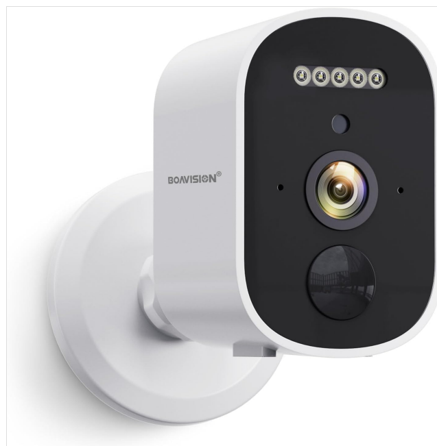
Image 3.1: Front view of the BOAVISION 2K Wireless Outdoor Security Camera, showing the lens, spotlight LEDs, and PIR motion sensor.

Familiarize yourself with the components of your BOAVISION security camera.