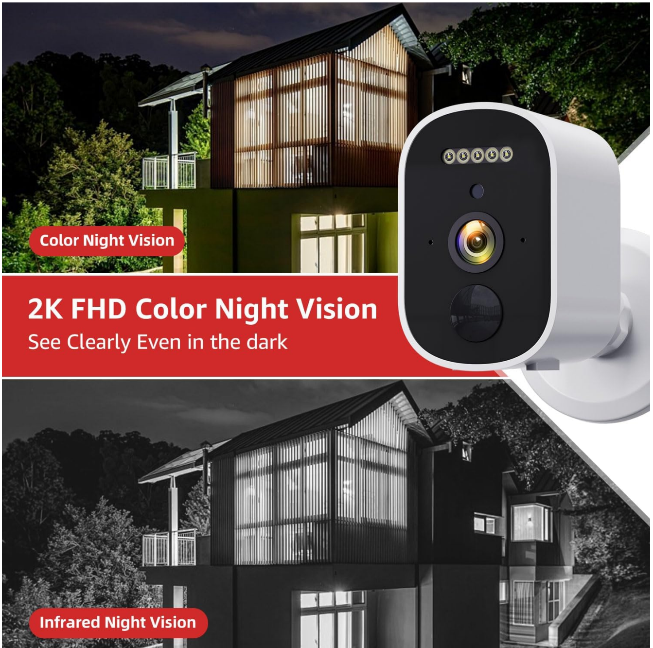
Image 5.2: Demonstrates the difference between Color Night Vision, which provides a clearer, more detailed view in low light, and traditional Infrared Night Vision, which offers a black and white image.