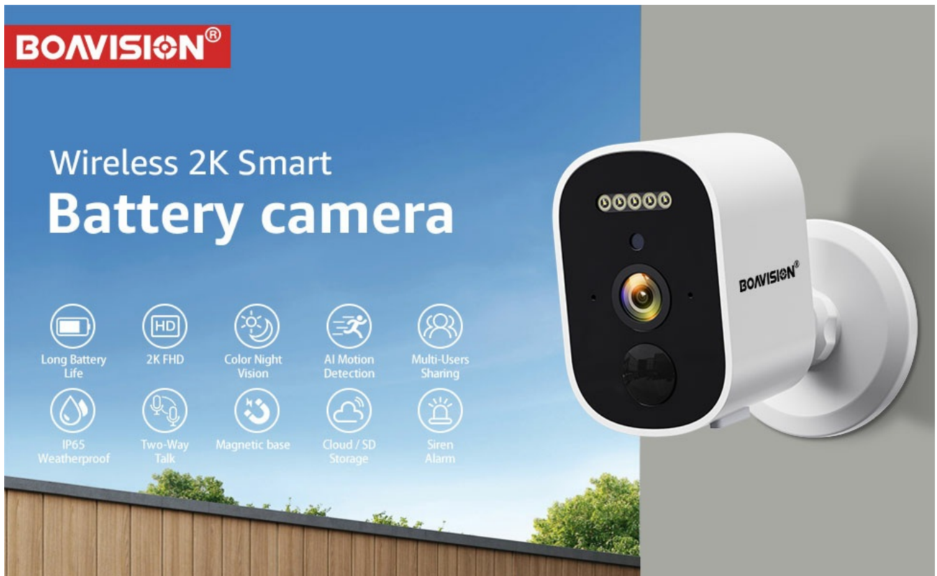
Image 1.1: BOAVISION Wireless 2K Smart Battery Camera overview, highlighting key features like long battery life, 2K FHD, color night vision, AI motion detection, multi-user sharing, IP65 weatherproof, two-way talk, magnetic base, cloud/SD storage, and siren alarm.

Thank you for choosing the BOAVISION 2K Wireless Outdoor Security Camera. This manual provides detailed instructions for the setup, operation, and maintenance of your new security camera. Please read this manual thoroughly before use to ensure proper installation and functionality. This camera is designed for both indoor and outdoor use, offering 2K FHD clarity, color night vision, AI motion detection, and two-way audio for enhanced home security.