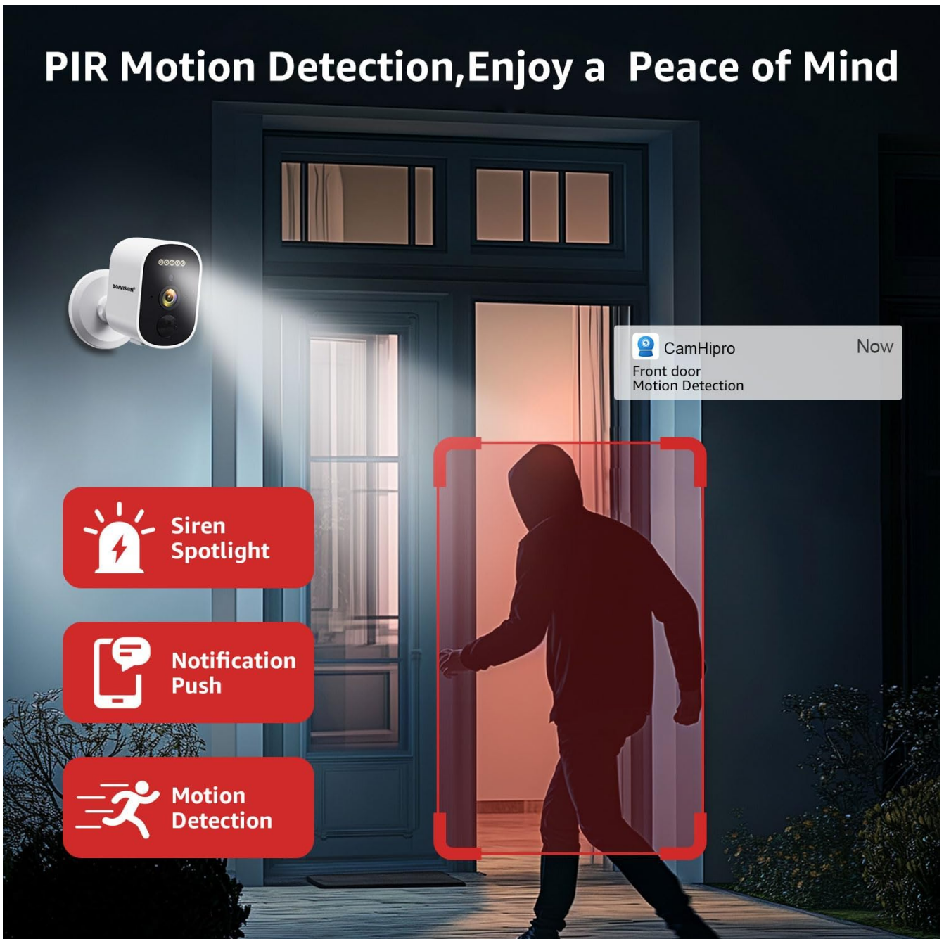
Image 5.3: Illustrates the PIR motion detection feature, showing an alert notification on a smartphone and the camera's spotlight activating to deter an intruder.