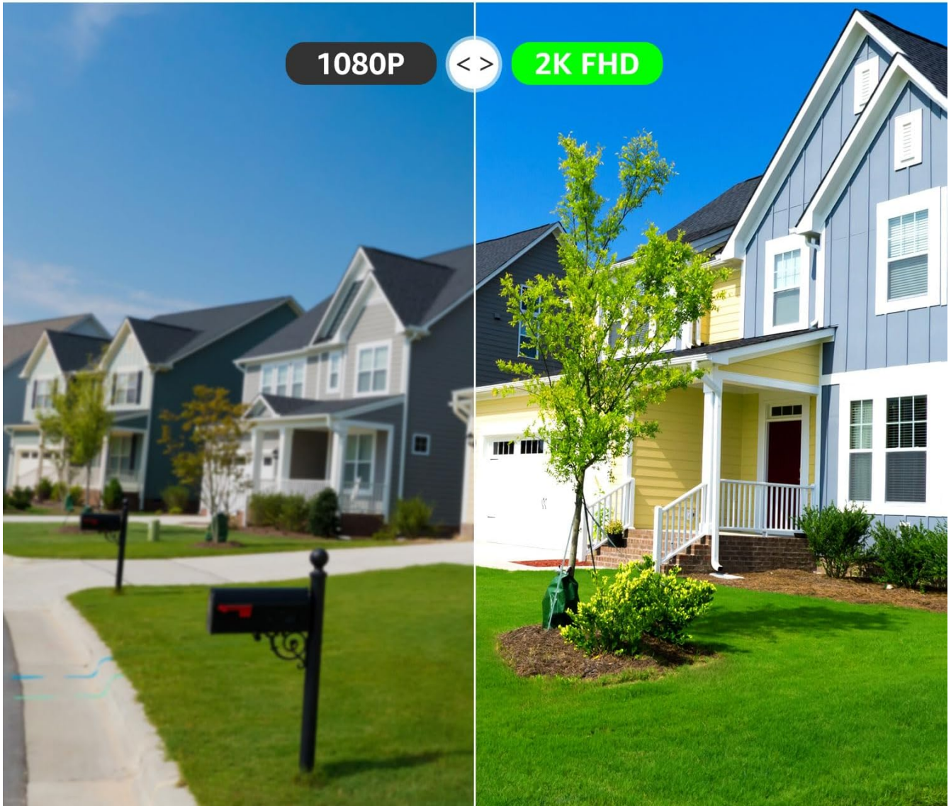
Image 5.1: Comparison illustrating the enhanced detail captured by 2K FHD resolution compared to 1080P.