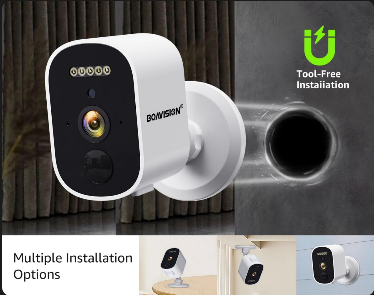
Image 4.1: Illustration of the easy magnetic snap-on installation and the sturdy wall mount option, providing tool-free setup for various needs.

Quick Magnetic Snap-On or Sturdy Wall Mount-easy, wire-free setup for any need.