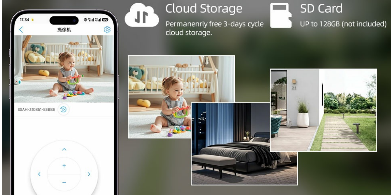
Image 5.5: Depicts the flexible storage solutions, including permanent free 3-day cycle cloud storage and support for local SD card storage up to 128GB (SD card not included).