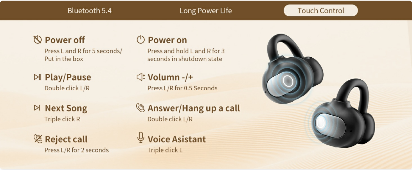
Image: A visual guide detailing the touch control functions for the earbuds, showing where to tap or press on the earbud surface.

The PSIER EP20 earbuds feature intuitive touch controls.