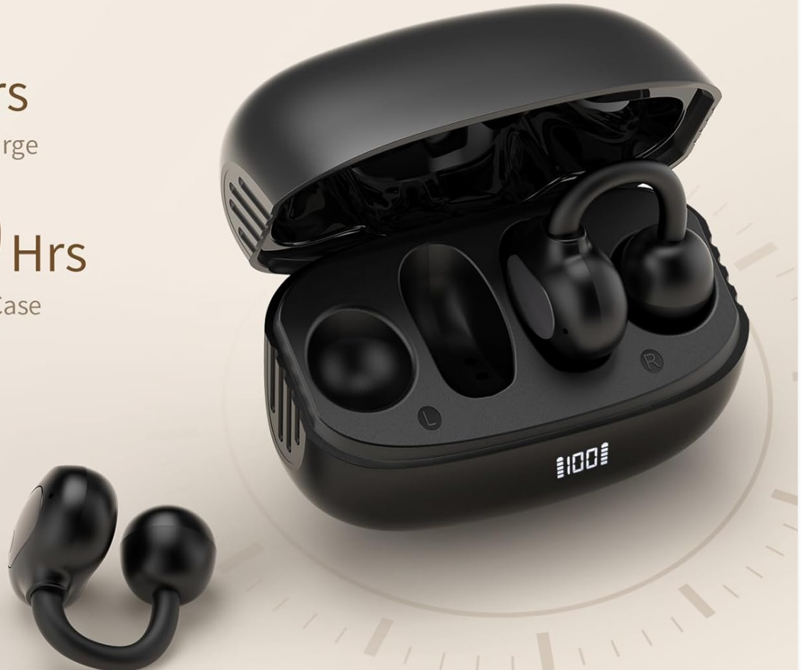
Image: The earbuds are shown inside their charging case, with text indicating 8 hours of playtime on a single charge and 30 hours total with the charging case.