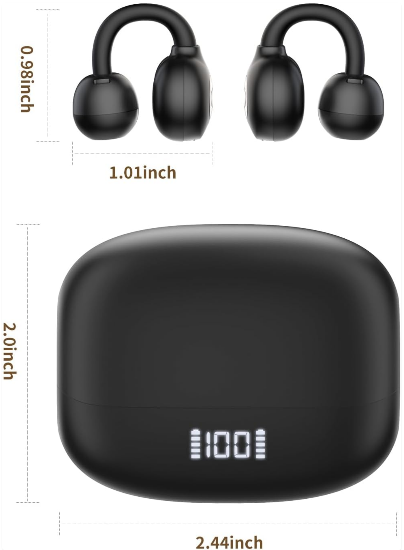
Image: Diagram showing the dimensions of the earbuds and the charging case, indicating their compact size.