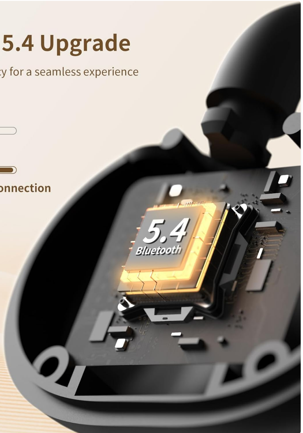
Image: A close-up of the earbud's internal components, highlighting the Bluetooth 5.4 chip and emphasizing low latency and fast connection.