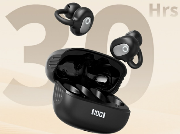
Image: A graphic illustrating the battery life: 8 hours from a single charge and 30 hours total with the charging case, emphasizing long-lasting power.

Long power life, giving you a smooth charging experience.