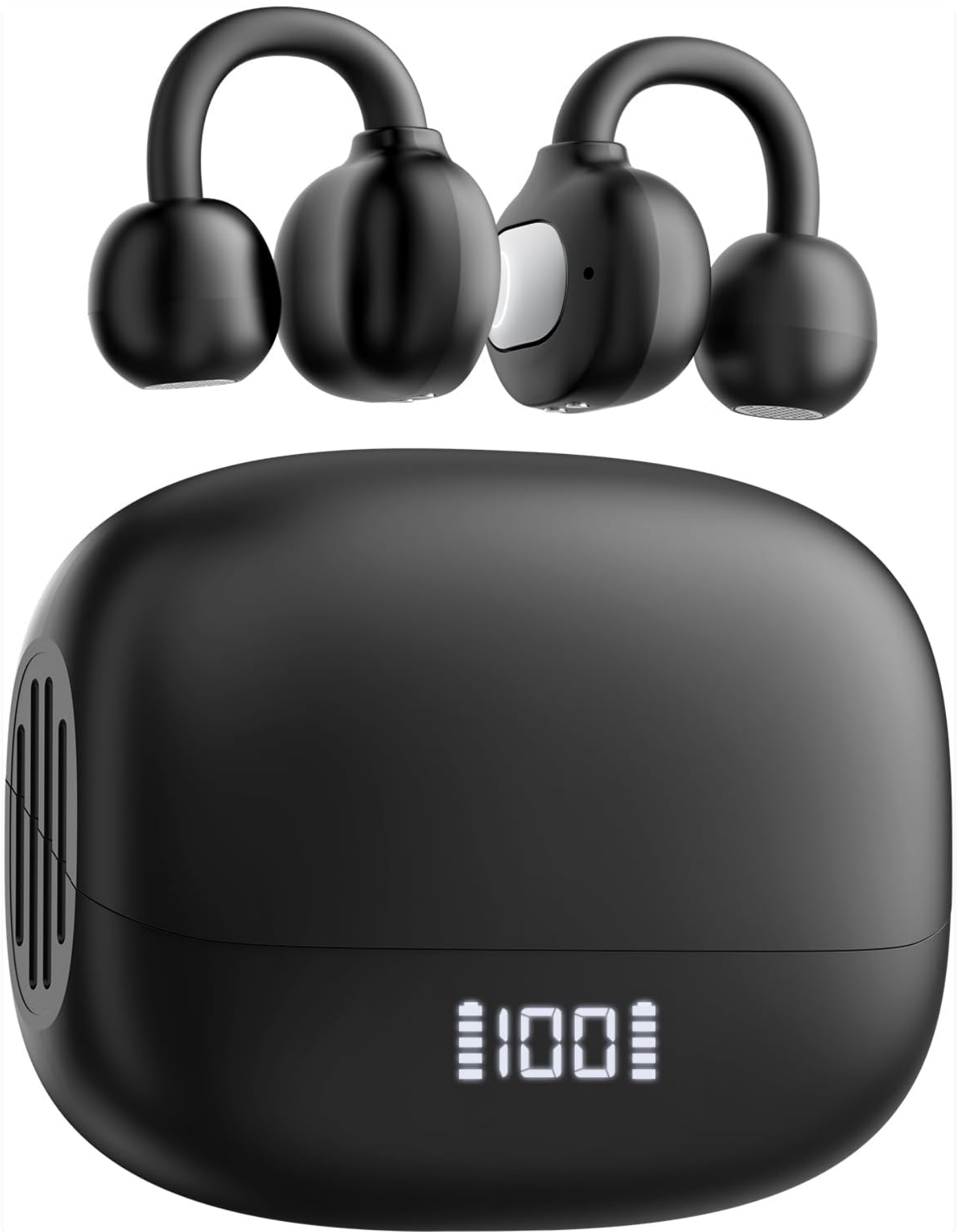
Image: PSIER Open Ear Earbuds and their charging case, showcasing the sleek black design and the digital battery display on the case.