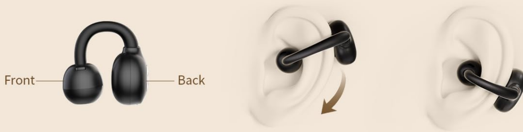
Image: A step-by-step diagram illustrating the correct way to position and adjust the open-ear earbuds for a secure and comfortable fit.