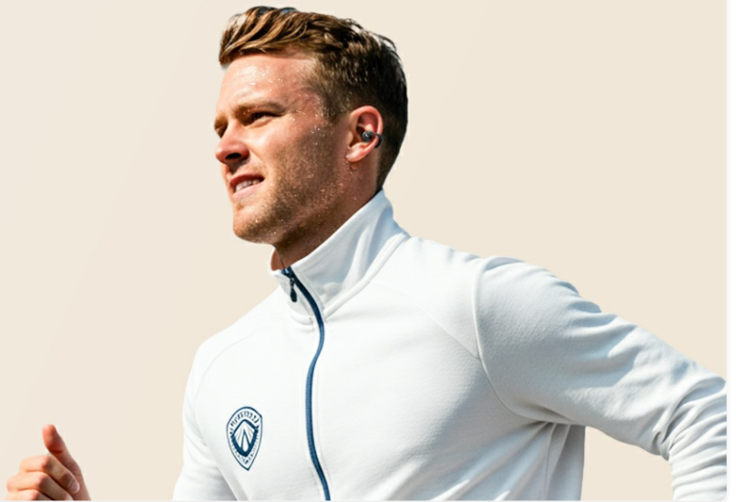
Image: A man running, with text explaining that the IPX5 rating means the earbuds can withstand sweat, rain, and splashes, making them suitable for active use.

Designed to withstand sweat, rain, and splashes, earbuds keep up with your active lifestyle, whether you're working out, commuting, or caught in unexpected weather.