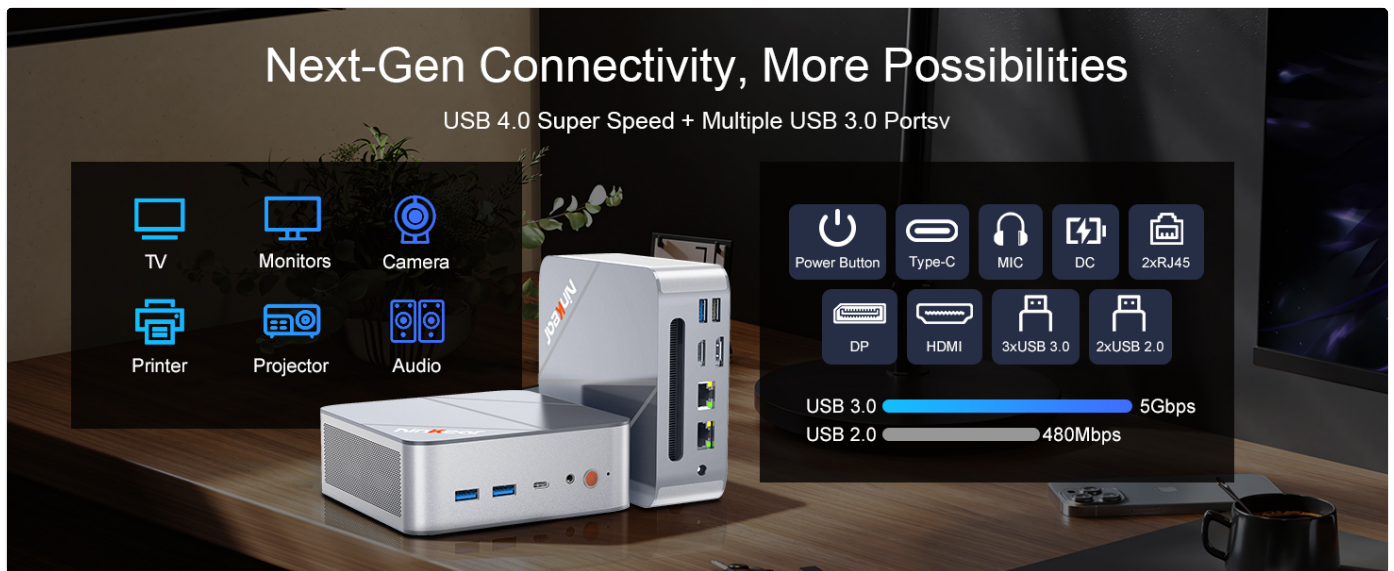
Figure 2.3: Comprehensive Connectivity Options.