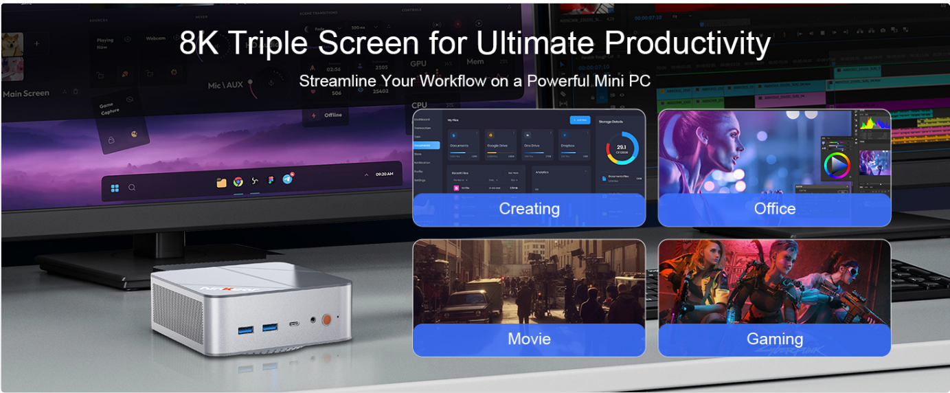
Figure 2.2: Triple 8K Display Setup for Enhanced Productivity.