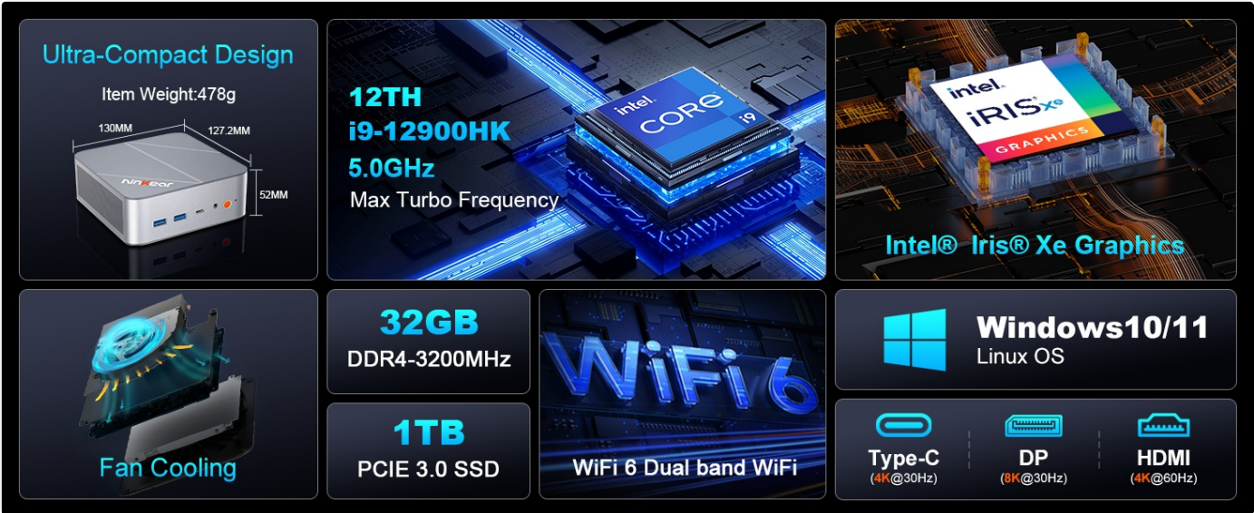
Figure 2.1: Key Features and Specifications Overview.