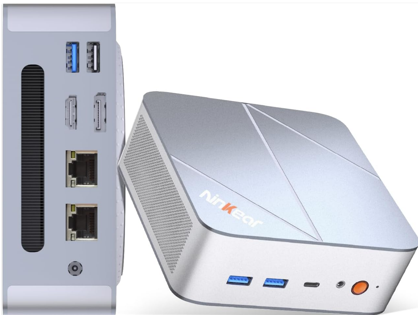
Figure 1.1: Ninkear L12Pro Mini PC - Front and Side View with Ports.

Thank you for choosing the Ninkear L12Pro Gaming Mini PC. This compact yet powerful desktop computer is designed to deliver exceptional performance for a wide range of applications, from demanding gaming and 4K video editing to business productivity and multi-display setups. Featuring an Intel Core i9-12900HK processor, 32GB of RAM, and a 1TB NVMe SSD, the L12Pro offers a seamless and responsive computing experience. This manual provides essential information for setting up, operating, maintaining, and troubleshooting your new Mini PC.