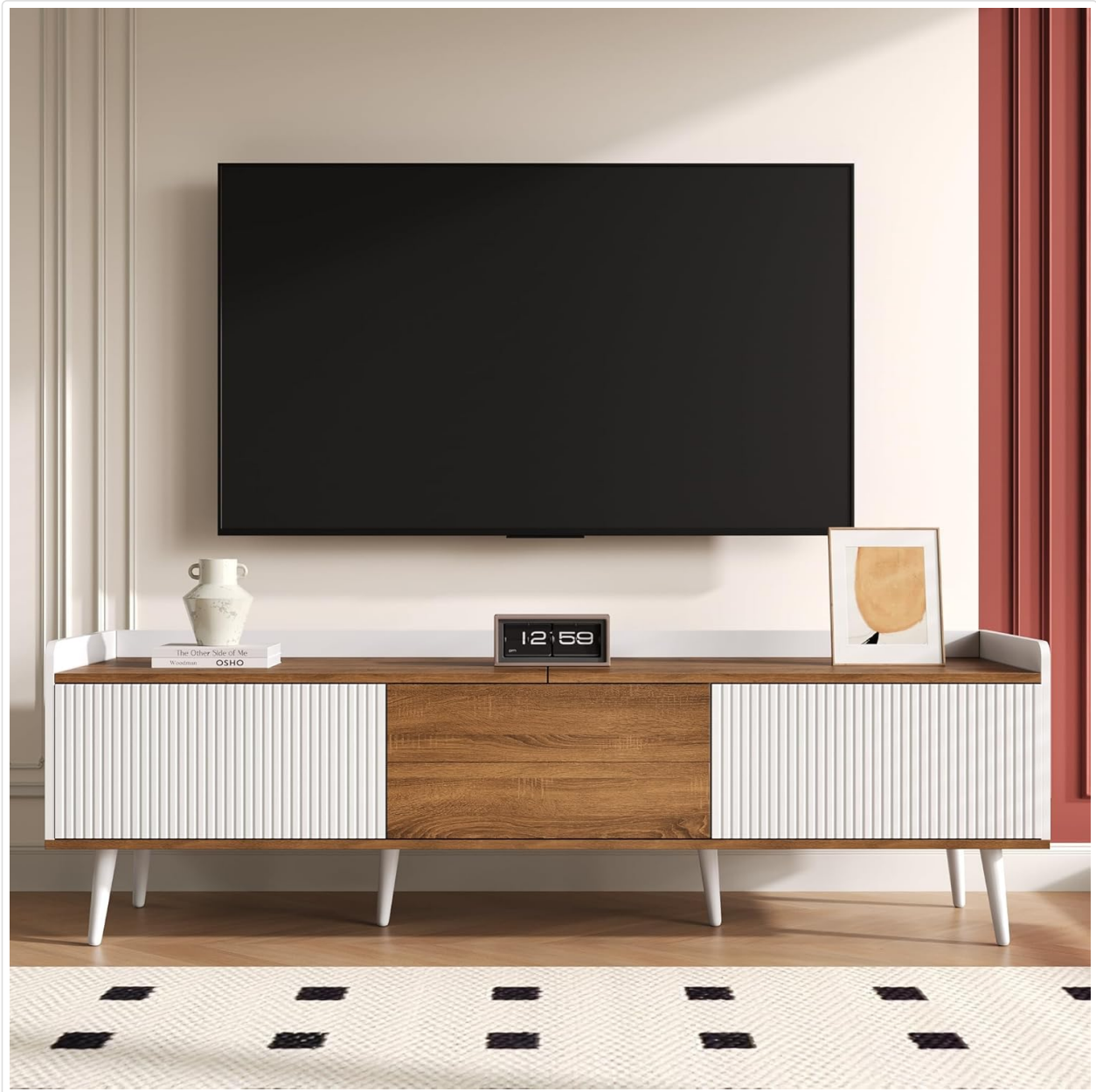
Image: This image displays the assembled FammyLoft 63 Inch Mid Century Modern TV Stand in a living room environment, featuring its two-tone white and natural walnut finish, three doors, and tapered legs. A television is shown mounted on the wall above the stand.