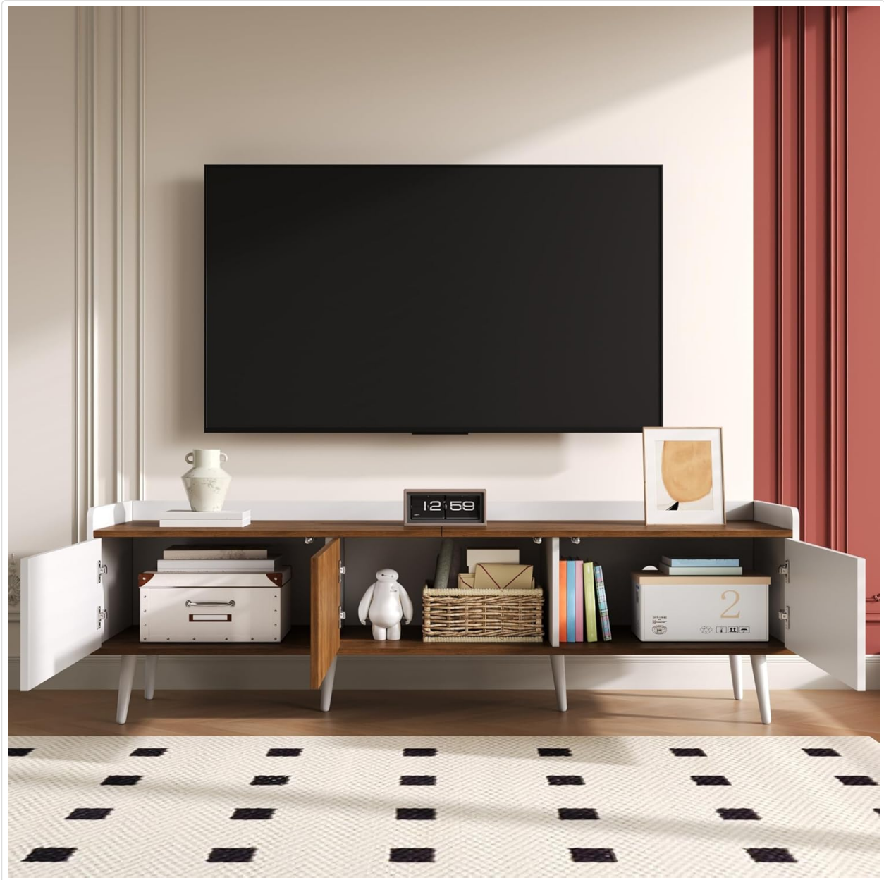
Image: The TV stand is shown with its three doors open, illustrating the spacious internal storage areas. Two circular cutouts for cable management are visible in the back panels of the side compartments.