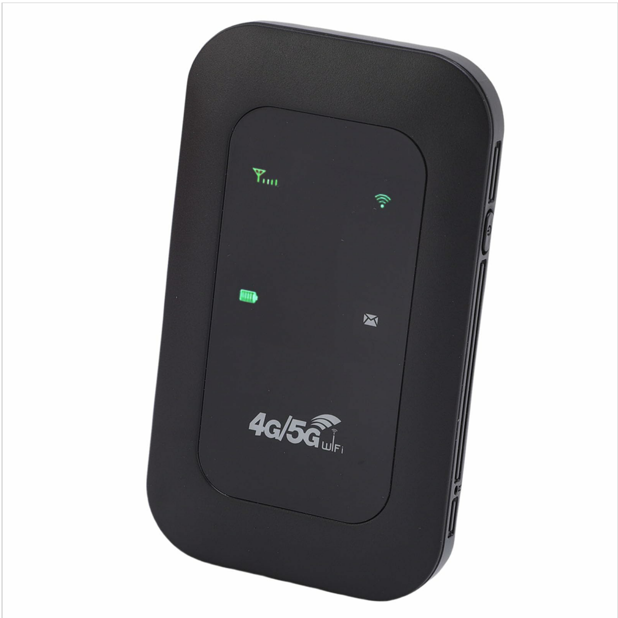
Image: The VELATEMOR Portable WiFi Hotspot, a sleek black device, is displayed with icons highlighting its key features: a Type-C interface, support for 4G/5G high-speed internet, and a 2100mAh battery.