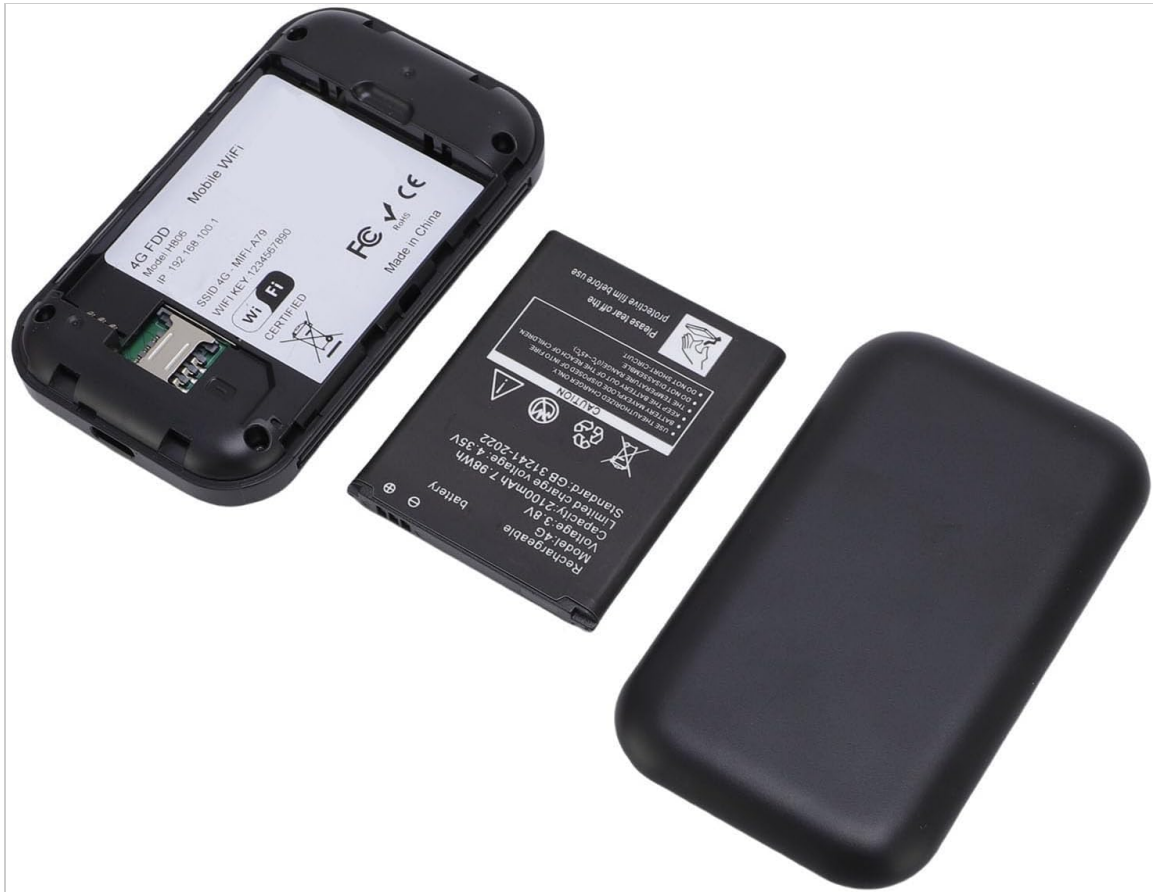
Image: Back of the VELATEMOR Portable WiFi Hotspot with the cover removed, revealing the battery compartment and the Micro SIM card slot. The SIM card slot is clearly visible for insertion.