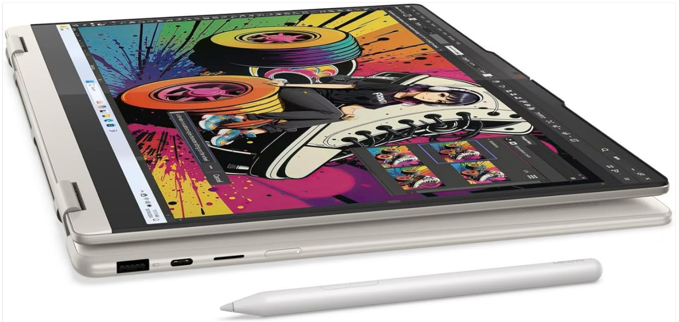
Figure 4: Using the Lenovo Linear Pen in tablet mode.