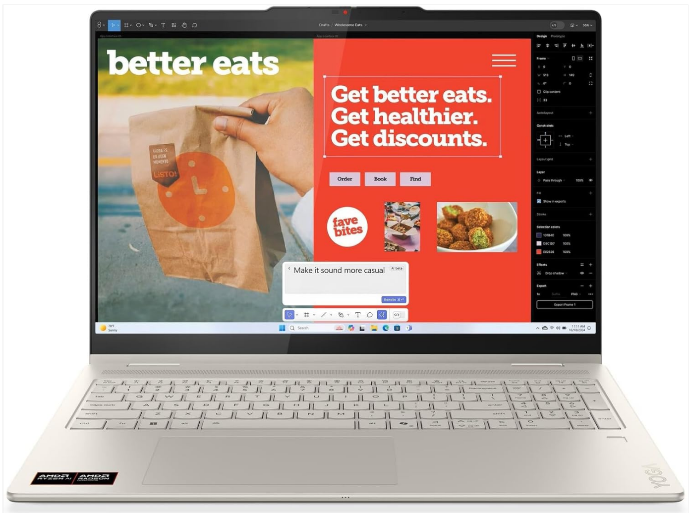
Figure 1: Lenovo Yoga 7 2-in-1 in laptop mode.