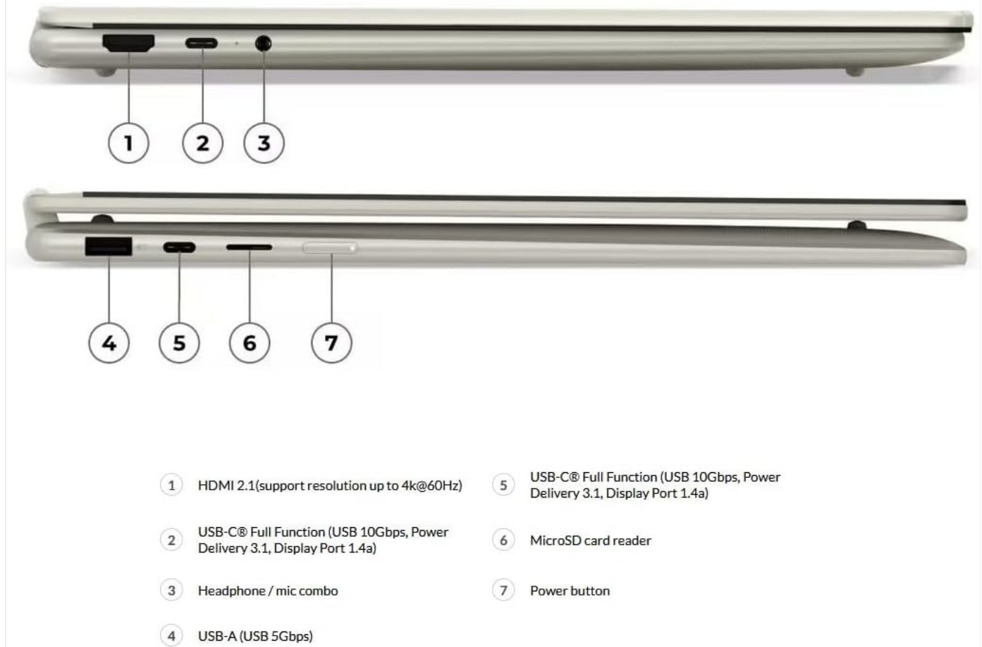
Figure 2: Ports and Slots Diagram.