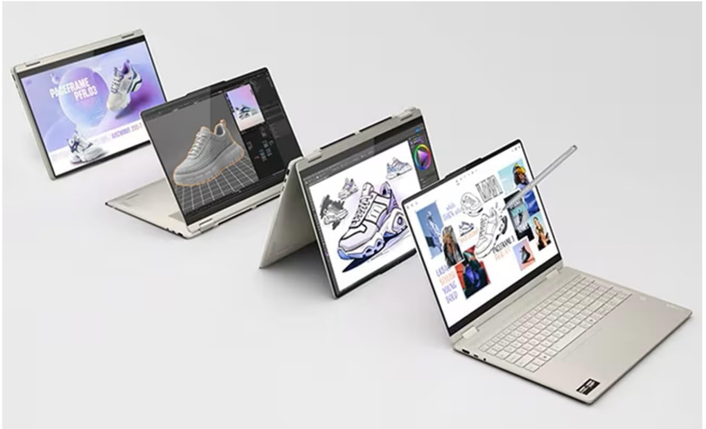
Figure 3: The Yoga 7 2-in-1 adapting to various modes.