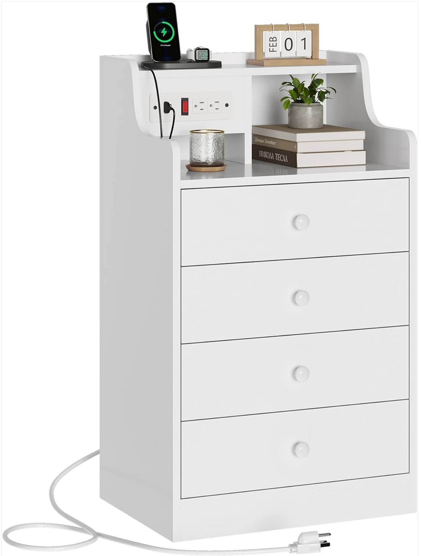
Image: The ADORNEVE Nightstand, a white furniture piece featuring a top shelf with an integrated charging station, an open hutch, and four spacious drawers below. A power cord extends from the back.