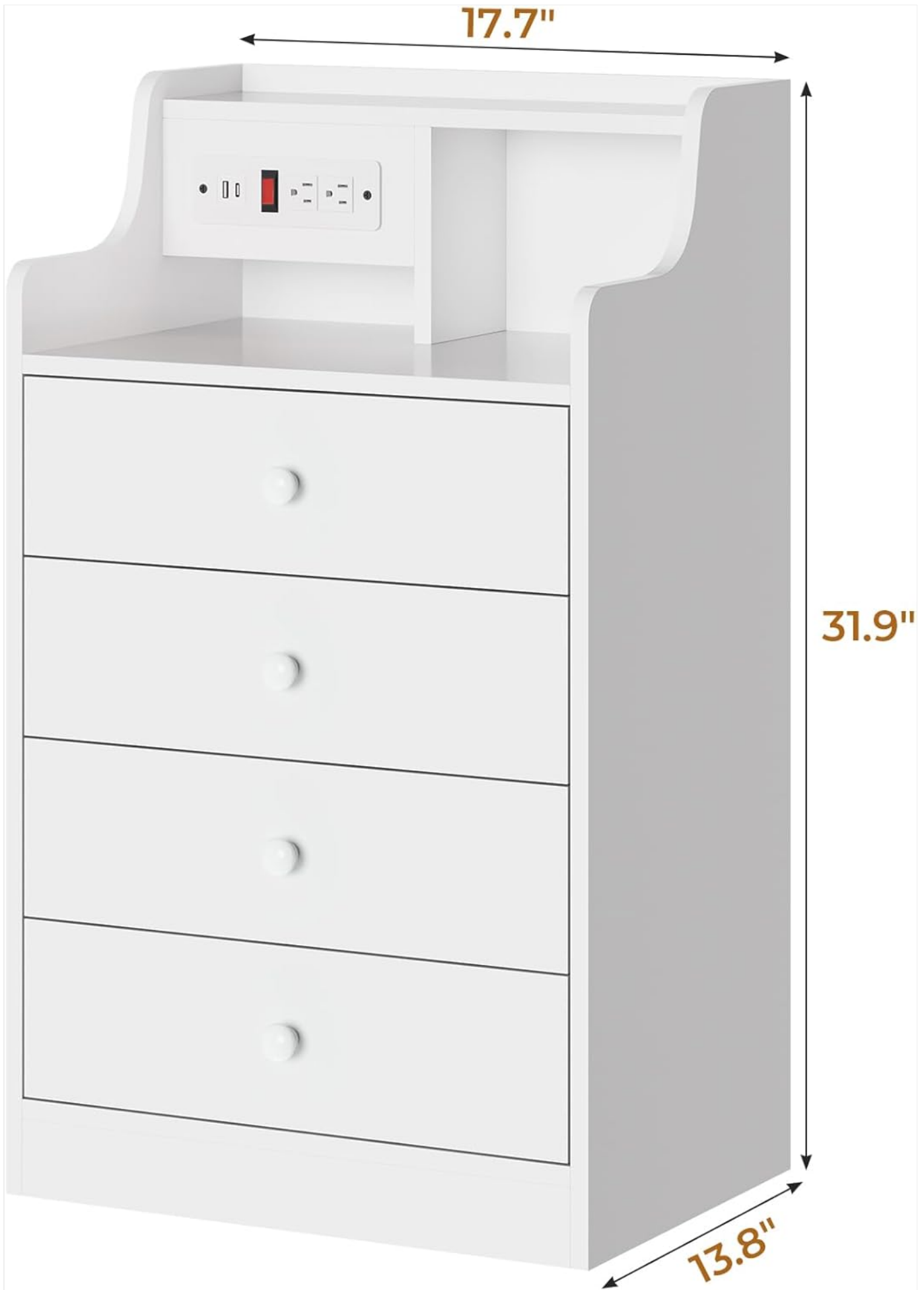
Image: Diagram showing the dimensions of the nightstand: 17.7 inches wide, 13.8 inches deep, and 31.9 inches high.