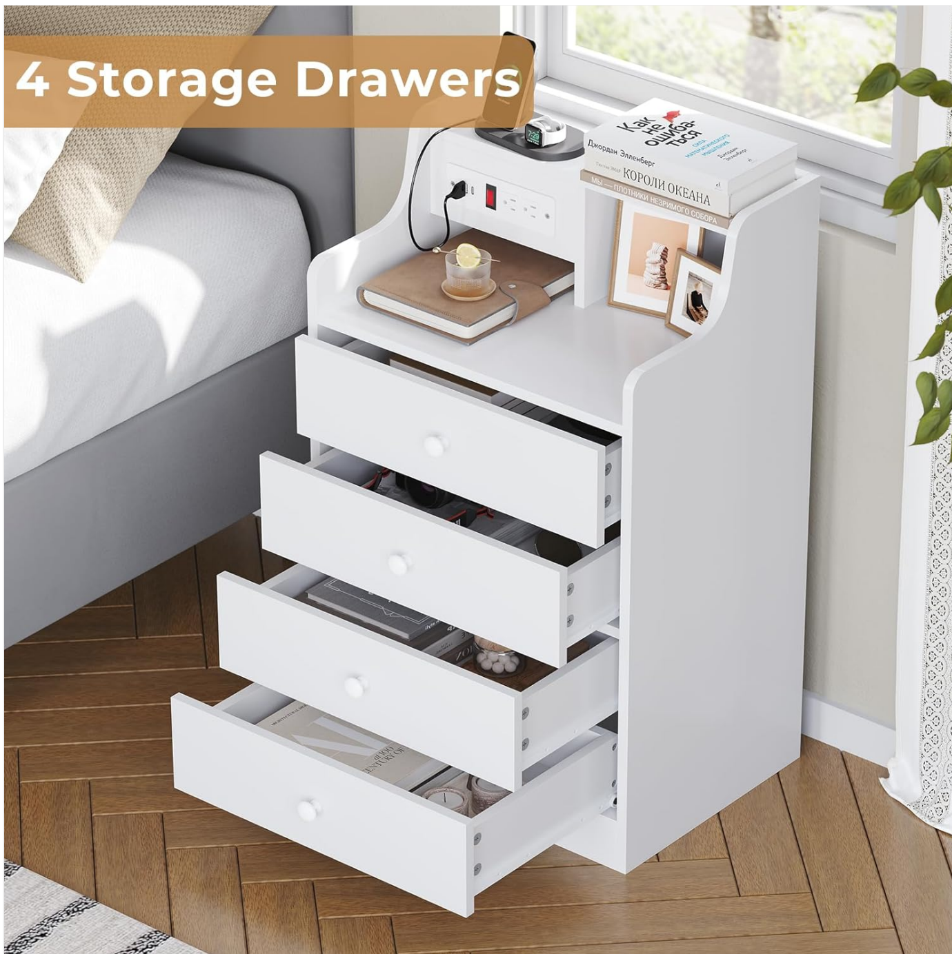
Image: The white nightstand with all four drawers partially open, revealing their storage capacity for various items.

The nightstand features four smooth-gliding drawers for organized storage. To open, gently pull the handle. To close, push the drawer firmly until it is fully seated. Avoid forcing drawers if they encounter resistance. The hutch above the tabletop provides additional open storage or display space.