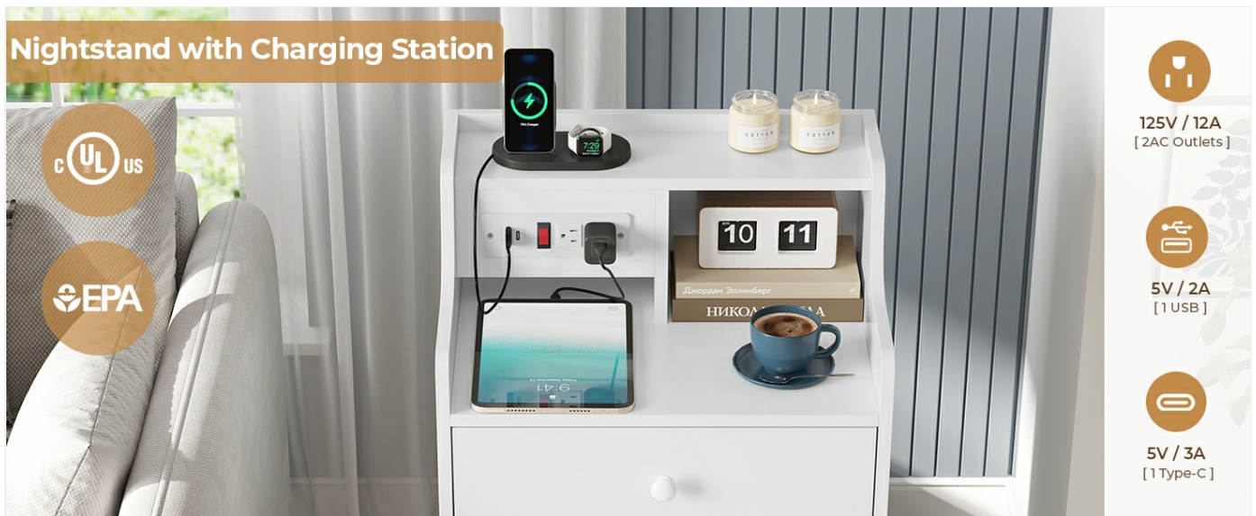
Image: Close-up of the nightstand's charging station, highlighting its features: two 125V/12A AC outlets, one 5V/2A USB-A port, and one 5V/3A USB-C port.