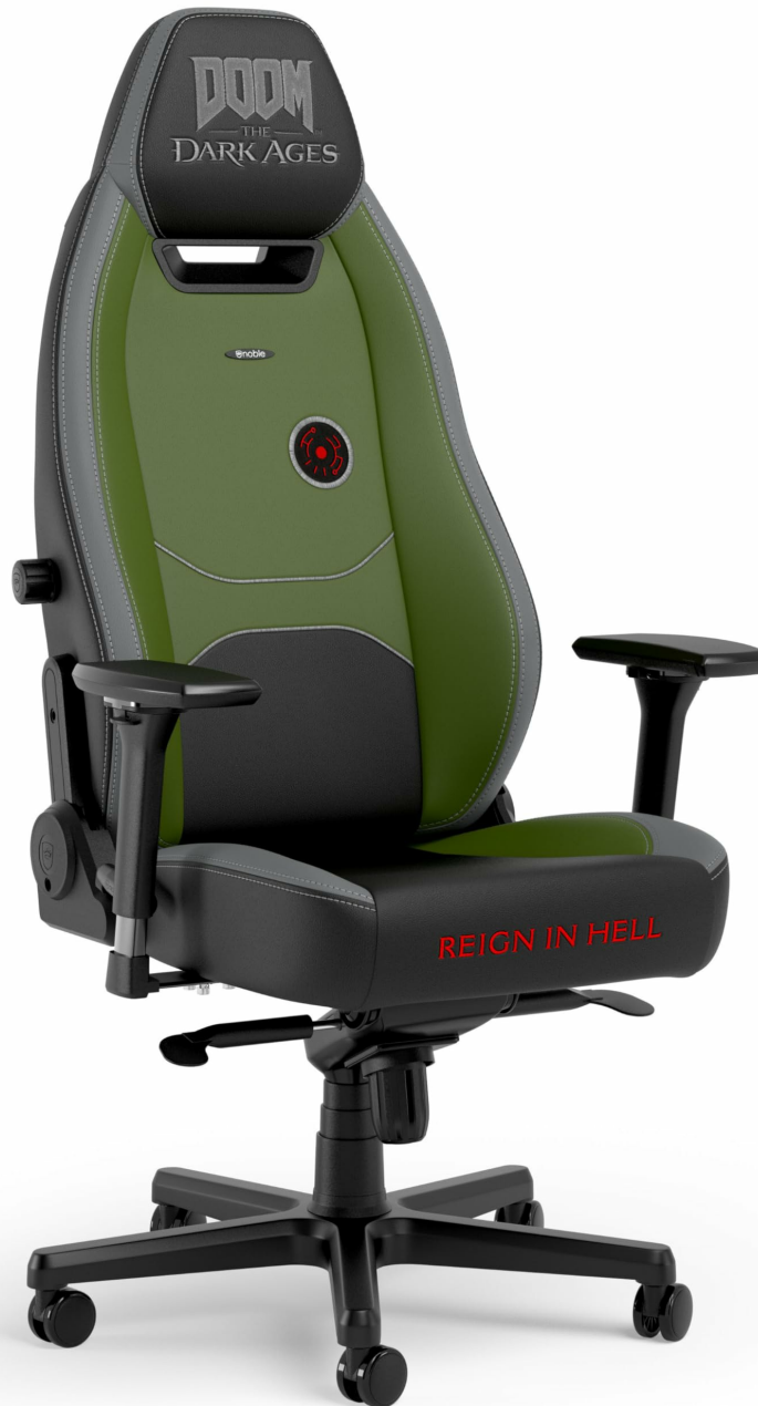
Image: The noblechairs Legend Gaming Chair - Doom: The Dark Ages Edition, showcasing its unique design and color scheme.