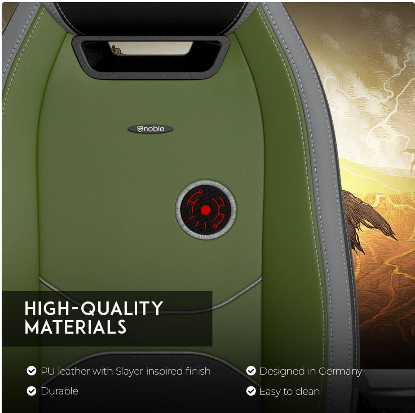
Image: Detail of the chair's high-quality PU leather and stitching, emphasizing the durable construction.