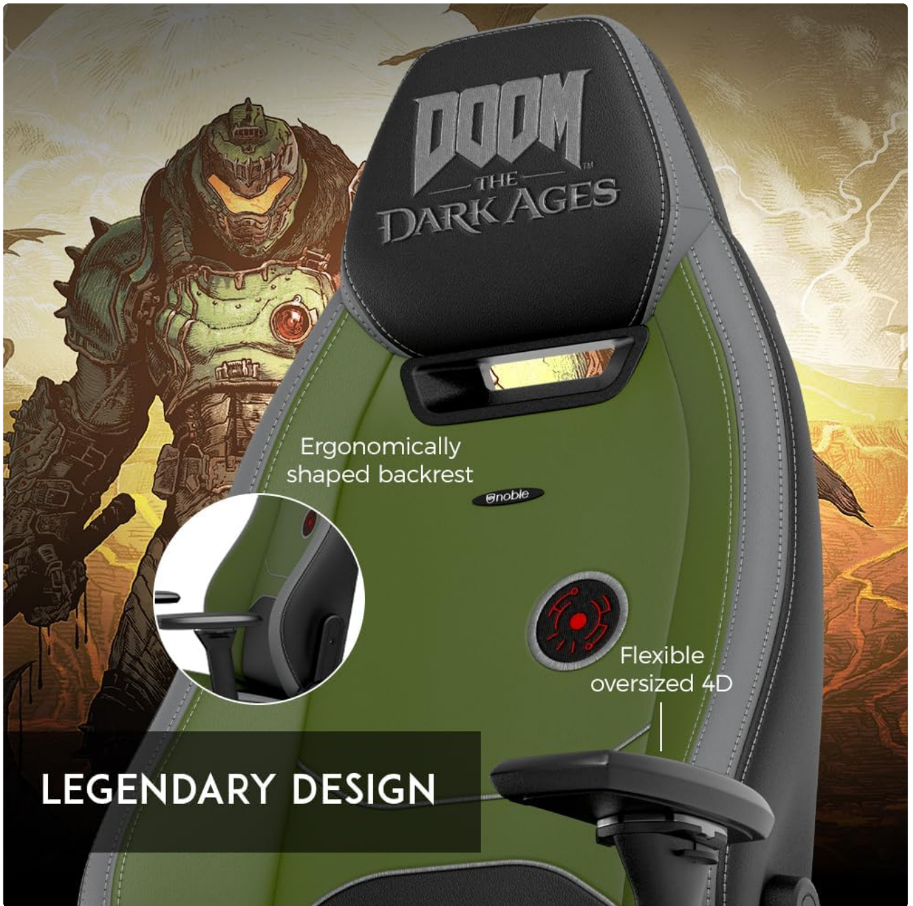
Image: Close-up of the chair's backrest, highlighting the ergonomically shaped design and the "Doom The Dark Ages" logo.