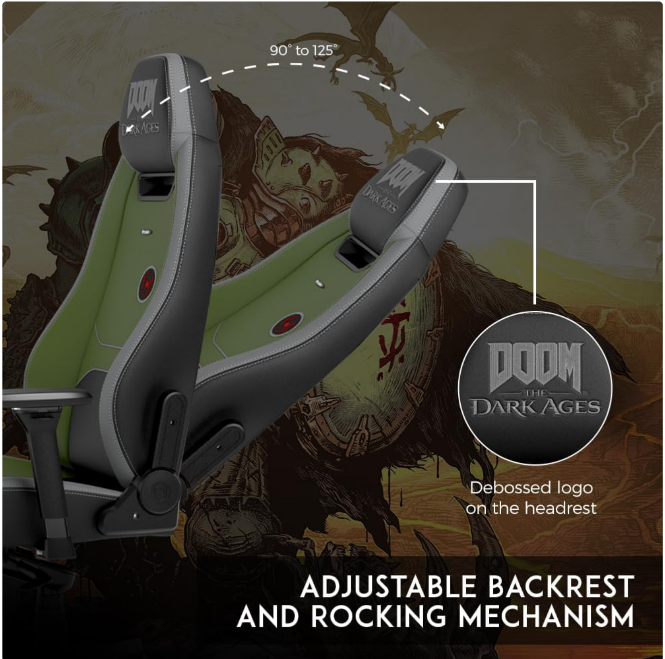
Image: Illustration of the adjustable backrest, demonstrating the recline range from 90 to 125 degrees.