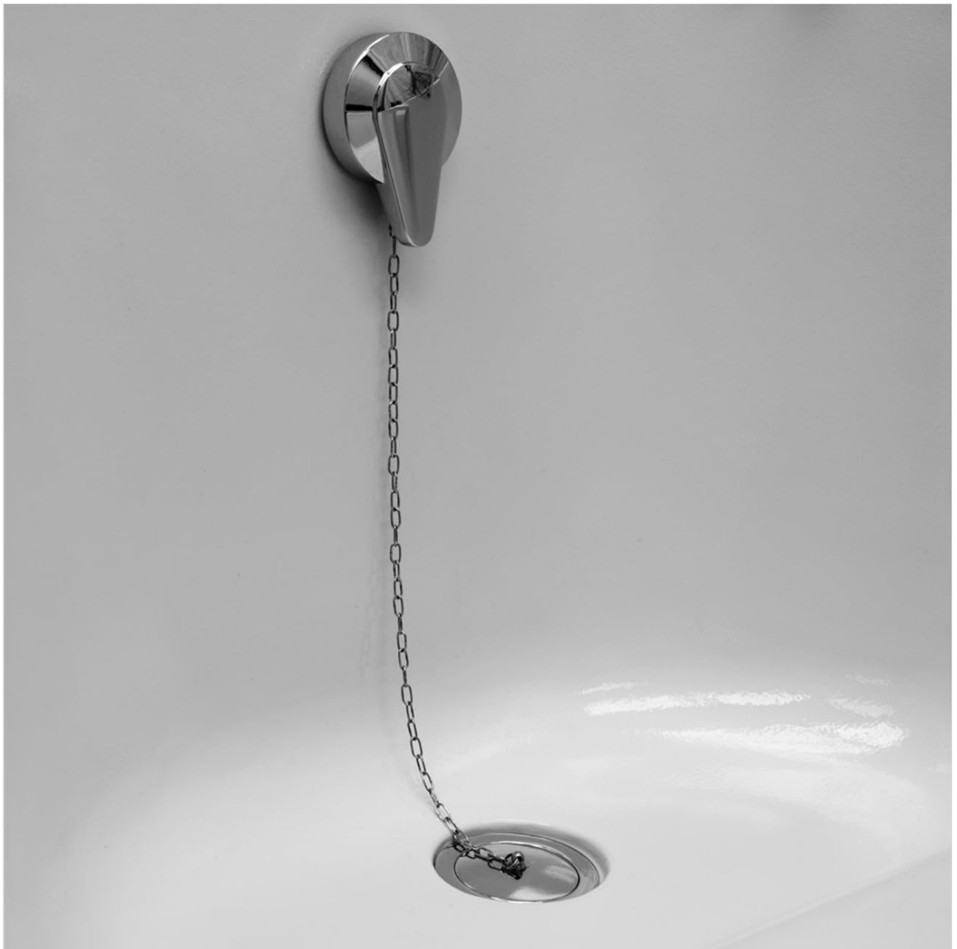
Figure 4.2: Close-up view of the tub drain and stopper mechanism. This illustrates the design for efficient water drainage.