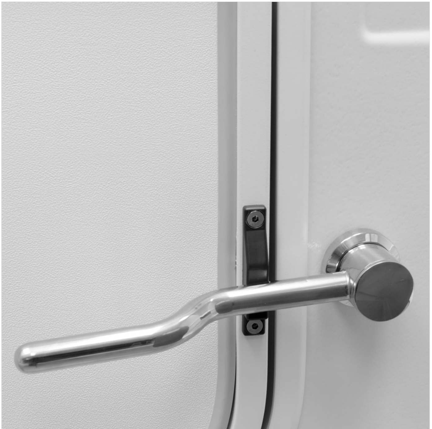
Figure 4.1: Detail of the tub door handle and locking mechanism. This shows the ergonomic design for easy opening and secure closing.