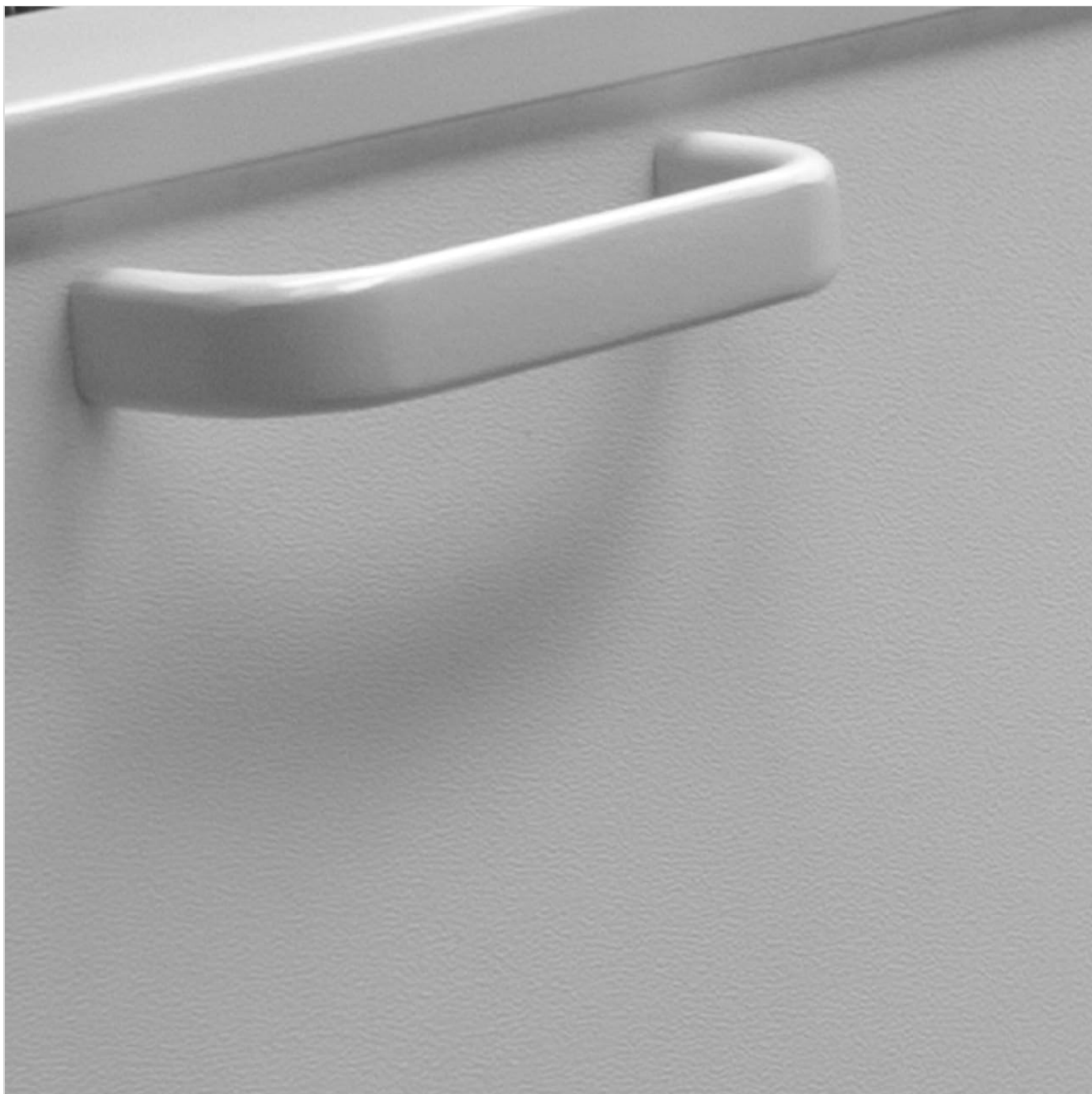
Figure 4.3: Detail of an integrated safety grab bar. These bars provide crucial support for users entering and exiting the tub.