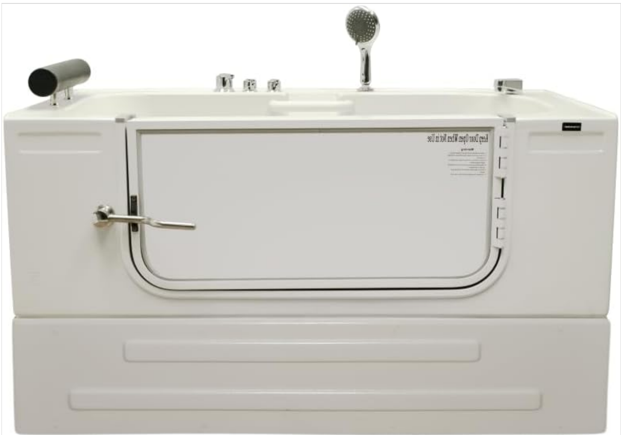
Figure 2.2: The Neptune Sit-In Tub with its door securely closed, ready for use. This image demonstrates the compact and integrated appearance when not in use.