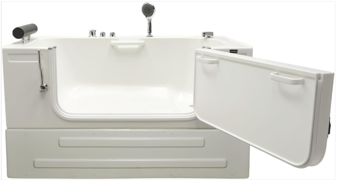
Figure 2.1: The Neptune Sit-In Tub with its door open, showcasing the spacious interior and integrated features. This view highlights the accessibility design.