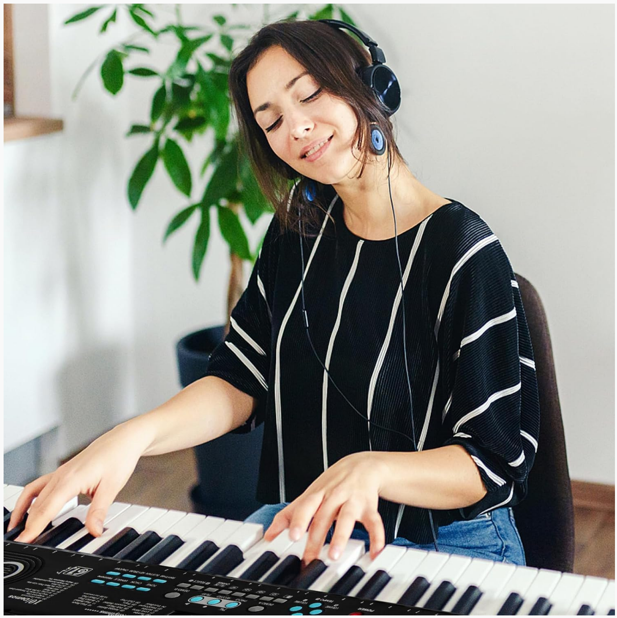
Image 6.1: A user playing the LDAILY keyboard piano while wearing headphones, demonstrating the private practice capability.