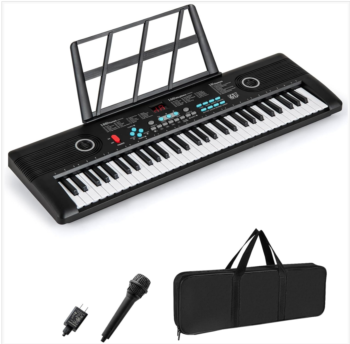
Image 3.1: The LDAILY 61 Key Keyboard Piano with its complete set of accessories, including the music stand, microphone, power adapter, and carrying case.