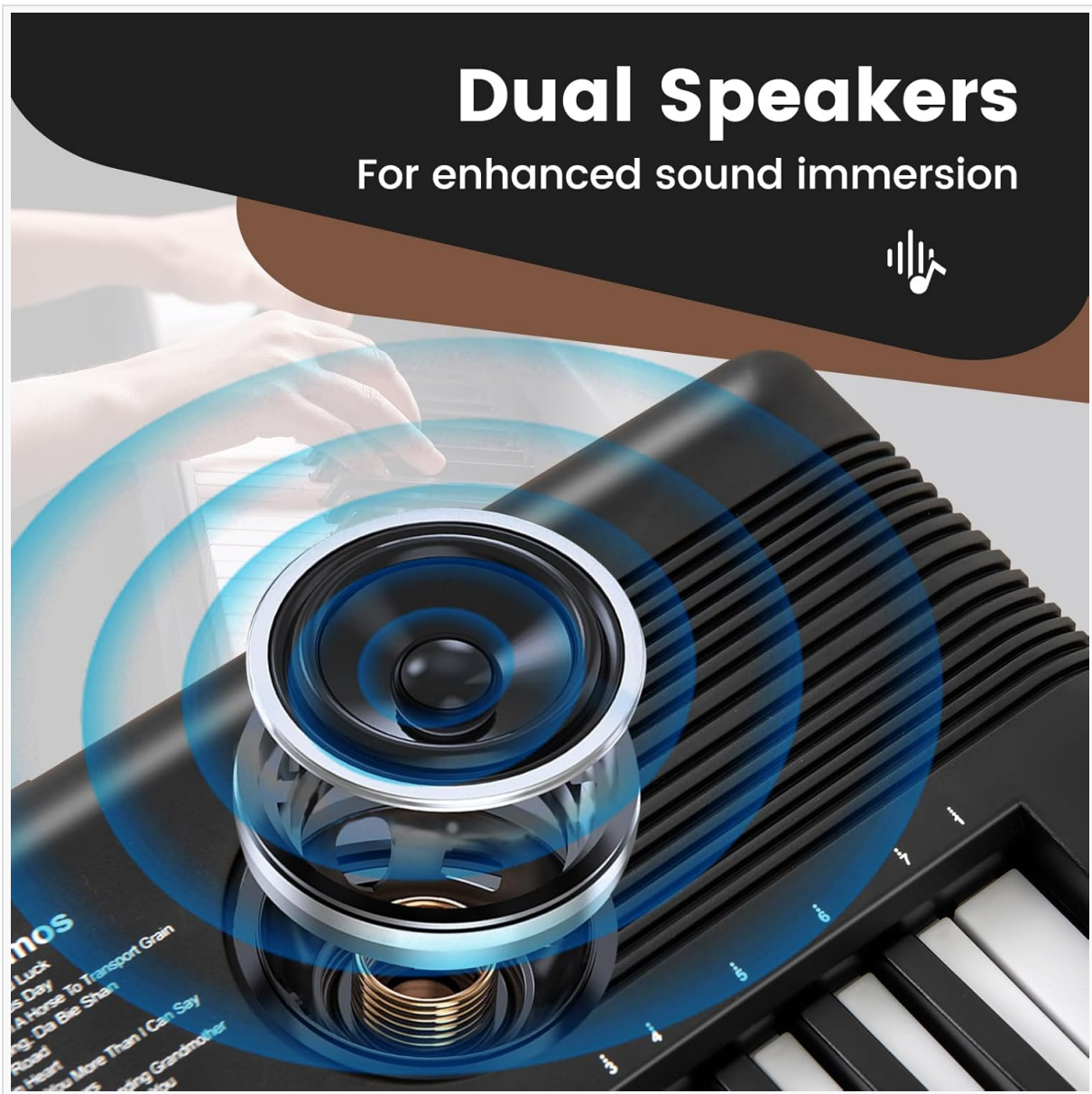
Image 4.3: Diagram illustrating the location of the dual built-in speakers on the keyboard, designed for enhanced sound output.

The keyboard features dual high-fidelity speakers for clear sound reproduction.