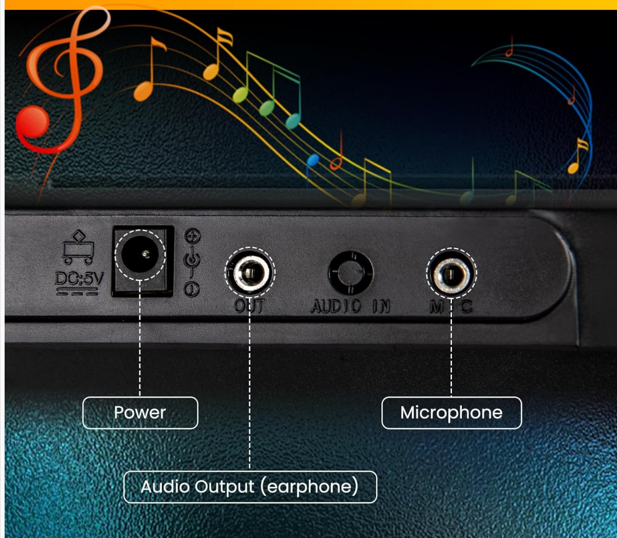
Image 4.2: Close-up view of the connectivity panel, showing the Power input (DC 5V), Audio Output (for headphones), Audio In, and Microphone input ports.