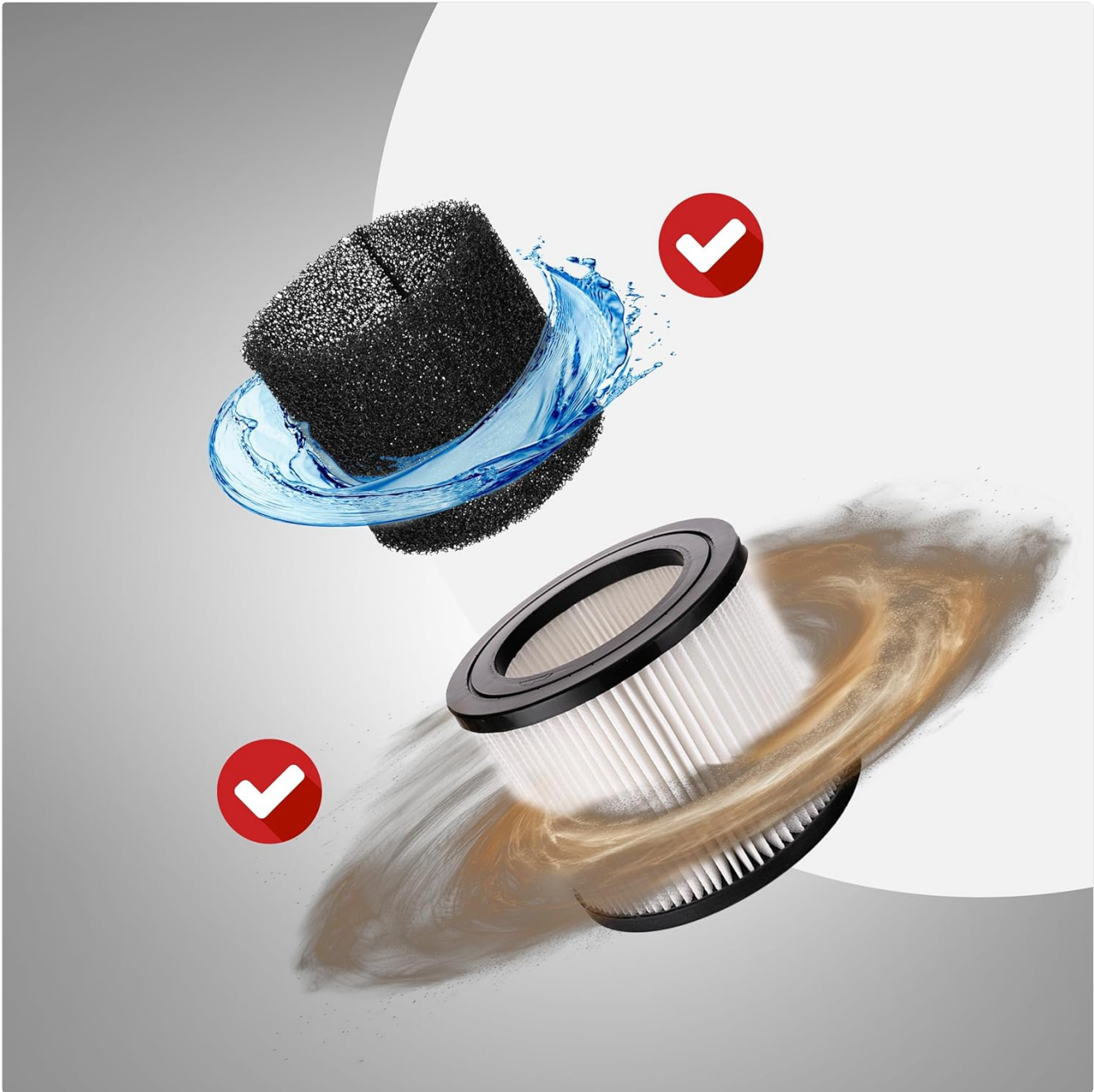
Figure 7: Visual representation of the washable HEPA and foam filters, emphasizing their role in capturing dust and protecting the motor during wet and dry operations.