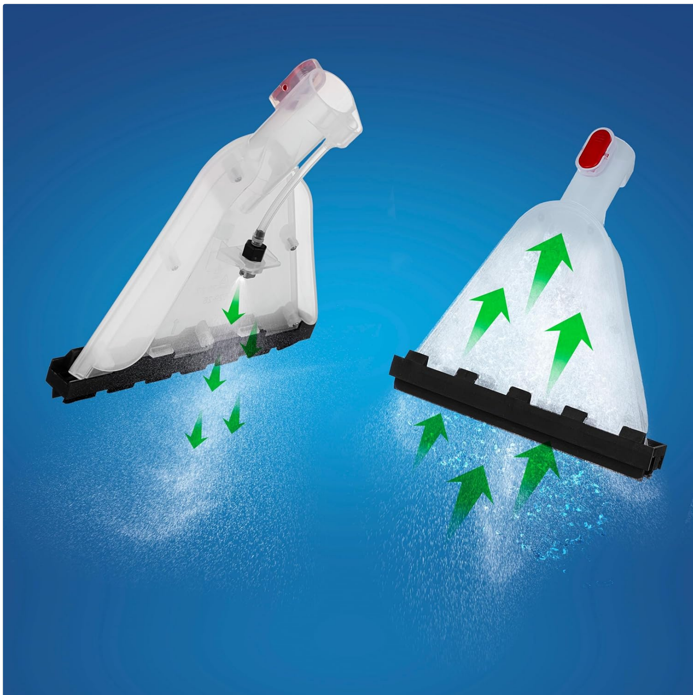
Figure 5: Detailed view of the cleaning nozzle, showing the spray pattern for applying cleaning solution and the suction path for effective dirt and liquid removal.