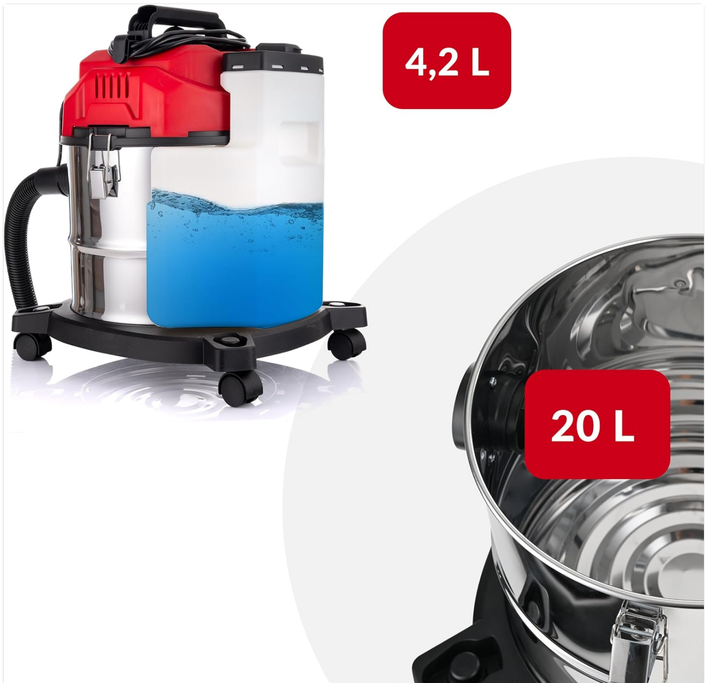
Figure 2: Illustration of the cleaner's dual tank system, highlighting the 4.2-liter fresh water tank and the 20-liter dirty water collection tank. This system allows for efficient cleaning without frequent emptying or refilling.