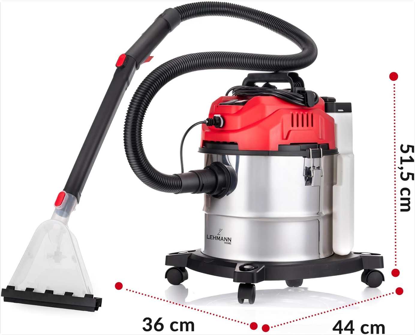
Figure 8: Product dimensions of the LEHMANN Carpet and Upholstery Cleaner, showing its height, width, and depth for easy storage and planning.

Technical specifications for the LEHMANN Carpet and Upholstery Cleaner (Model LHOVW-1220).