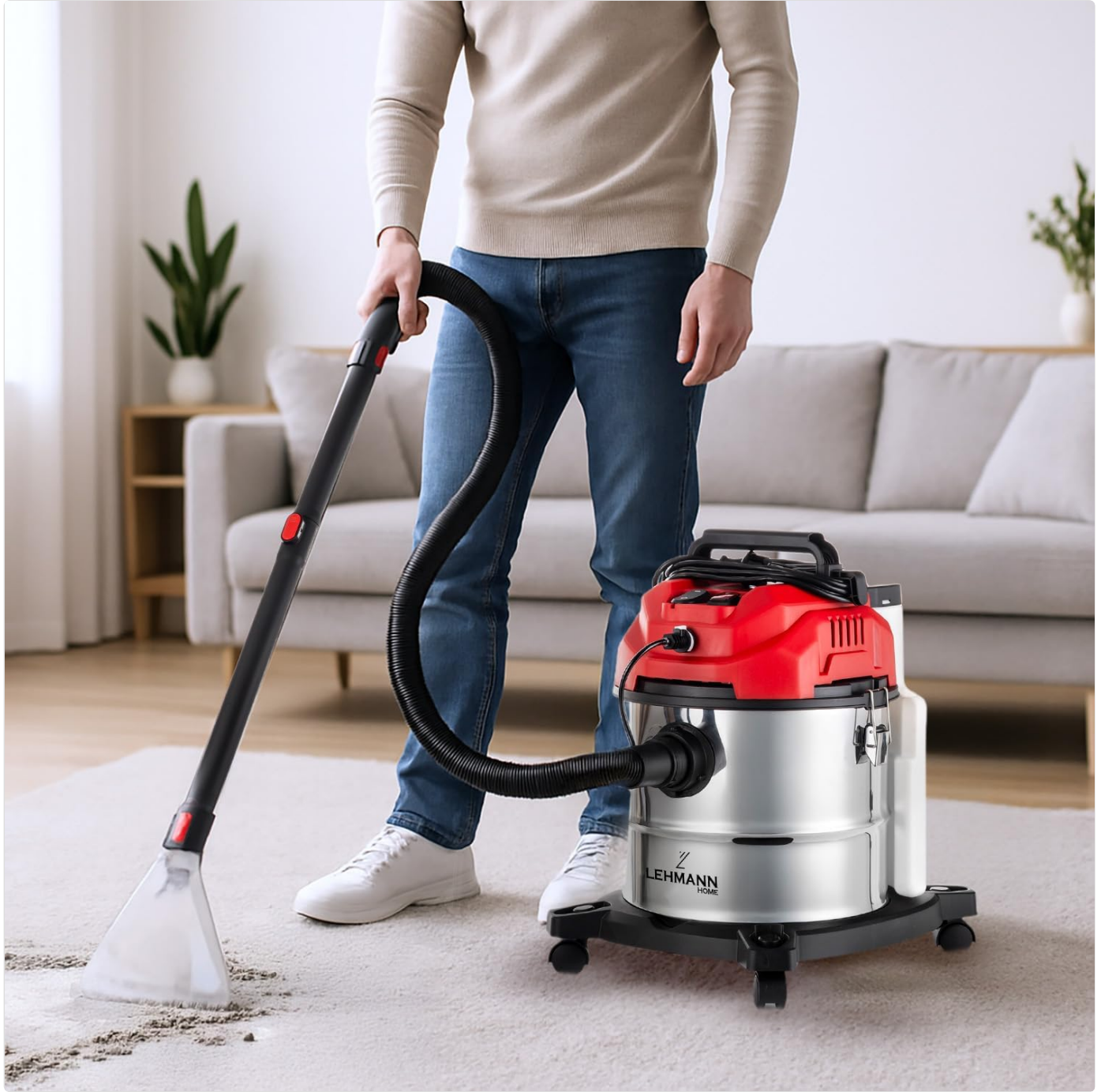
Figure 4: A user demonstrating the effective use of the LEHMANN cleaner on a carpet, illustrating its ease of maneuverability and cleaning reach.

This mode is ideal for deep cleaning and stain removal.