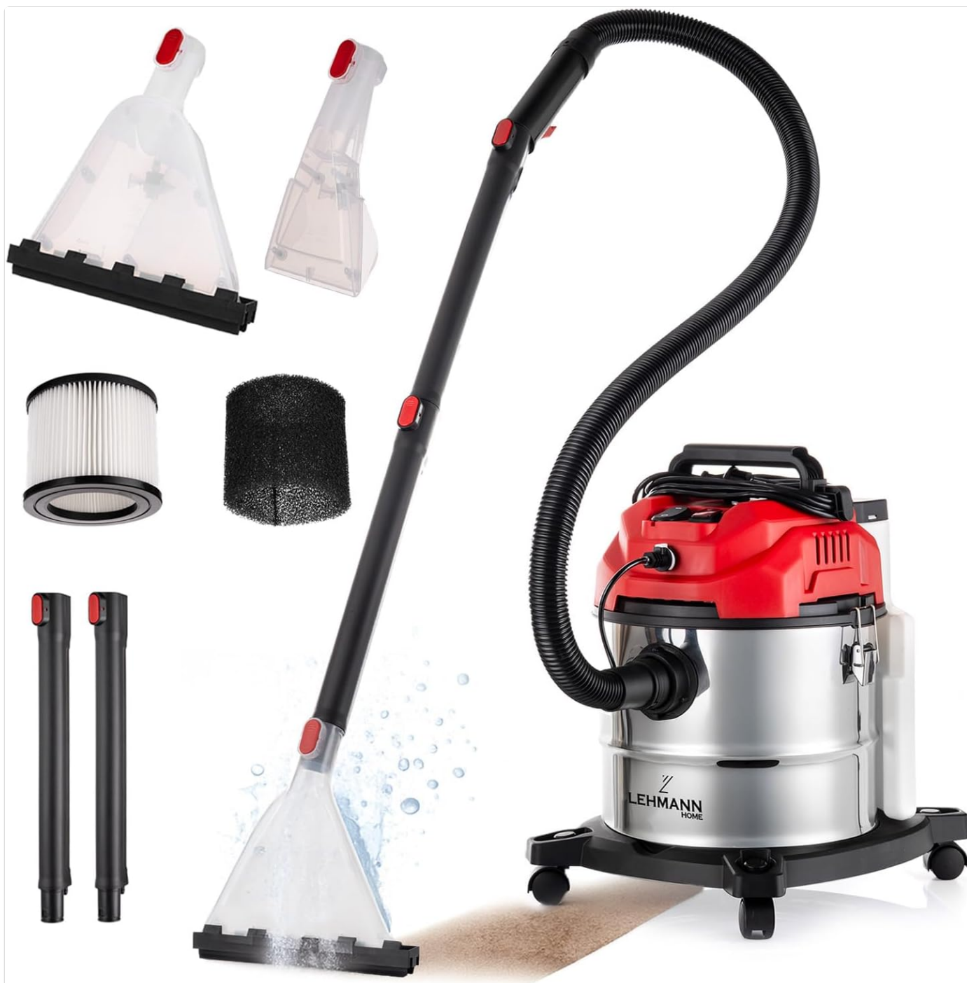
Figure 1: Overview of the LEHMANN Carpet and Upholstery Cleaner and its included accessories. This image displays the main unit, the flexible hose, extension wands, large and small spray nozzles, a HEPA filter, and a foam filter.