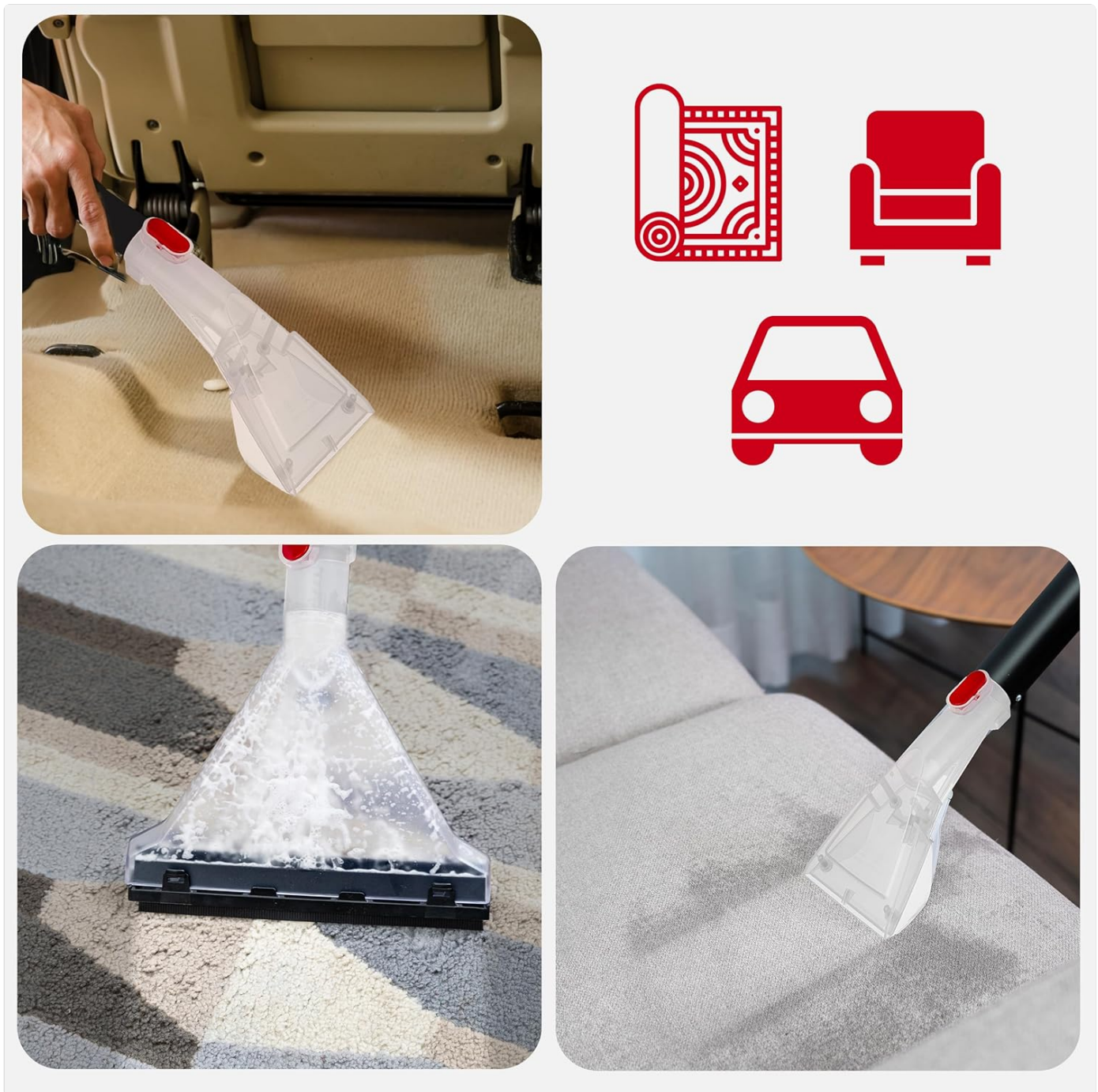
Figure 6: Examples of the cleaner's versatility, demonstrating its effective use for cleaning car interiors, large area carpets, and various types of upholstered furniture.