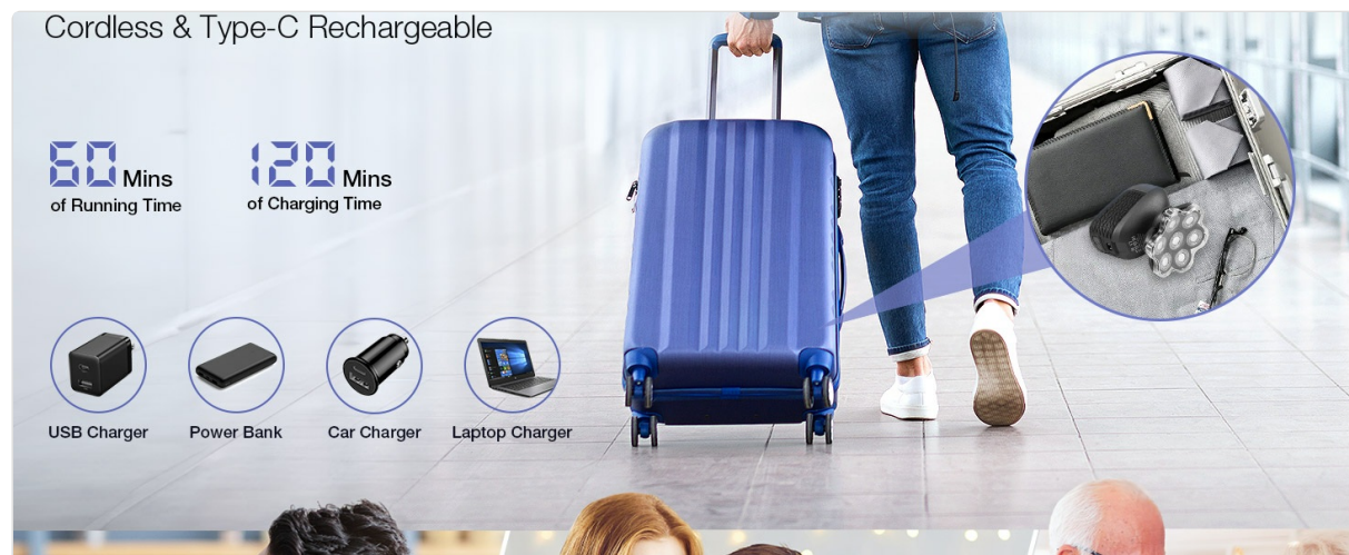
Image 4.1: The shaver is rechargeable via Type-C USB, compatible with various power sources such as USB chargers, power banks, car chargers, and laptops. It offers 60 minutes of running time after 120 minutes of charging.

indicate charging status. A full charge typically takes approximately 120 minutes.