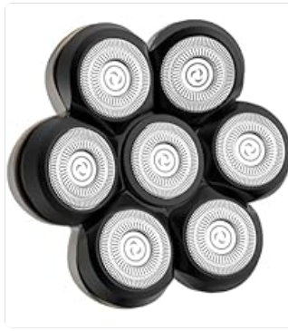
Image 6.1: A detailed view of the 7D floating shaver head, showing the individual rotary blades that require periodic cleaning and replacement.