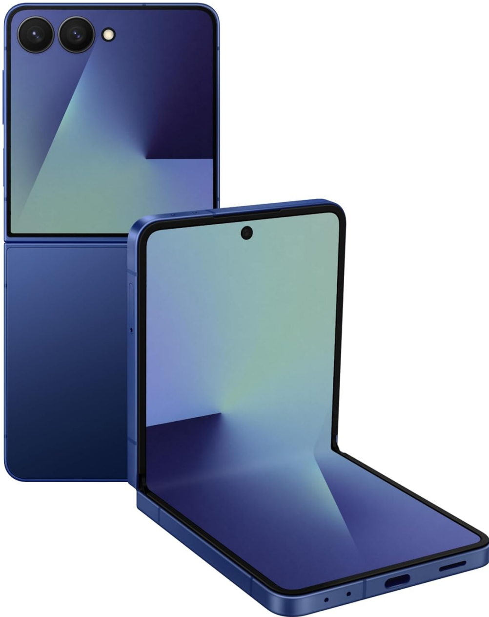
Figure 1.1: Samsung Galaxy Z Flip7 5G in Blue Shadow, showcasing its unique foldable design.