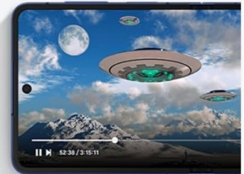
Figure 1.2: Overview of the Galaxy Z Flip7's powerful performance, including camera, display, and battery specifications.