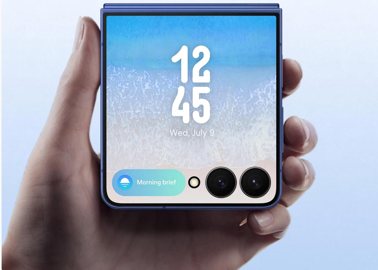
Figure 3.1: The FlexWindow in action, providing quick access to information.