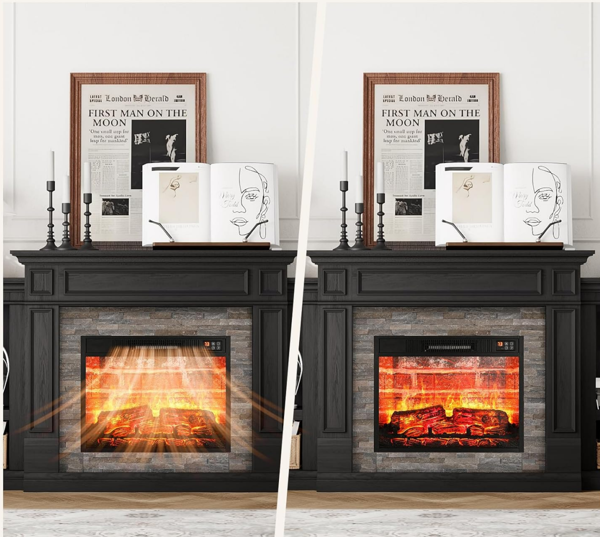
Figure 5: Fireplace operating with heat for cold and without heat for ambiance.