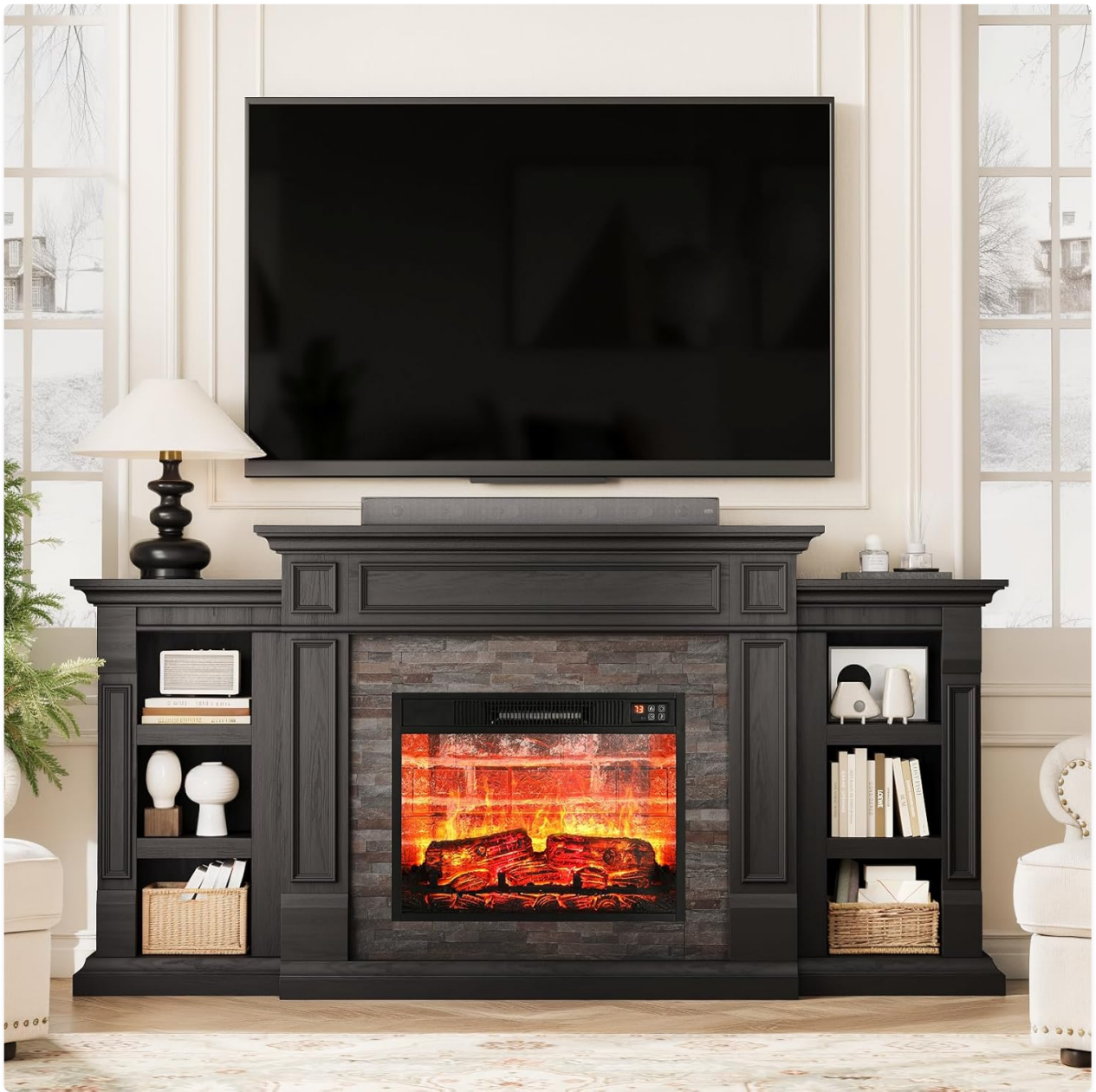
Figure 6: The TV stand with a television, showcasing its design and functionality.