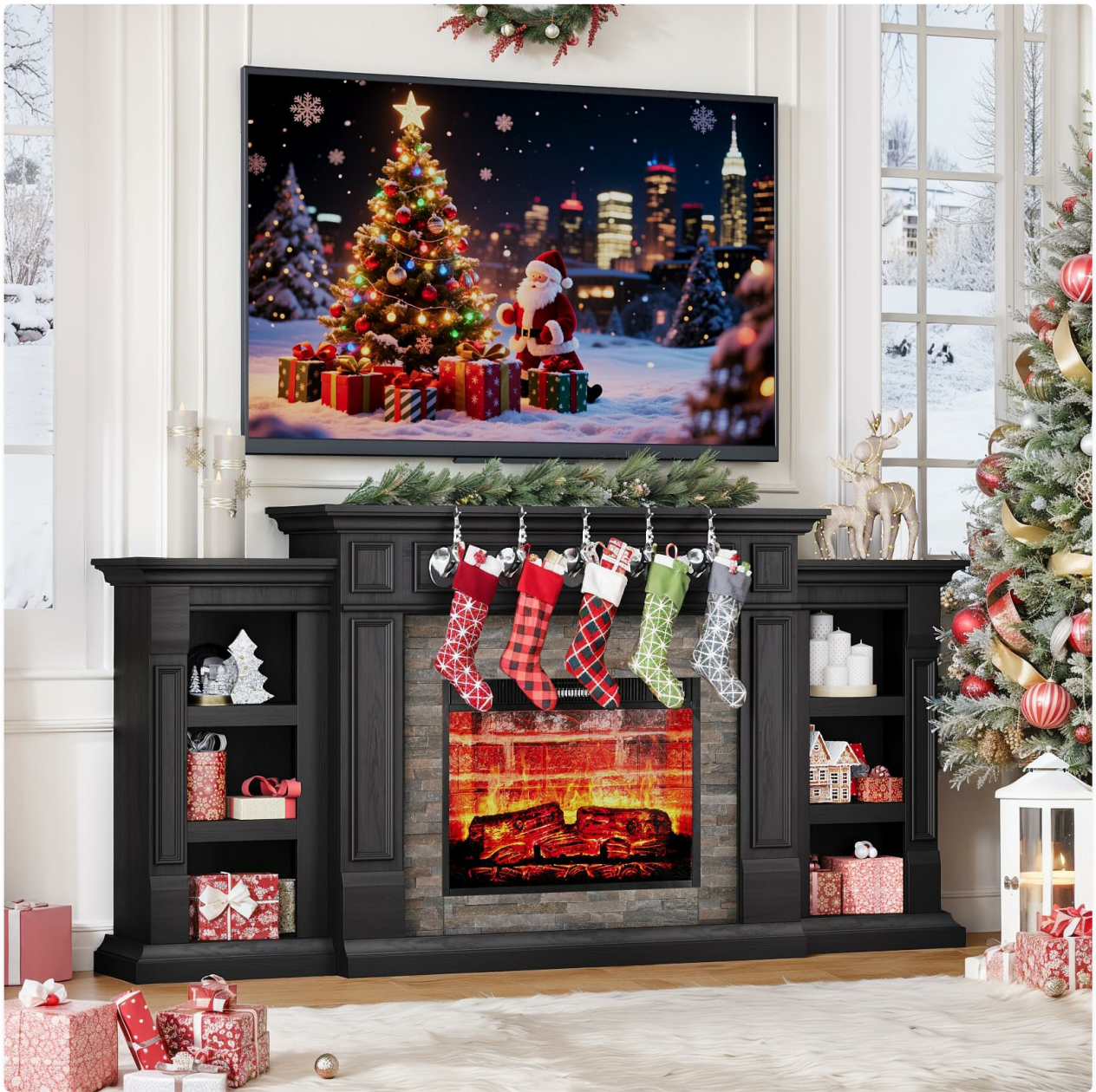
Figure 1: HolliWill 70 Inch Fireplace TV Stand in a living room setting.