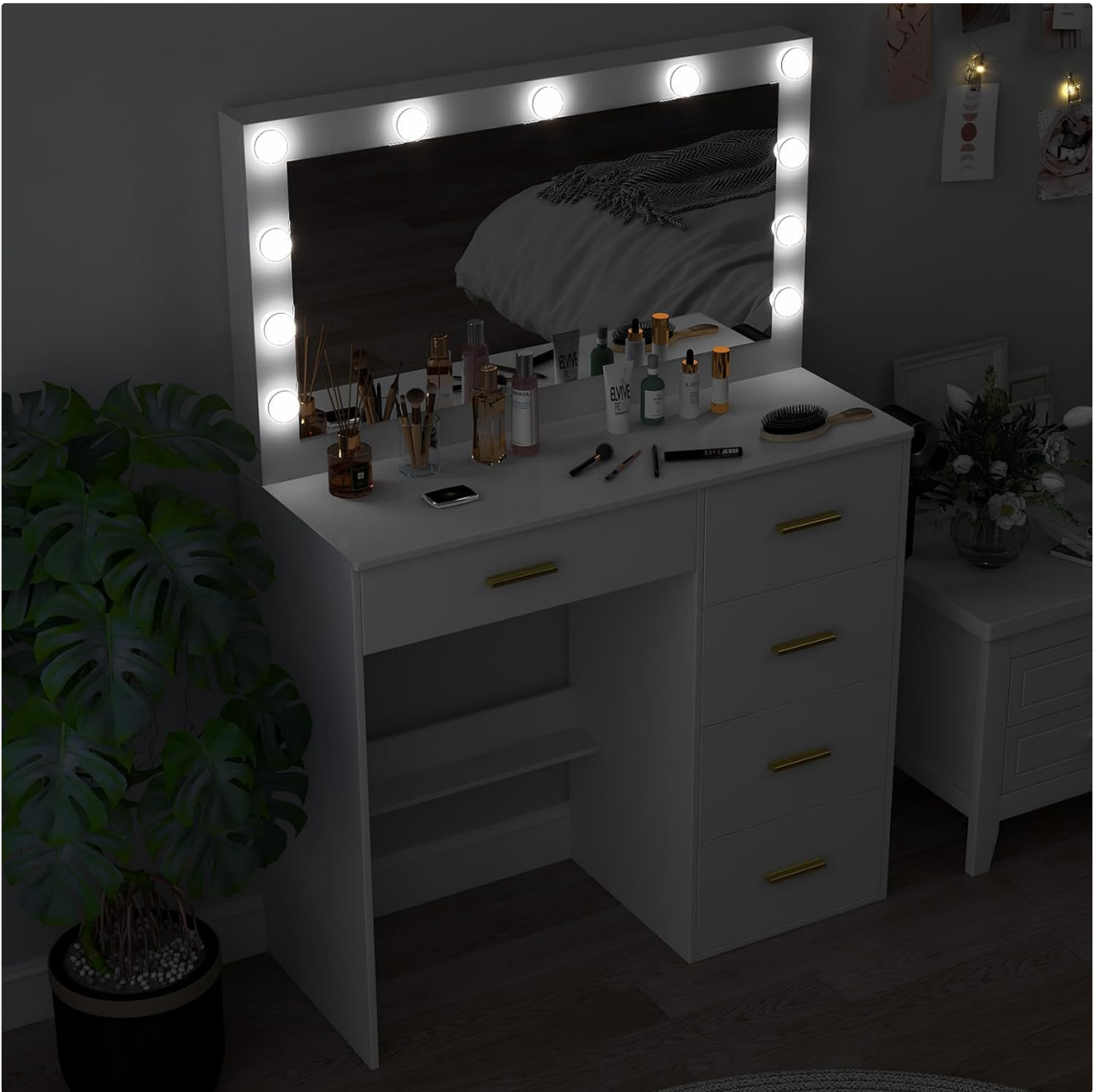
Image: The Umeiga White Makeup Vanity Desk with its large mirror and LED lights, showcasing its overall design and functionality.