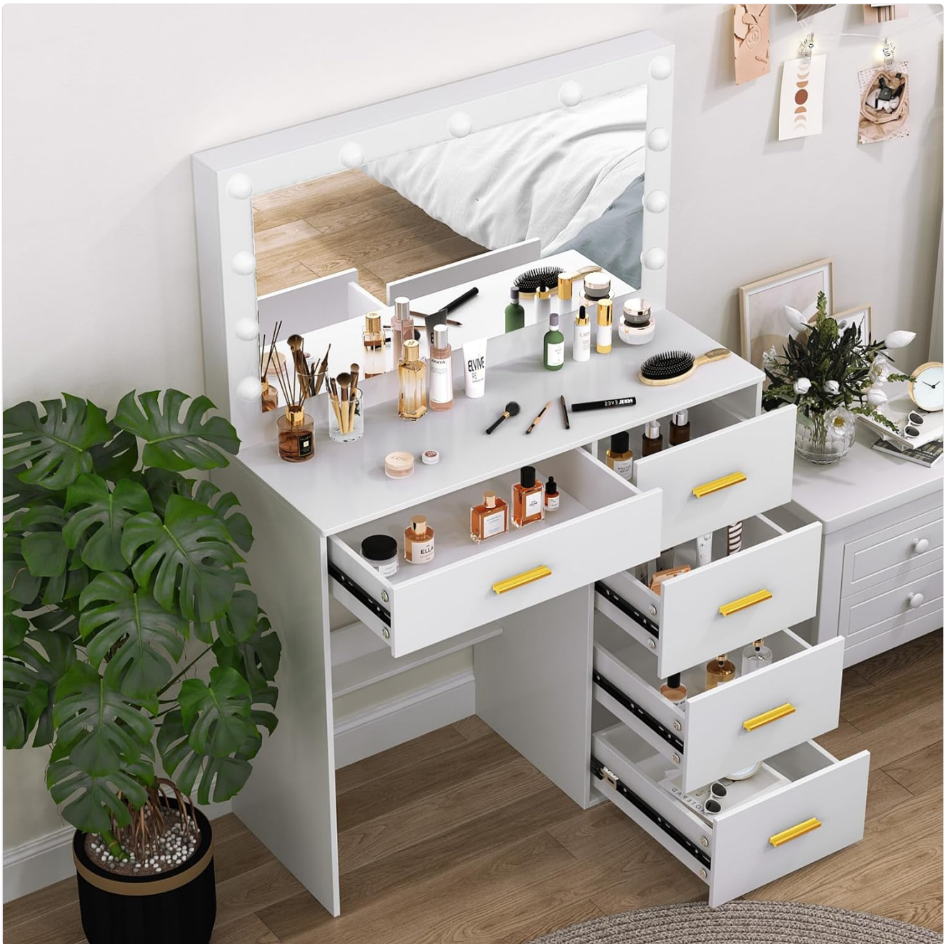
Image: Top-down view of the vanity desk with multiple drawers open, illustrating the ample storage capacity for various items.