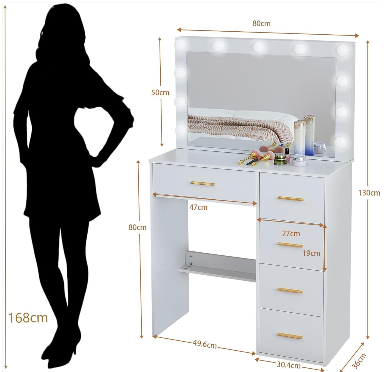
Image: Diagram showing the dimensions and various components of the vanity desk, useful for identifying parts during assembly.