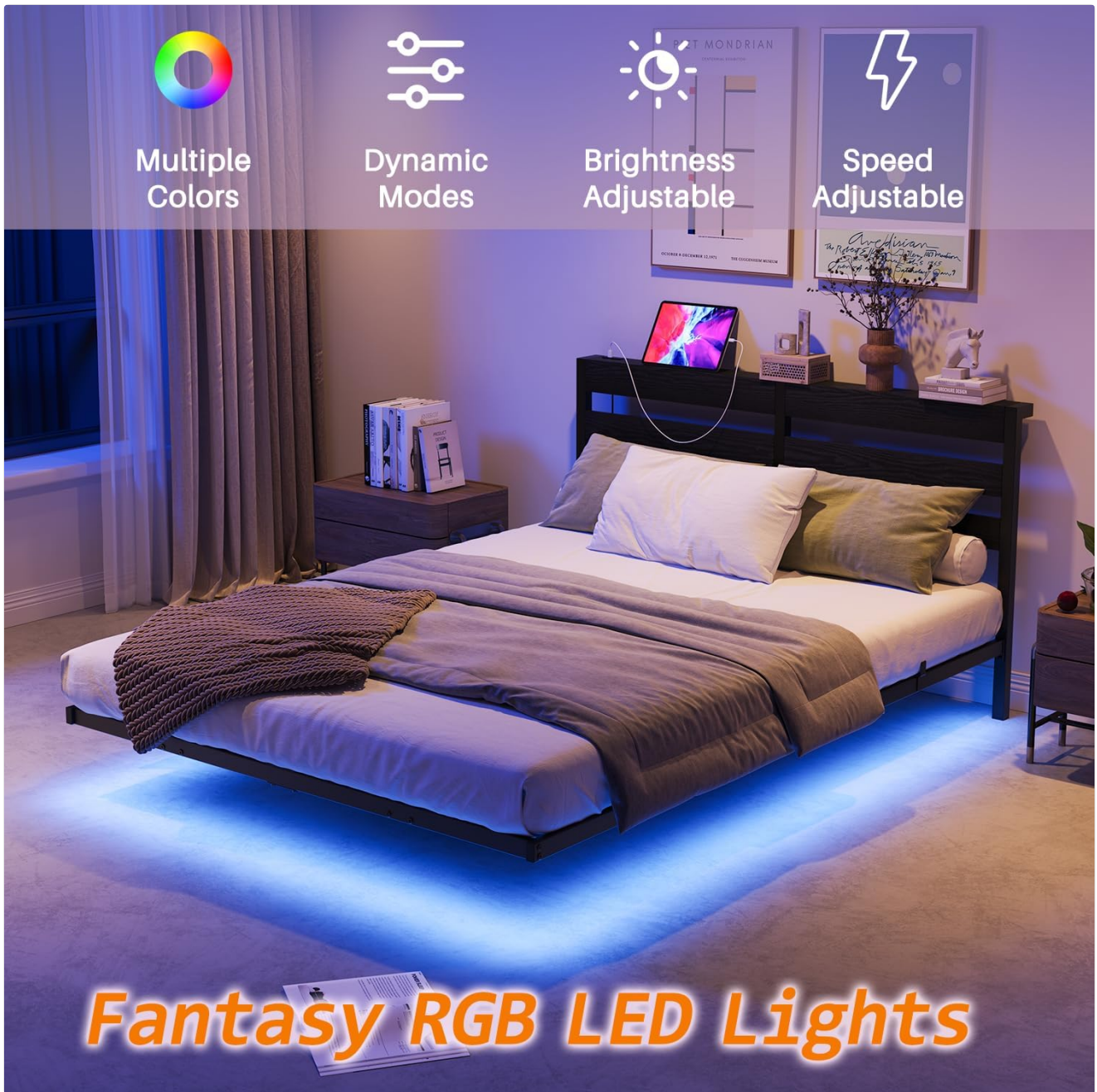
Image: The bed frame with blue LED underglow, accompanied by icons indicating multiple colors, dynamic modes, adjustable brightness, and speed control for the LED lights.