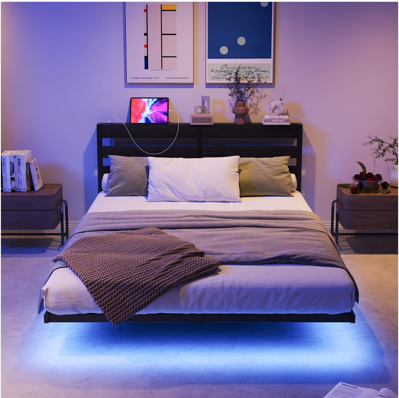
Image: The VERFARM floating bed frame illuminated by a blue LED underglow, showcasing the ambient lighting feature.

Your browser does not support the video tag.