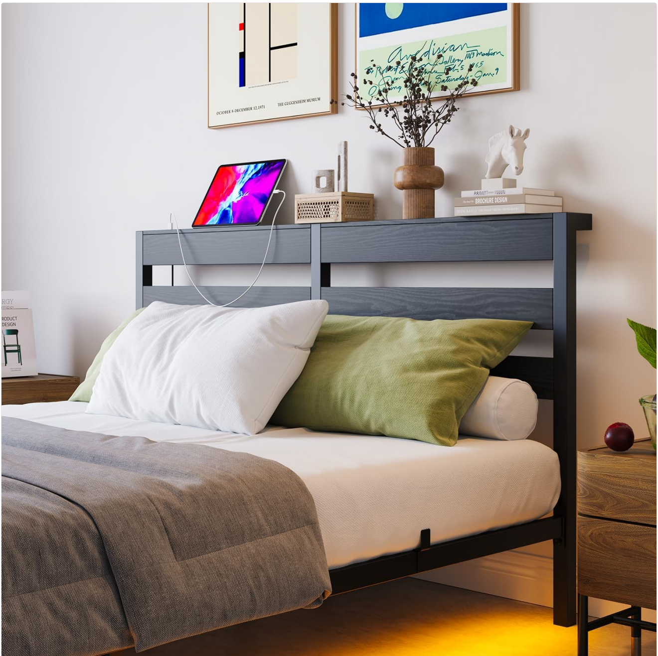
Image: The headboard with its storage shelves, displaying a tablet charging via the integrated USB port, alongside decorative items.