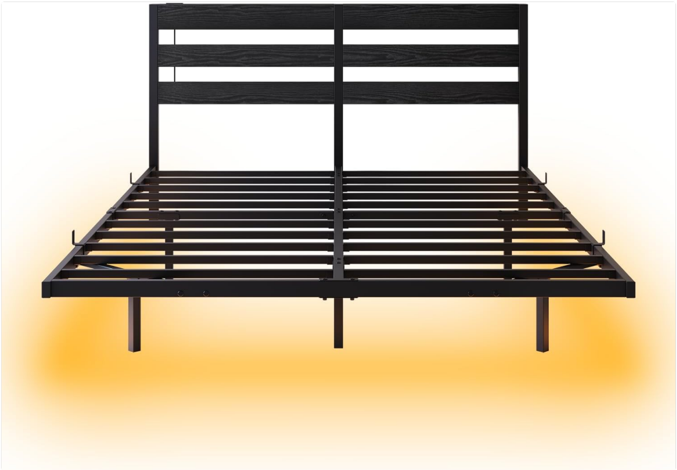
Image: The internal structure of the VERFARM floating bed frame, showing the metal slats and support legs, illuminated by a yellow underglow.