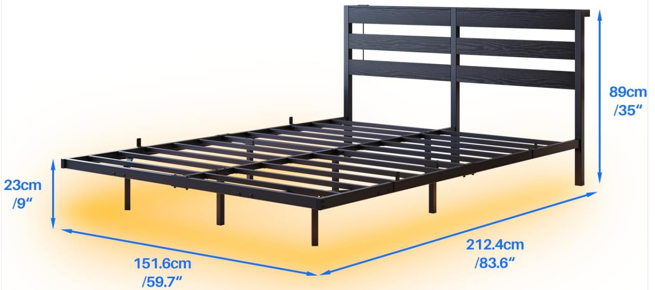
Image: The VERFARM floating bed frame with integrated LED lighting creating a warm yellow glow underneath.