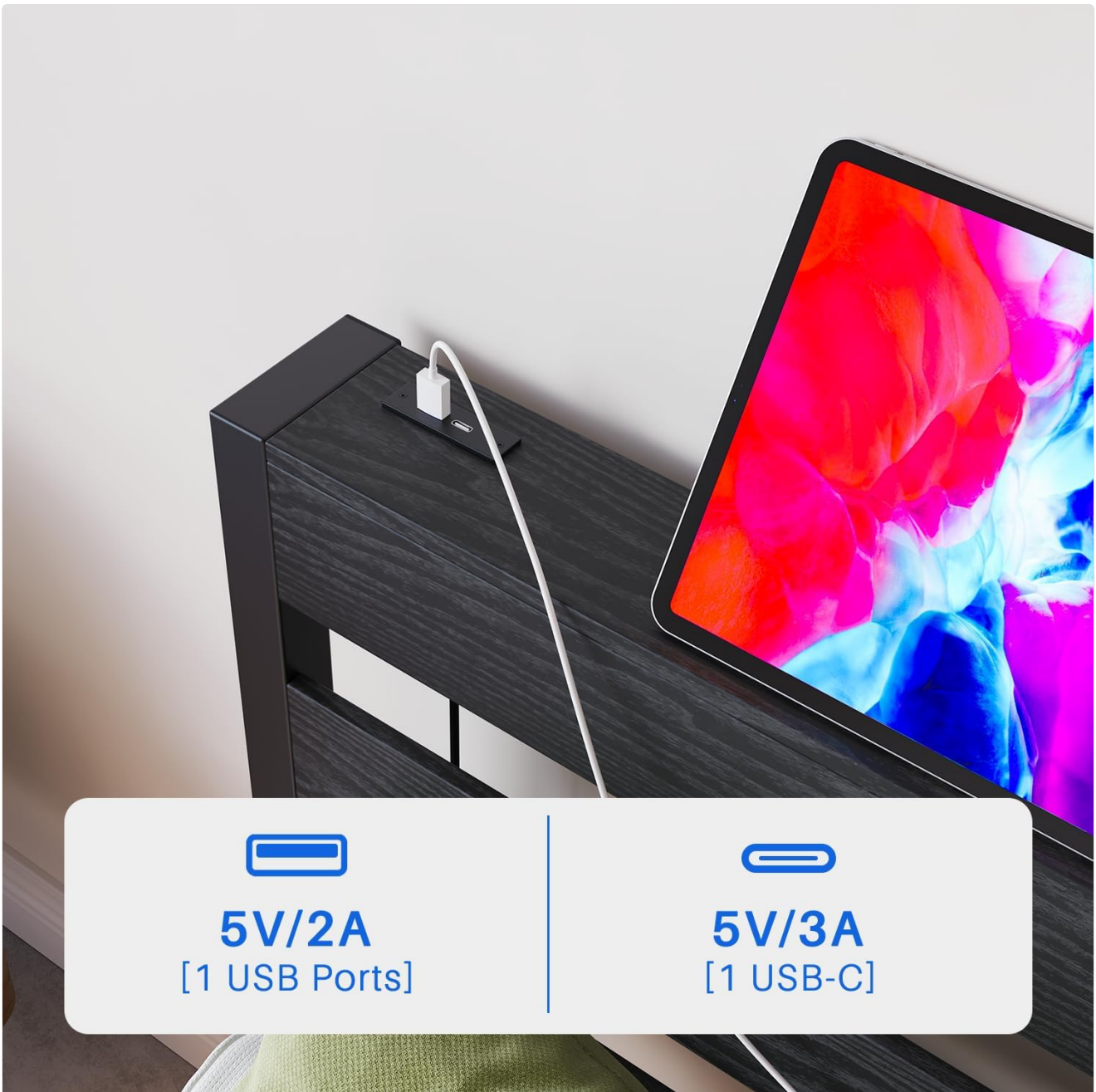
Image: A close-up view of the integrated USB (5V/2A) and USB-C (5V/3A) charging ports located on the headboard, with a tablet connected for charging.