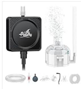
Image: Visual guide for installing the air pump kit.