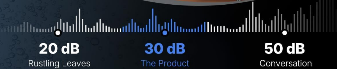
Image: Illustrates the ultra-quiet operation of the air pump, producing only 30 dB of noise.