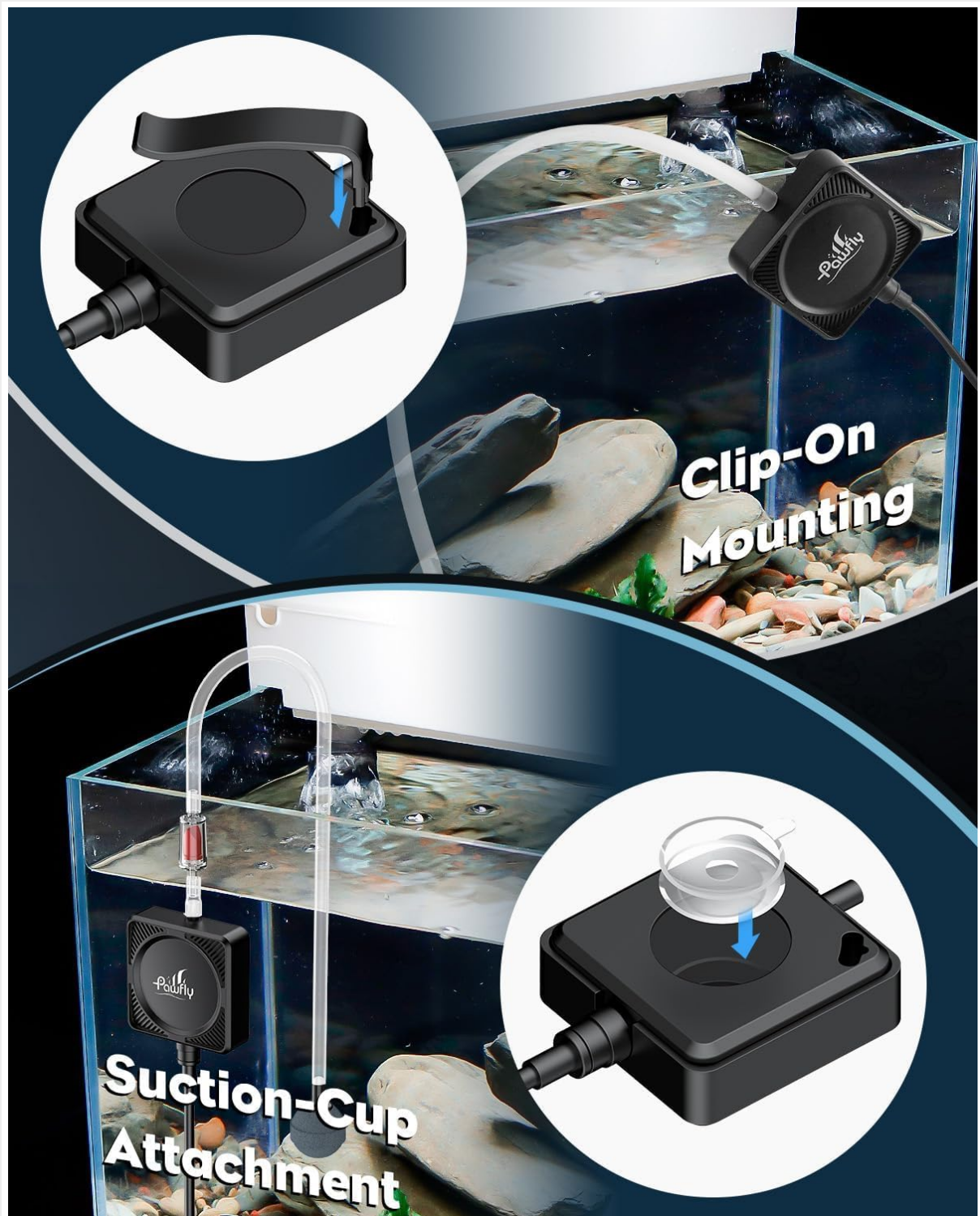
Image: Demonstrates clip-on and suction cup mounting options for the air pump.