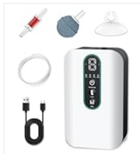
Image: Check valve installation for preventing water back-siphoning.