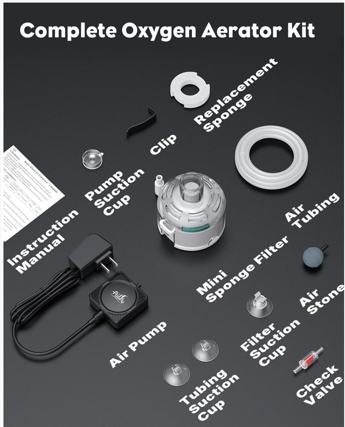
Image: Complete Oxygen Aerator Kit showing all included parts.