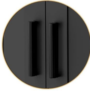
High quality handle