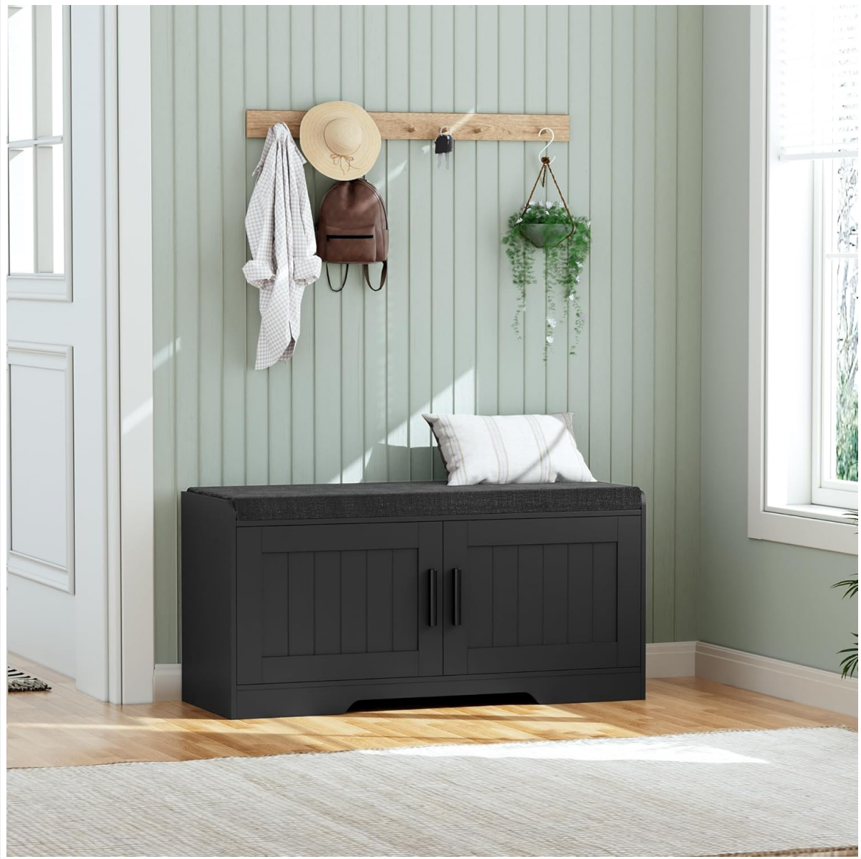
Figure 1: Homleke 2-Tier Storage Bench (Model BS30H)