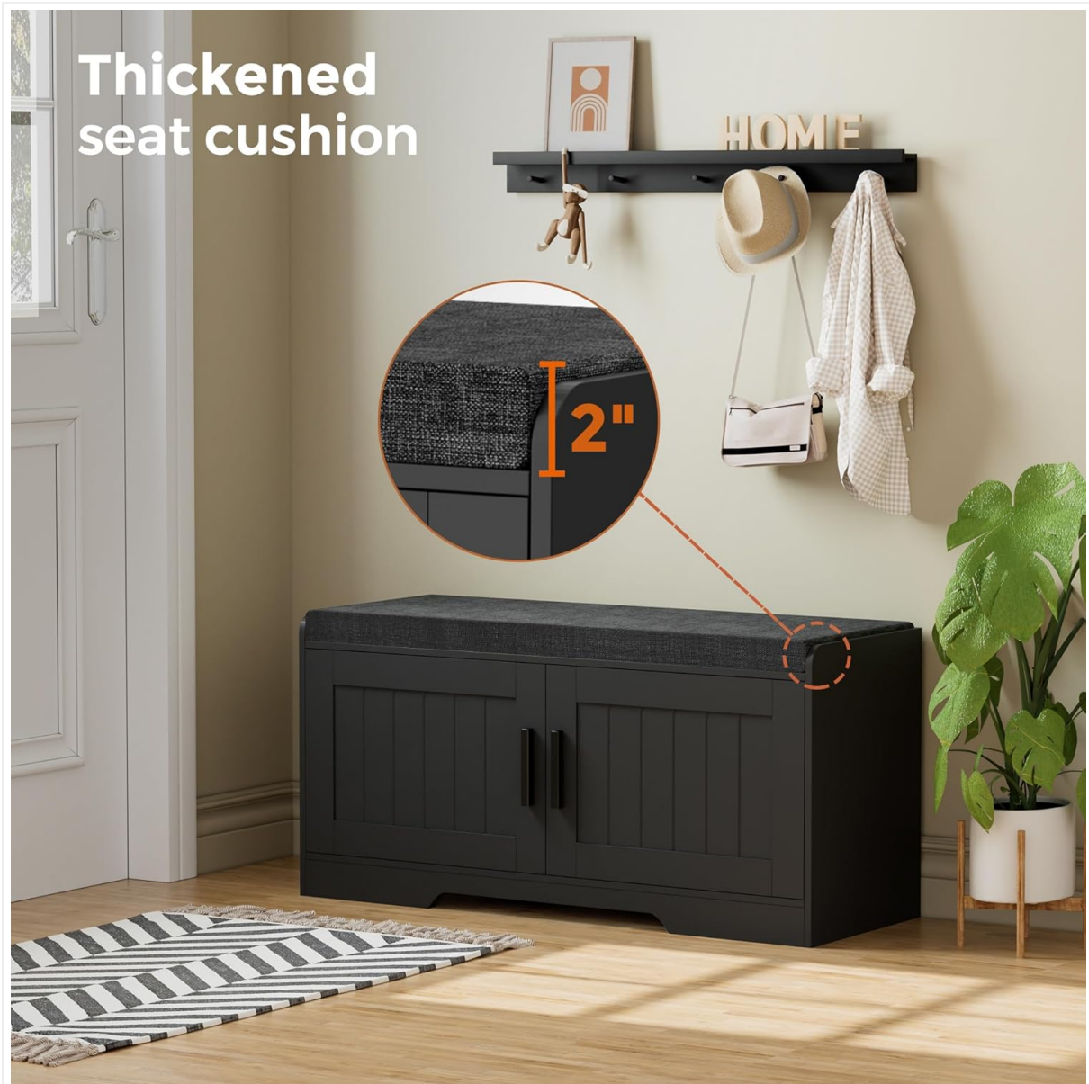
Figure 2: Thickened Padded Seat Cushion