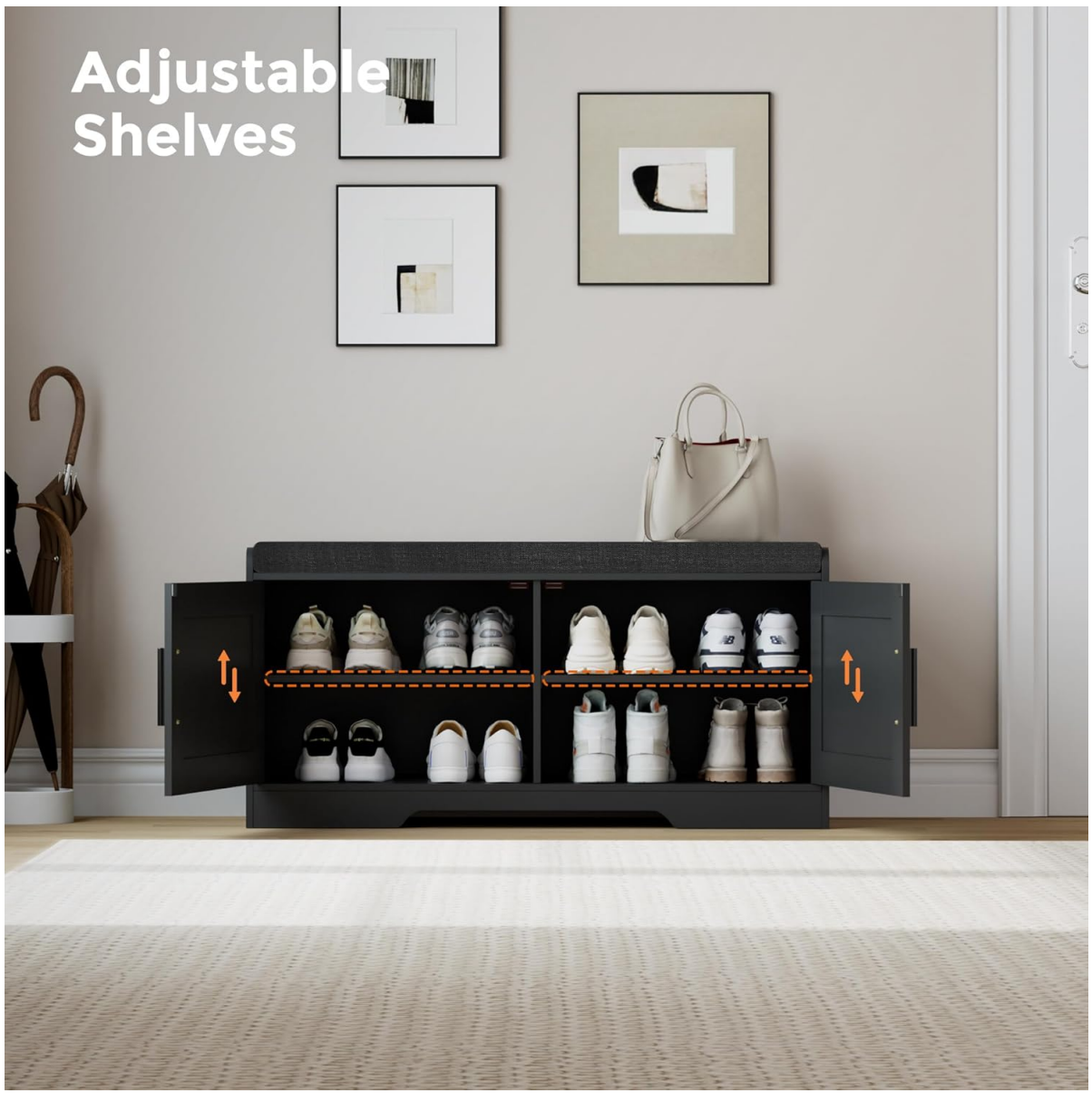
Figure 3: Adjustable Shelves for Versatile Storage