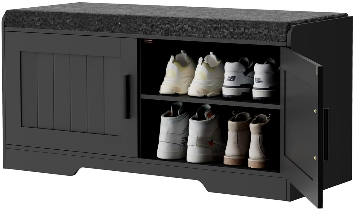
Figure 4: Key Features for Assembly and Use