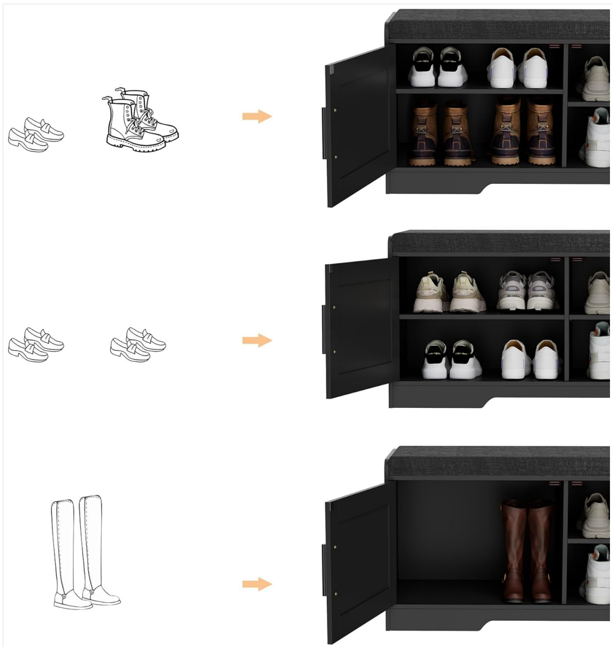
Figure 6: Flexible Storage for Various Footwear