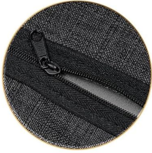
Removable cushion cloth cover