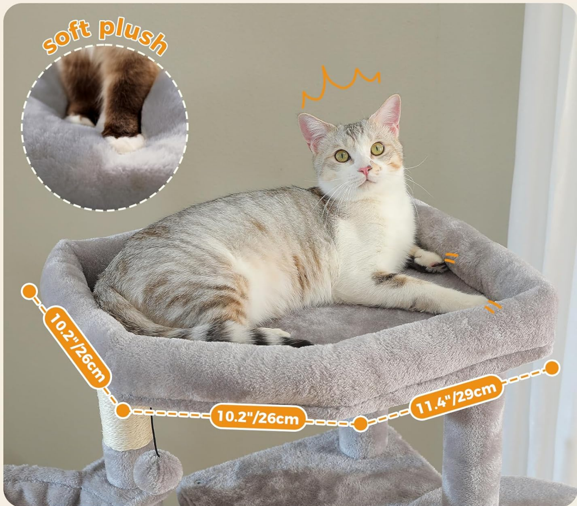
Figure 5.1: The extra-large top perch offers ample space for relaxation.

Provide feline royalty of all sizes with a spacious perch for ultimate comfort and supervision of their domain.