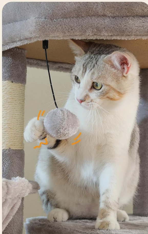
2 Dangling Balls