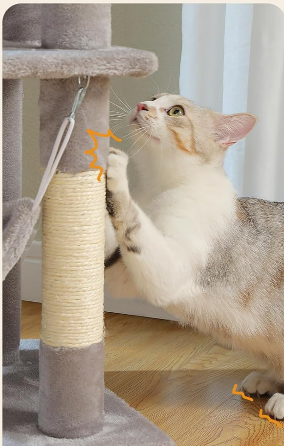
5 Natural Sisal Scratching Posts