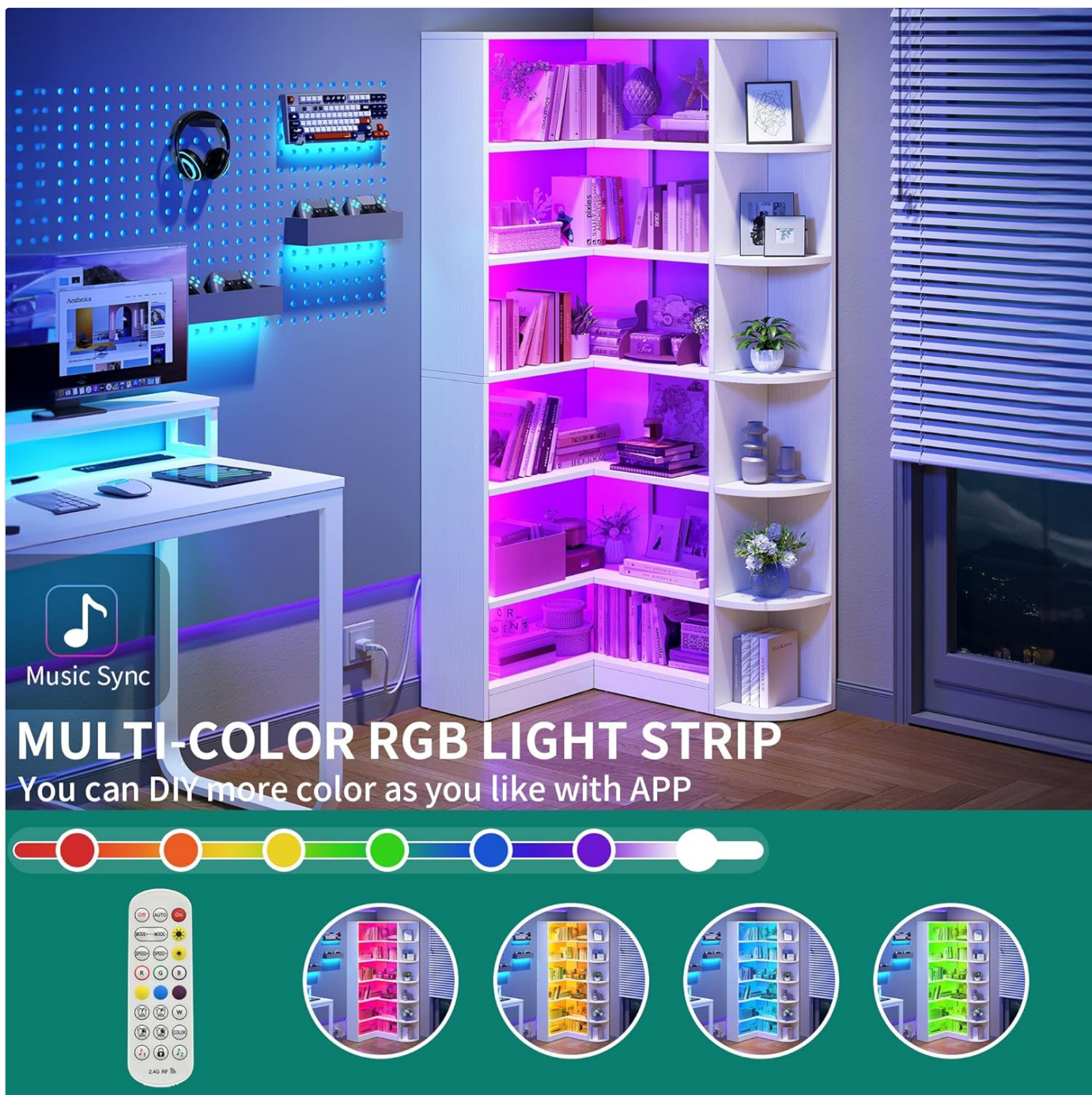
Image 6.1: The remote control for the LED lights, illustrating various color options and control features available for the bookshelf's illumination.

Your browser does not support the video tag.