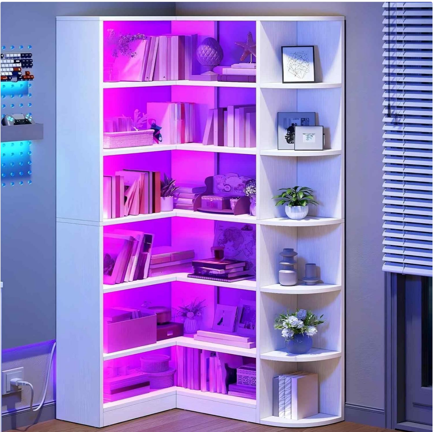
Image 1.1: The YITAHOME Corner Bookshelf with LED Light, showcasing its L-shaped design and vibrant purple LED illumination, filled with books and decorative items.