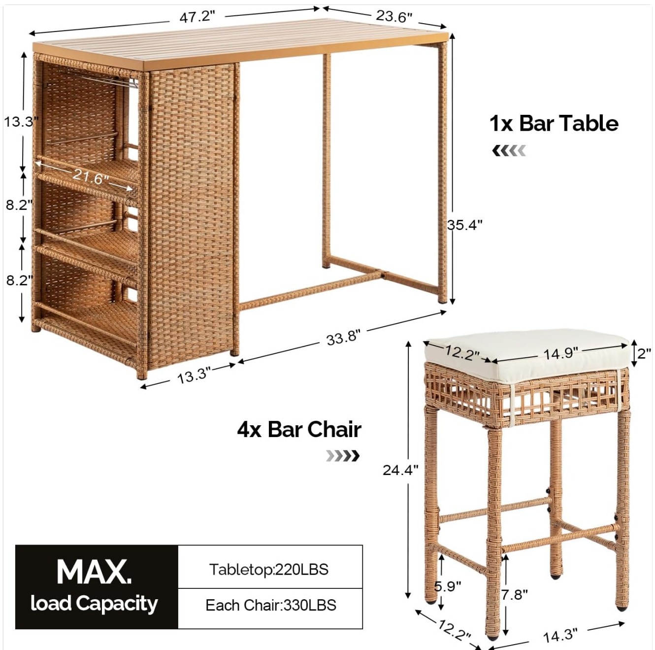
Image Description: This image displays a detailed diagram of the VINGLI bar table and one bar chair, illustrating their dimensions and maximum load capacities. The table measures 47.2 inches in length, 23.6 inches in width, and 35.4 inches in height, with a tabletop load capacity of 220 lbs. Each bar chair measures 12.2 inches in width, 14.9 inches in depth, and 24.4 inches in height, with a load capacity of 330 lbs. Key measurements for various parts of the furniture are indicated with arrows.