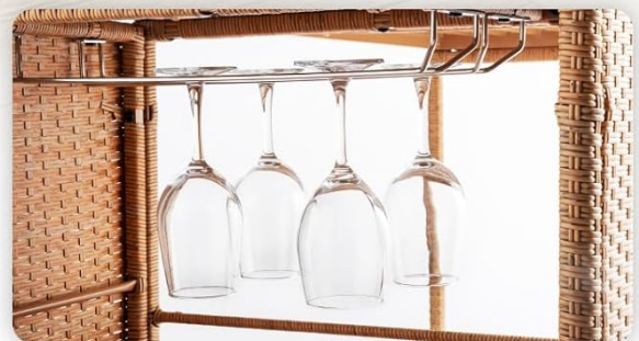
Image Description: This image provides a closer view of the VINGLI bar table's integrated storage unit. It highlights the wine glass rack, where several wine glasses are hung upside down. Below the rack, there are shelves holding bottles and small jars, showcasing the convenient storage solutions for both indoor and outdoor use.