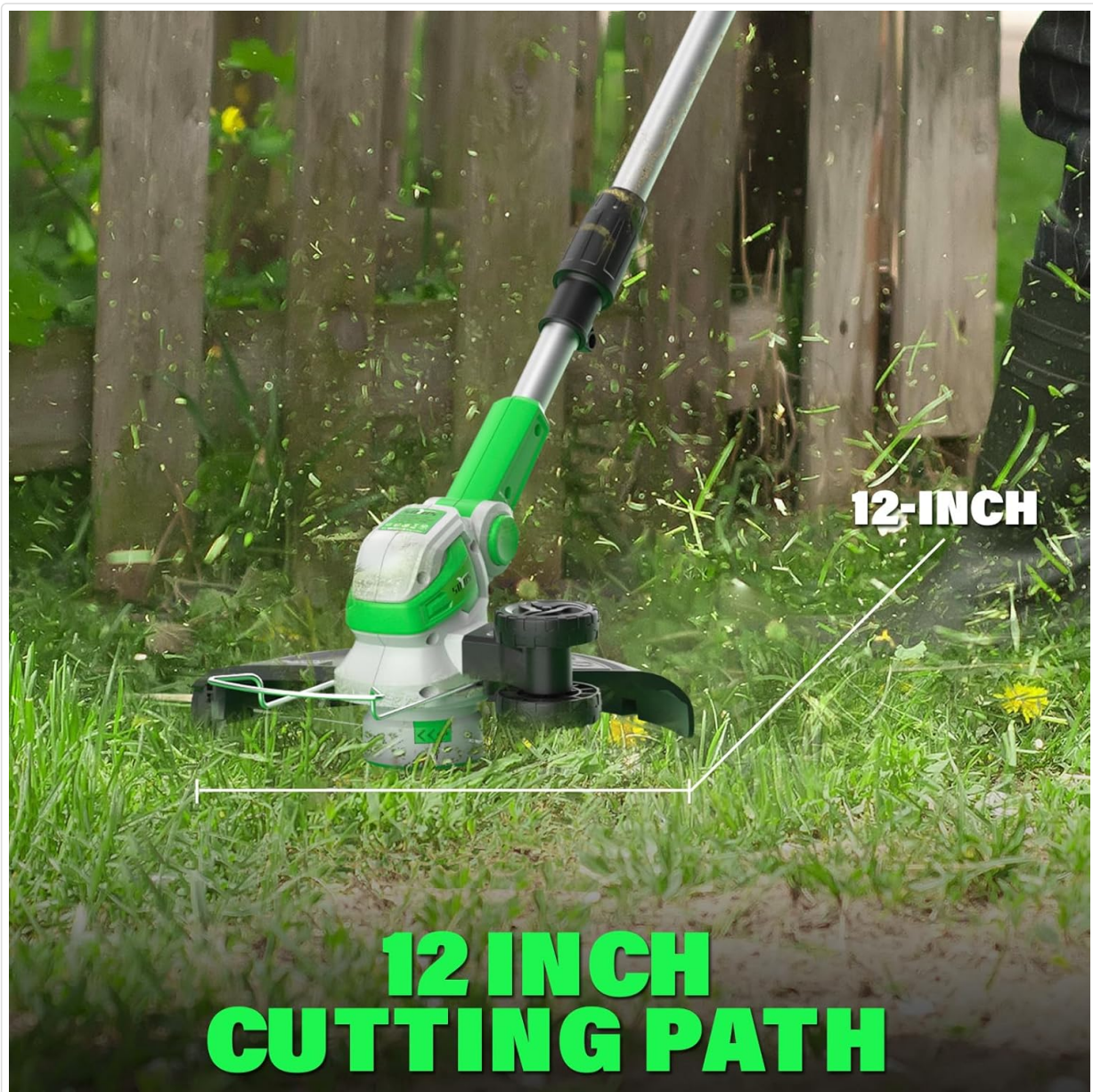
Figure 4: The weed wacker in action, demonstrating its 12-inch cutting path for efficient trimming.