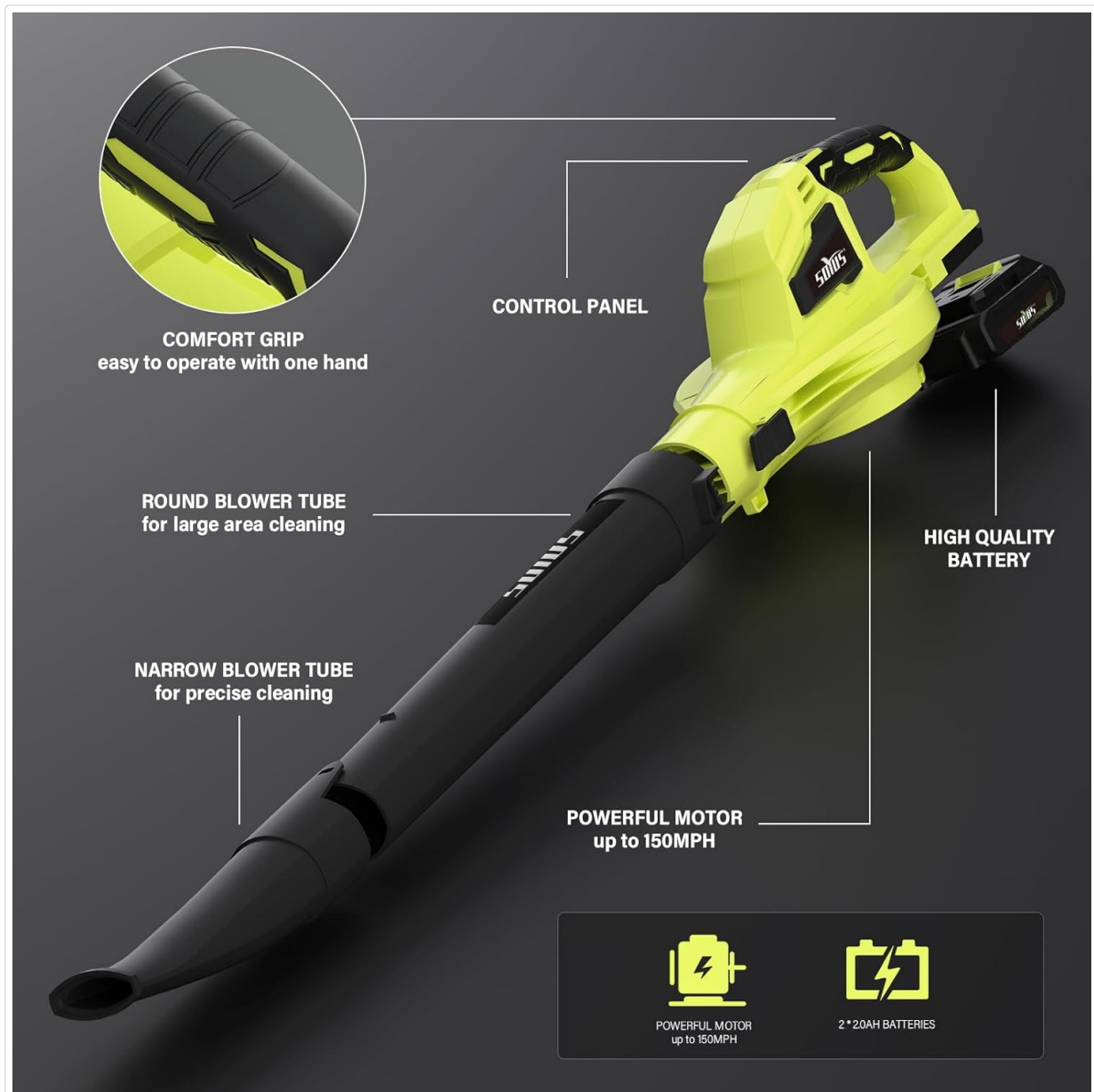
Figure 3: Detailed view of the leaf blower with labeled parts: Comfort Grip, Control Panel, Round Blower Tube, Narrow Blower Tube, Powerful Motor, and High Quality Battery connection.