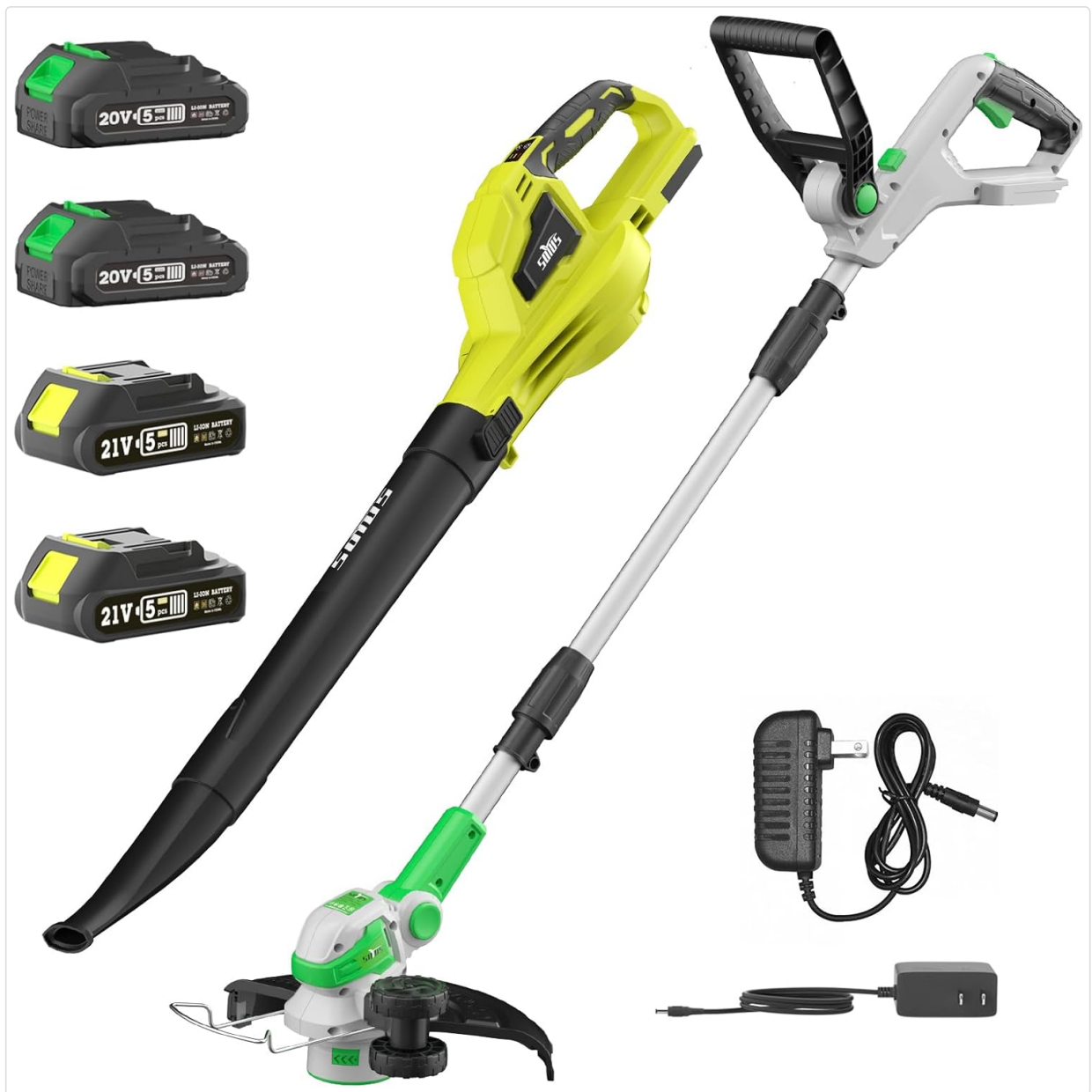
Figure 1: Overview of the SOYUS 20V Cordless Weed Wacker and Leaf Blower combo kit, including two 2.0Ah batteries and a charger.