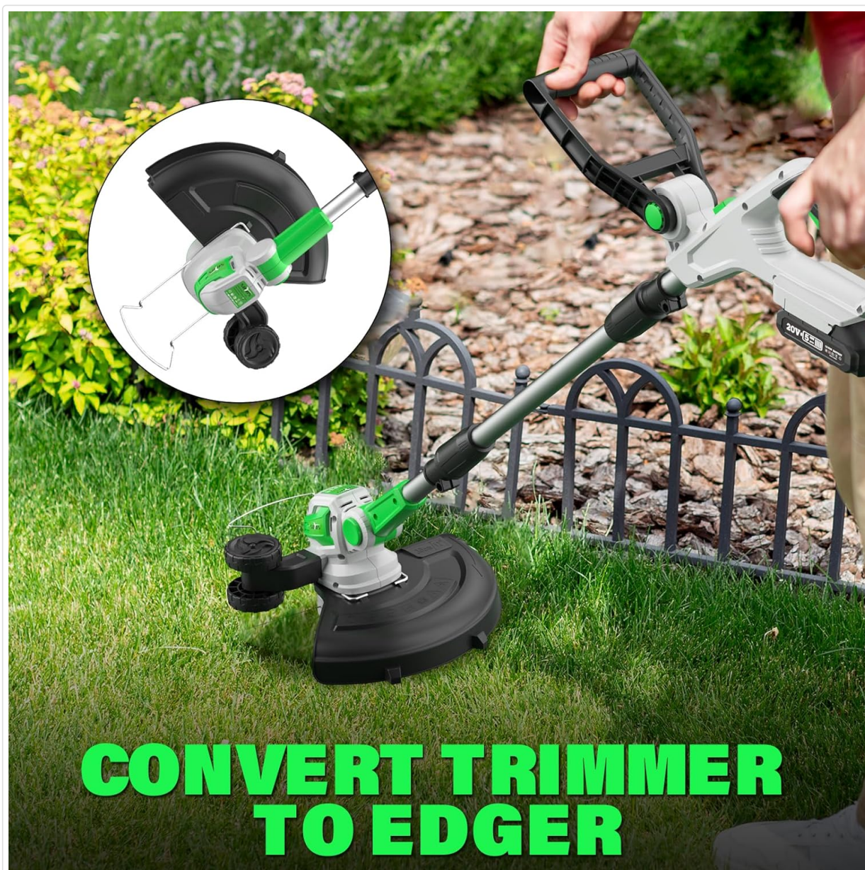
Figure 5: The weed wacker demonstrating its 2-in-1 versatility, converting from a trimmer to an edger with a simple adjustment.