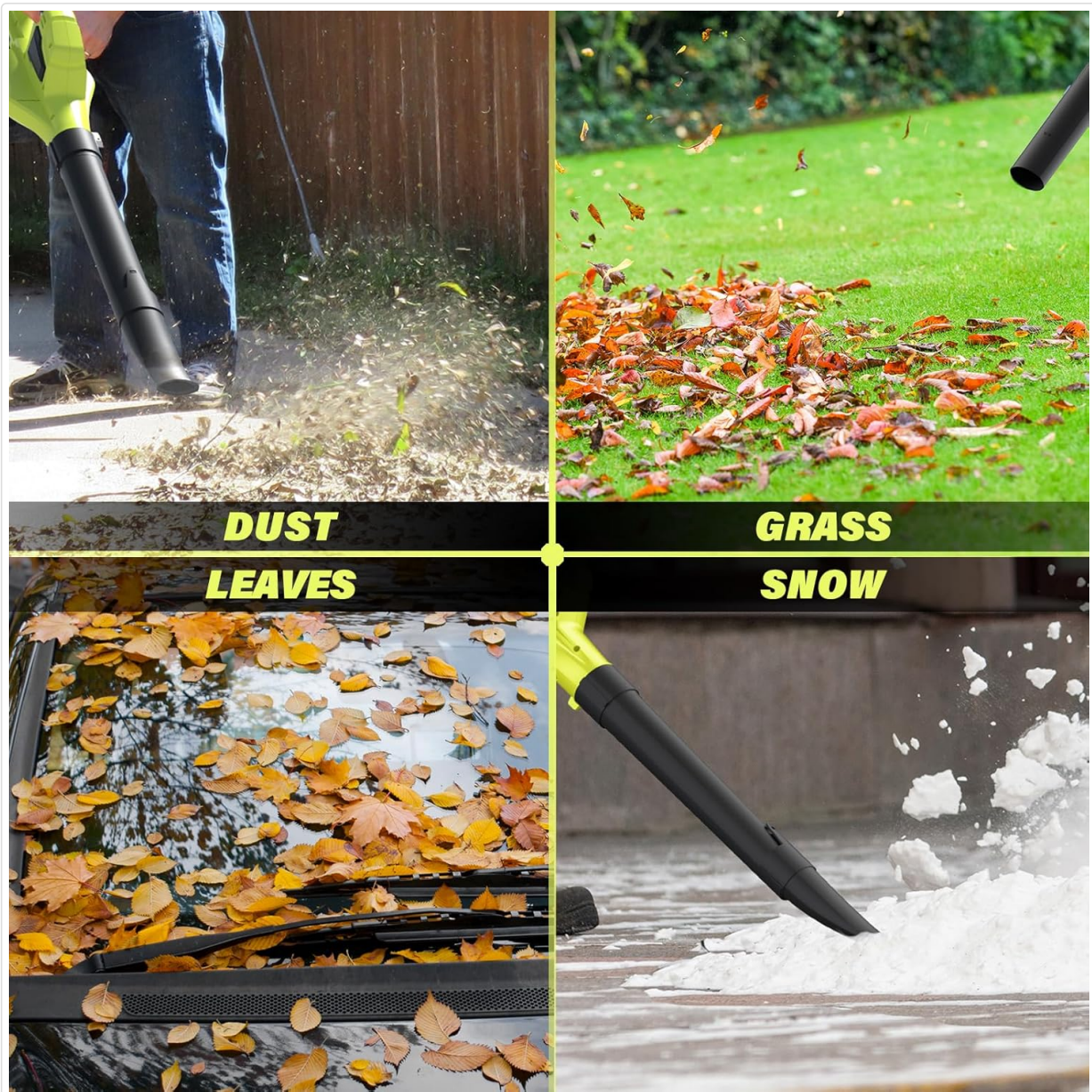
Figure 7: The leaf blower demonstrating its effectiveness in clearing various types of debris, including dust, leaves, grass clippings, and light snow.