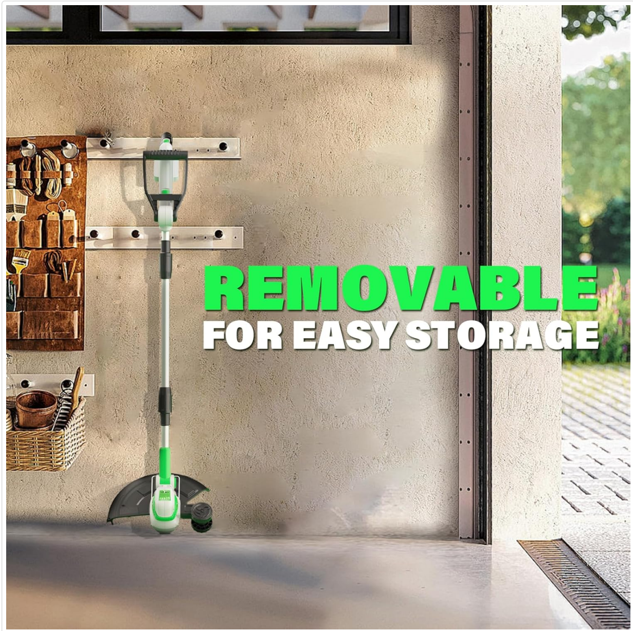
Figure 8: The weed wacker shown in a vertical storage position, highlighting its removable design for space-saving storage.

Both the weed wacker and leaf blower are designed for easy storage. The weed wacker can be disassembled or folded for compact storage. Store all components in a dry, secure location.