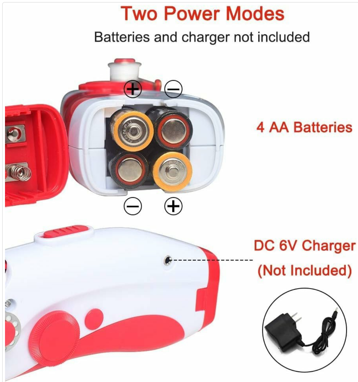
Image: Illustration of the battery compartment for 4 AA batteries and the DC 6V adapter input port. Batteries and adapter are not included.

Your sewing machine can be powered by two methods: