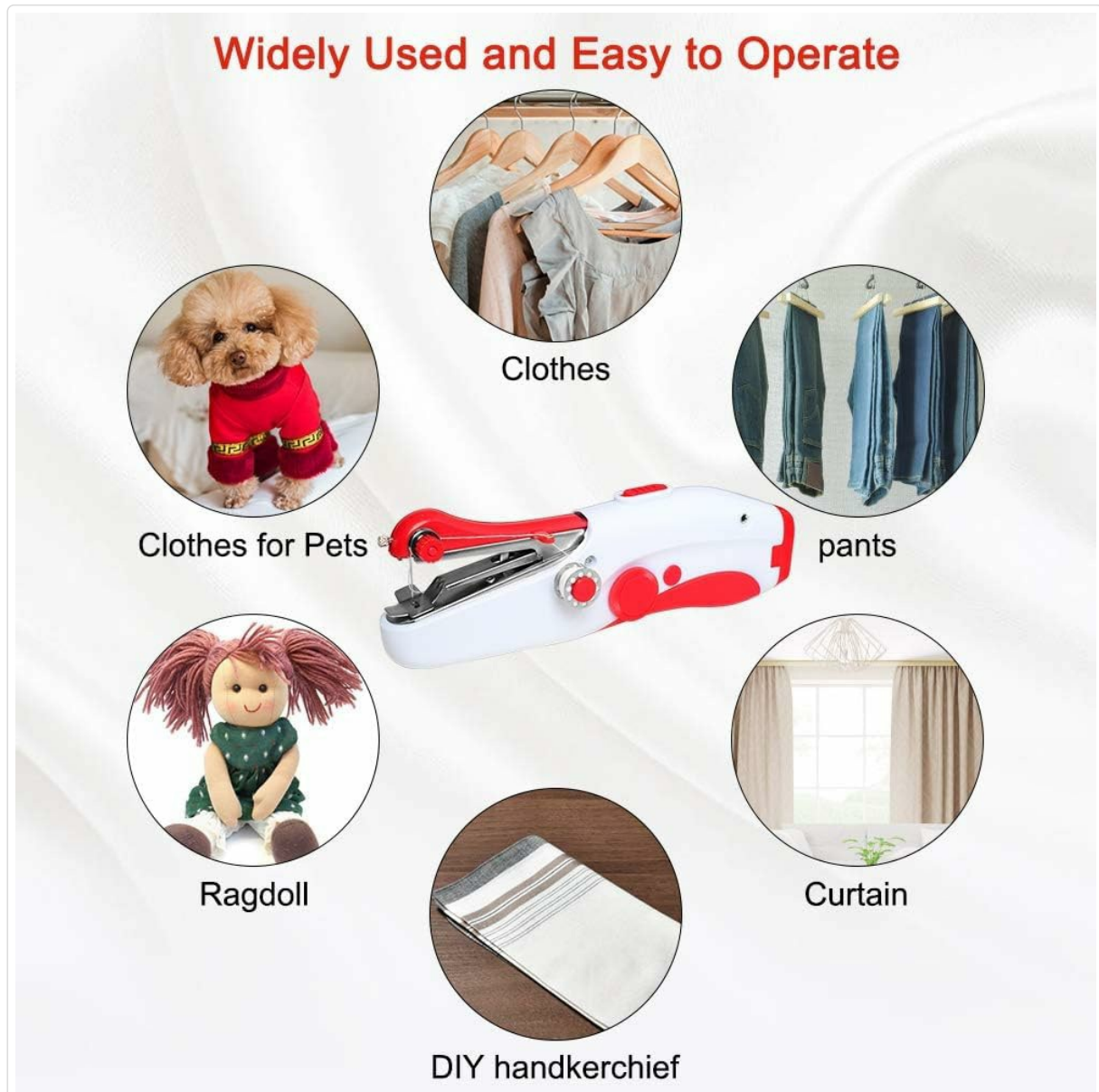
Image: Various applications for the MUOCOBU Handheld Sewing Machine, such as repairing clothes for pets, general garments, pants, creating ragdolls, DIY handkerchiefs, and mending curtains.

This machine is suitable for various light to medium fabrics, including cotton, linen, denim (thin), and felt. It is ideal for: