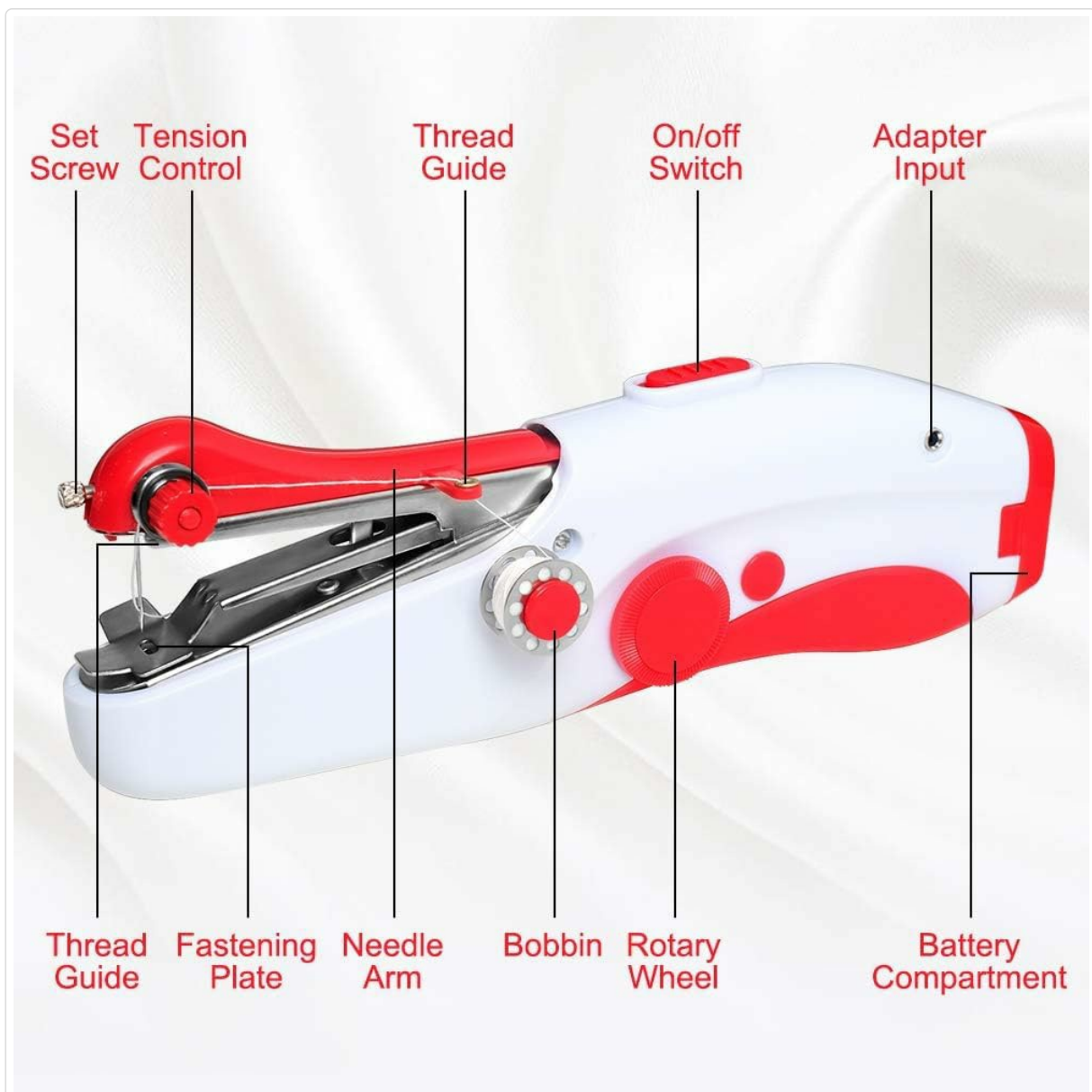
Image: Labeled components of the MUOCOBU Handheld Sewing Machine. Key parts include the Set Screw, Tension Control, Thread Guides, On/off Switch, Adapter Input, Fastening Plate, Needle Arm, Bobbin, Rotary Wheel, and Battery Compartment.