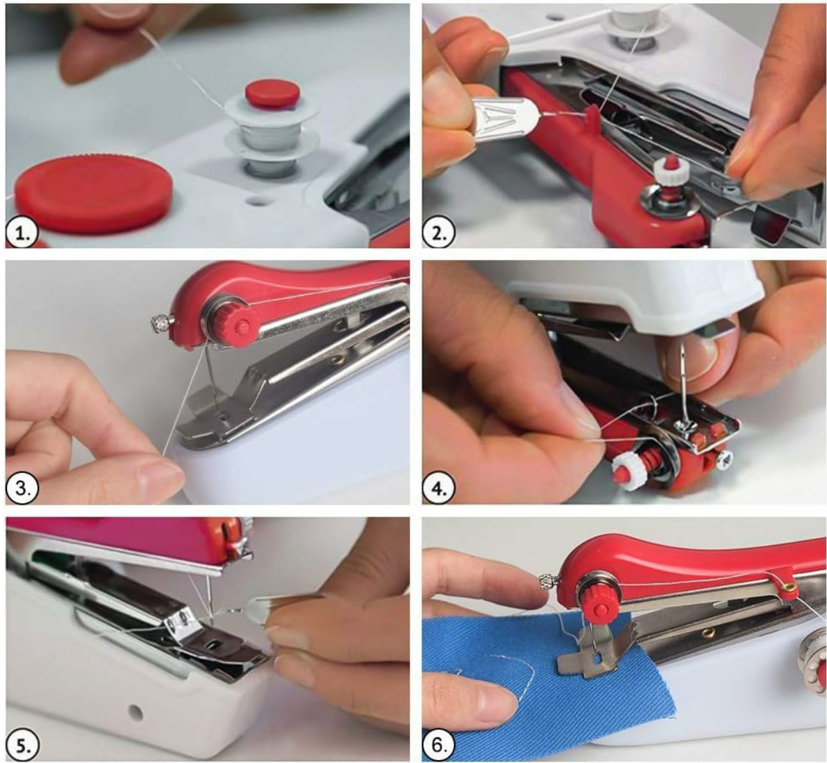
Image: A step-by-step visual guide demonstrating the threading process for the handheld sewing machine.