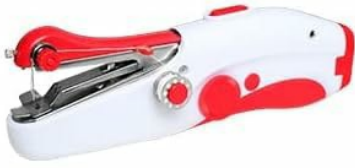
1*Portable Sewing Machine